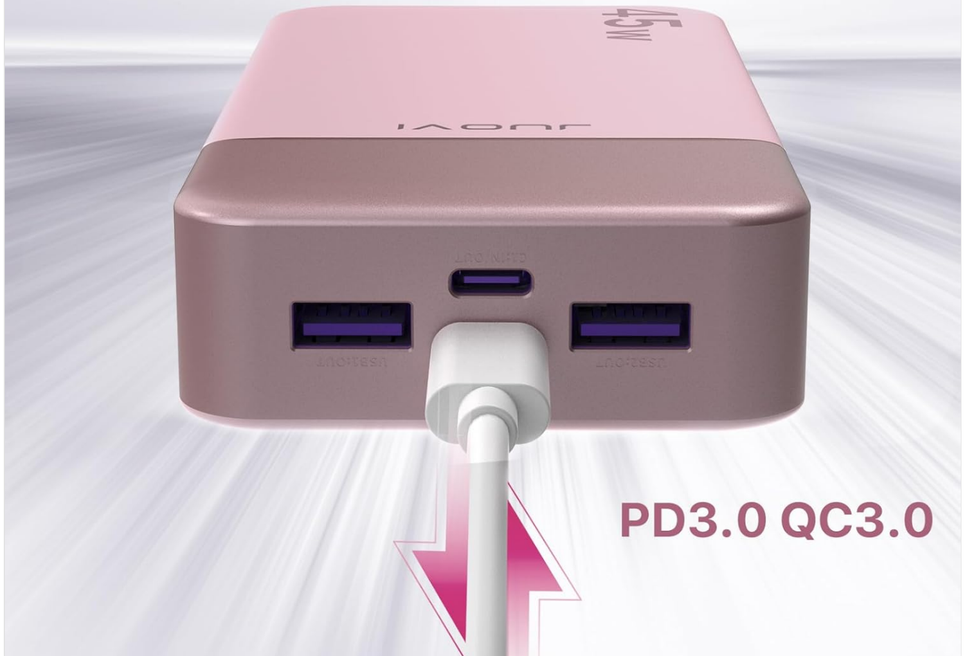
Image: Front view of the power bank, illustrating the two USB Type-C ports (input/output) and two USB Type-A ports (output), along with the digital battery display.