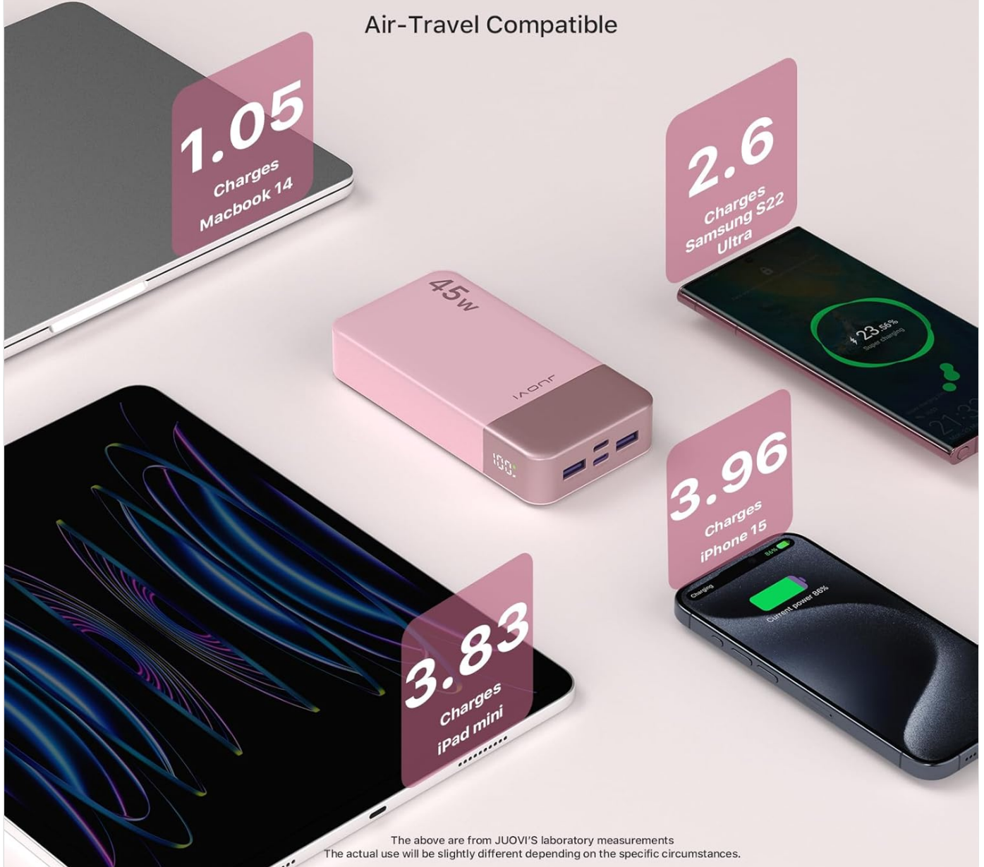
Image: Illustrates the massive 20000mAh capacity, capable of charging an iPhone 15 approximately 3.96 times, a MacBook 1.05 times, a Samsung S22 Ultra 2.6 times, and an iPad mini 3.83 times.