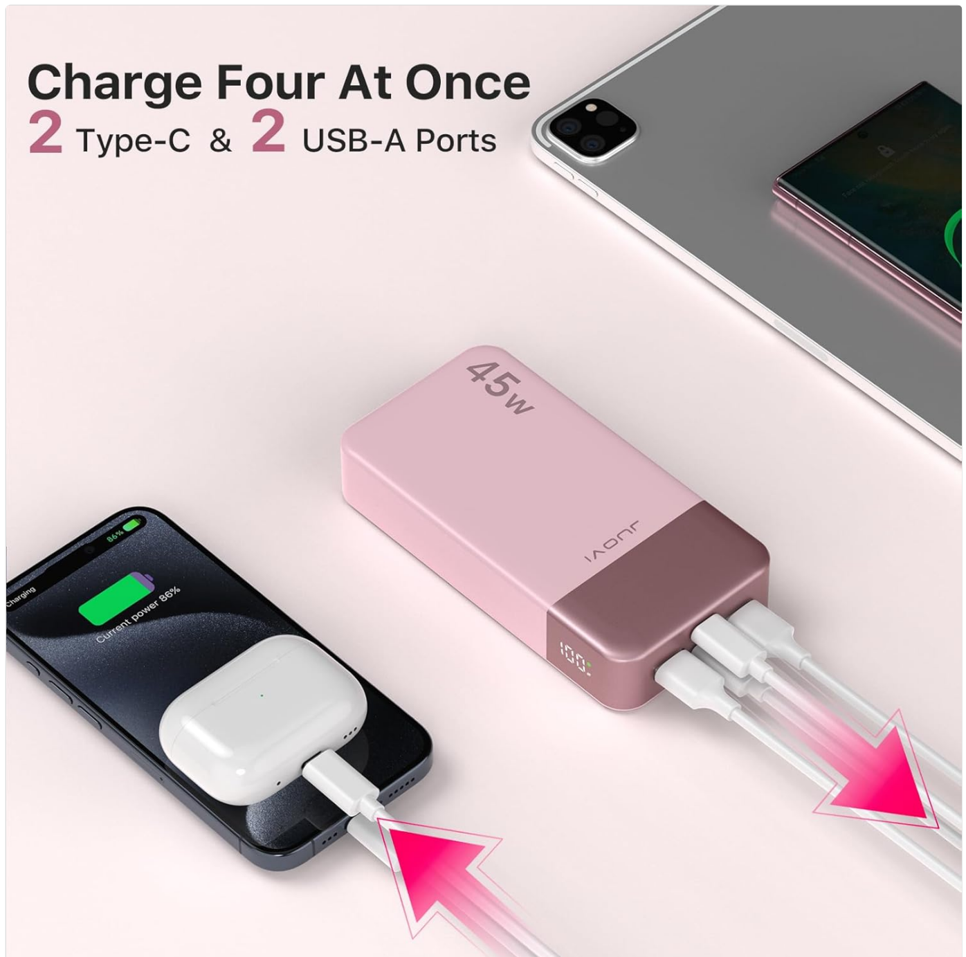
Image: The power bank can charge four devices at once using its two Type-C and two USB-A ports.