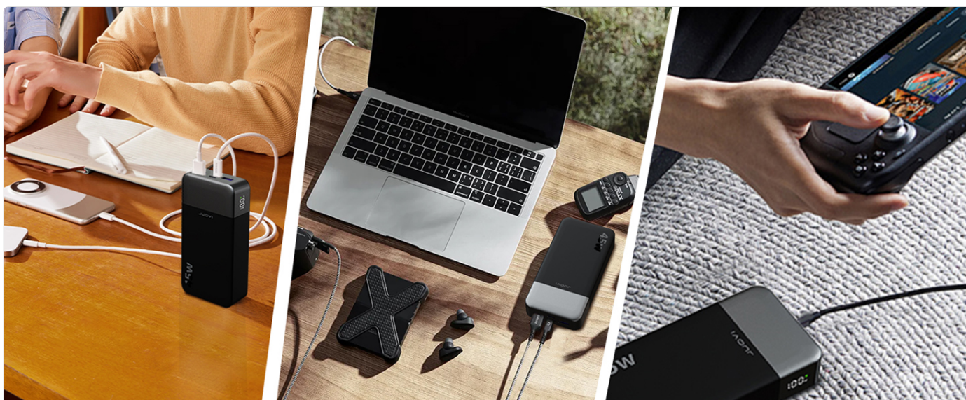
Image: Demonstrates the versatility of the power bank, charging various devices including smartphones, laptops, and portable gaming consoles.