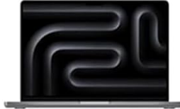
Macbook Pro 16