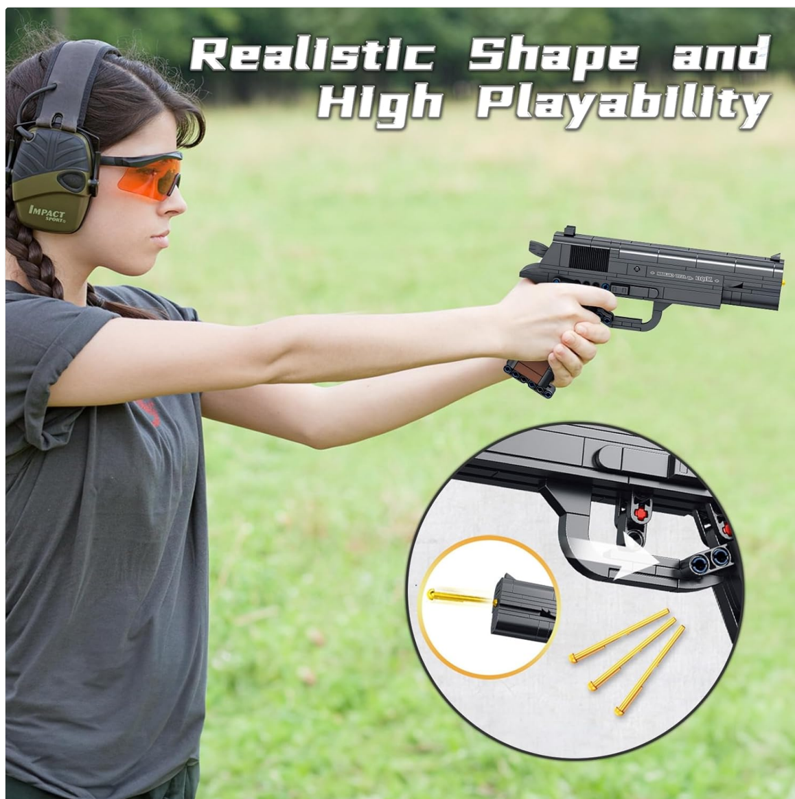
The M1911 model in use, highlighting its realistic design and interactive features.