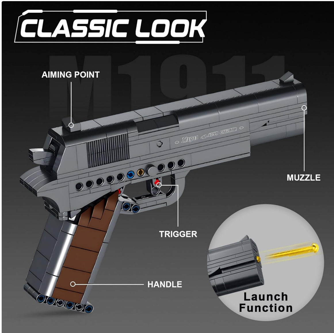
Key components of the M1911 model, including the aiming point, muzzle, trigger, handle, and launch function.