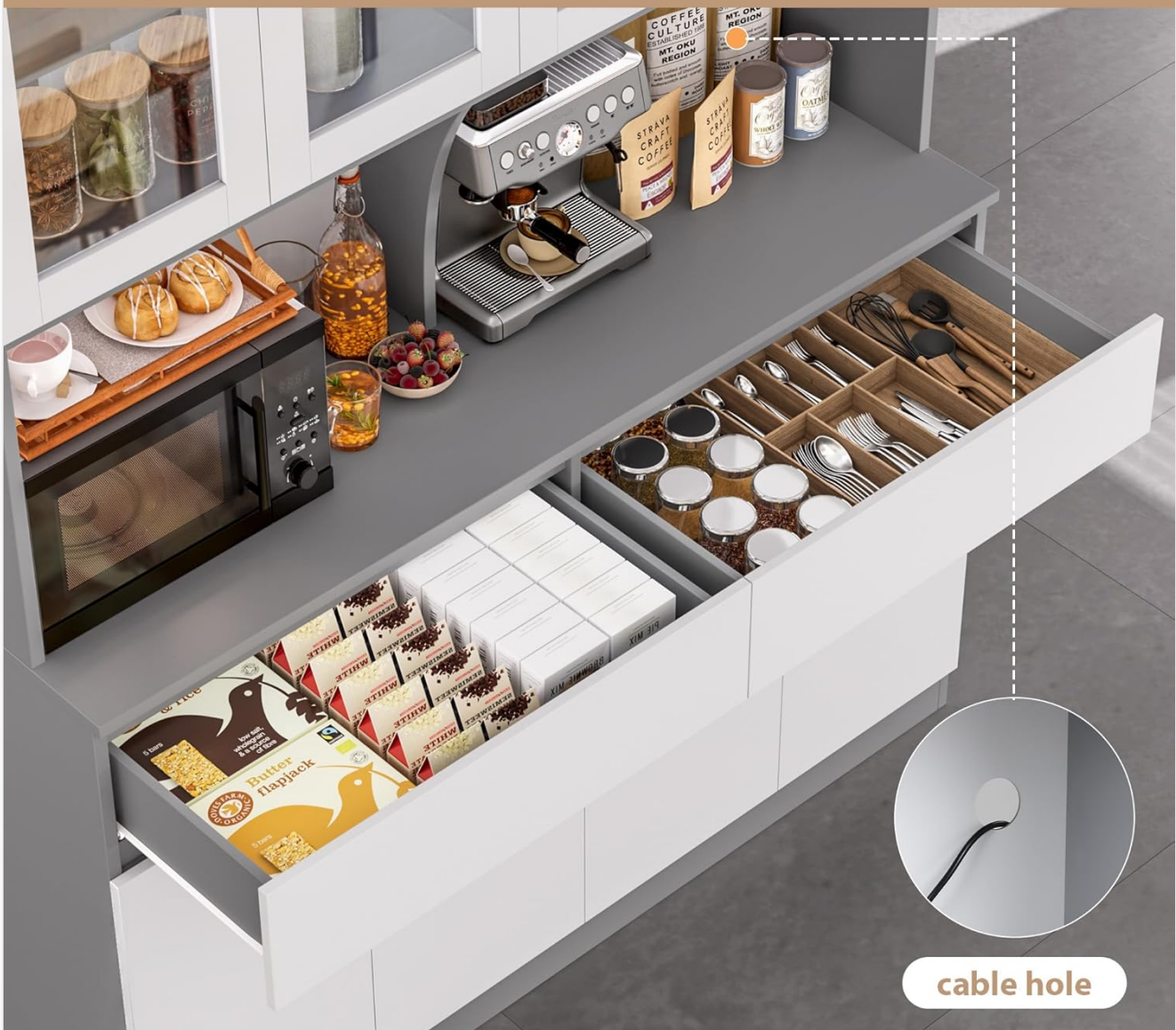
Figure 5.2: Detailed view of drawers and integrated cable management hole.