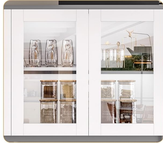
Tempered Glass Doors