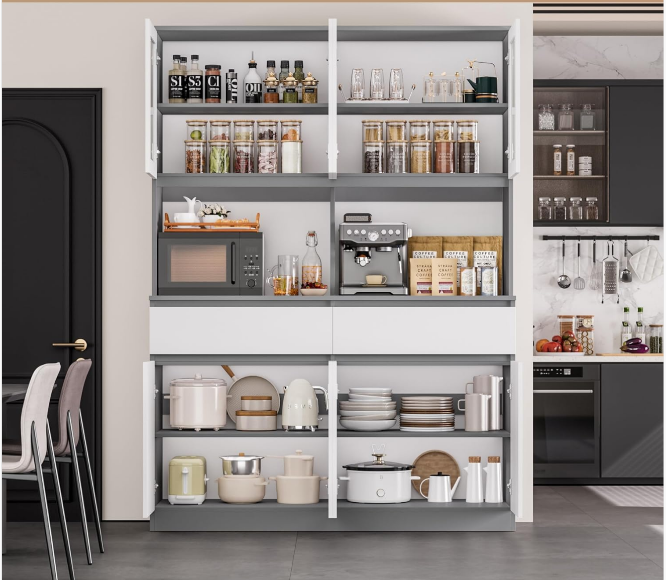
Figure 5.1: Cabinet with open doors revealing extensive storage areas.

Lots of storage areas for family china, stemware, and dishes, plus more!