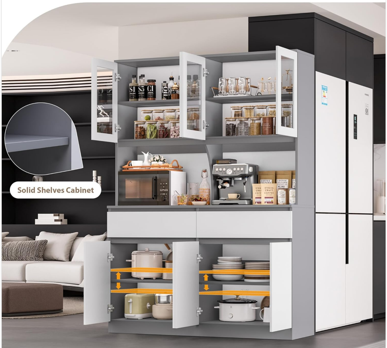
Figure 5.3: Illustration of adjustable shelves for customized storage.