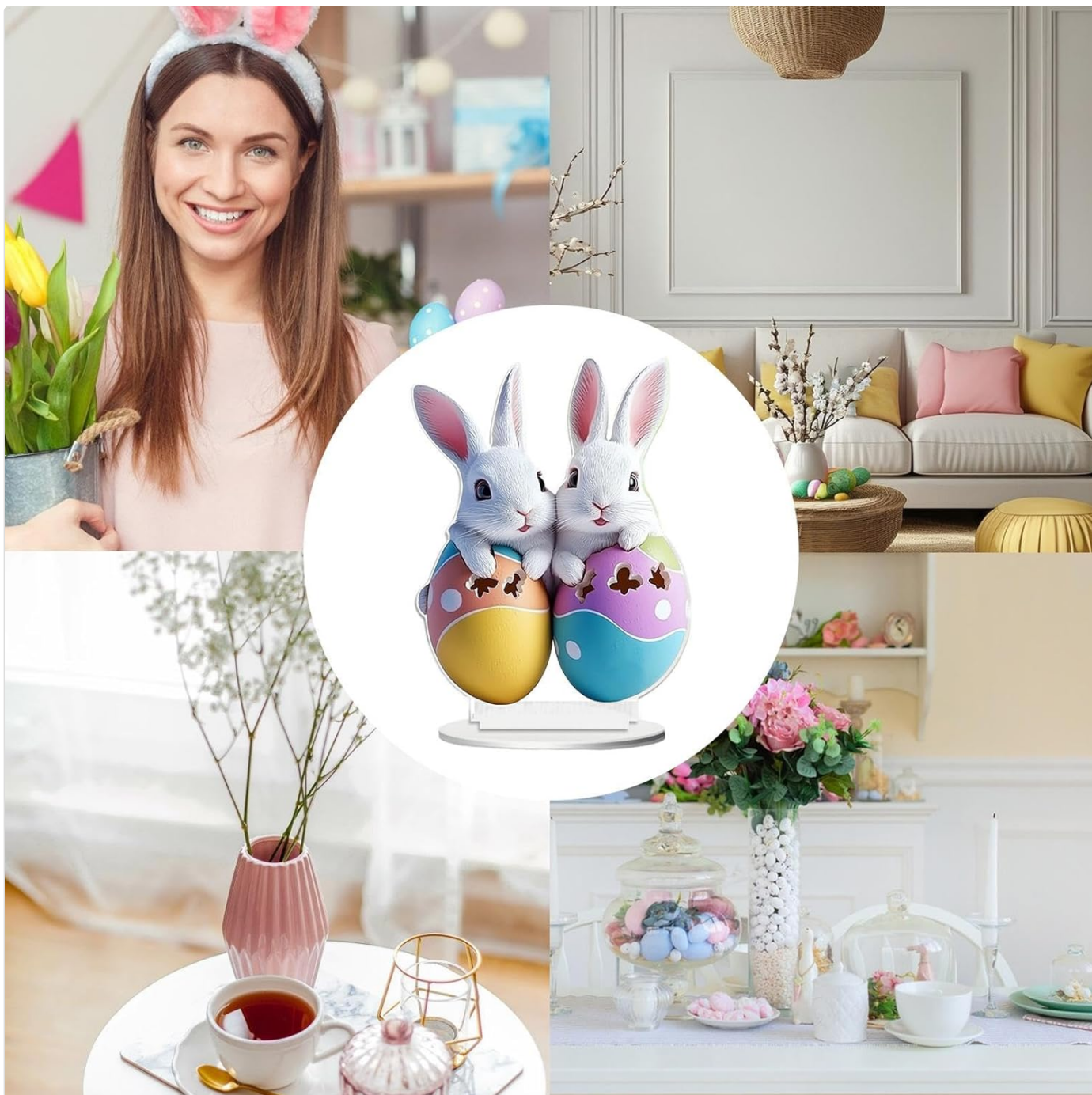
Image: Examples of the Easter bunny figurine displayed in different home environments.