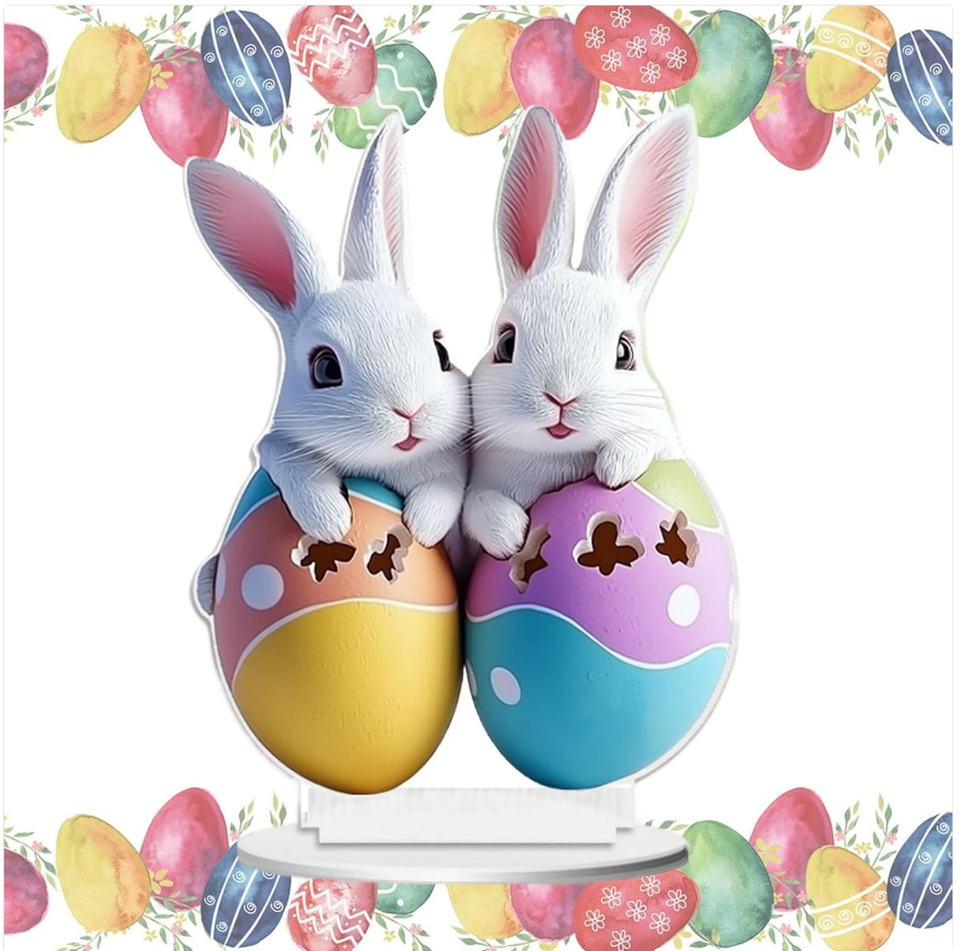
Image: The Easter Bunny Figurine (Scb585 variant) as the main product image.