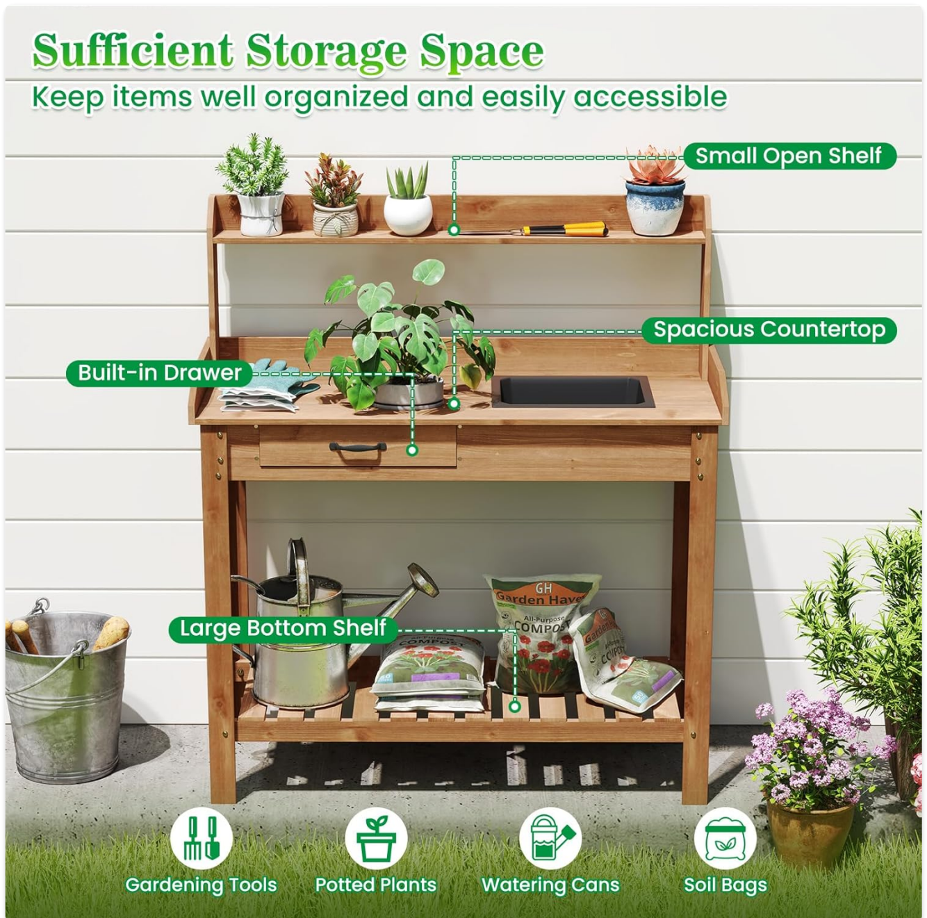
Figure 4: Illustration of the various storage areas and their typical uses.