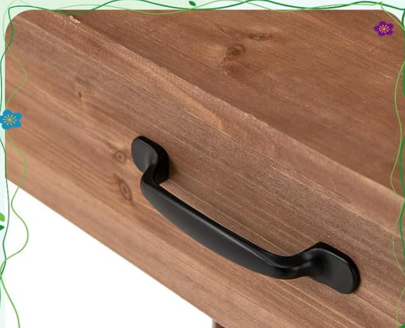
Convenient Metal Handle