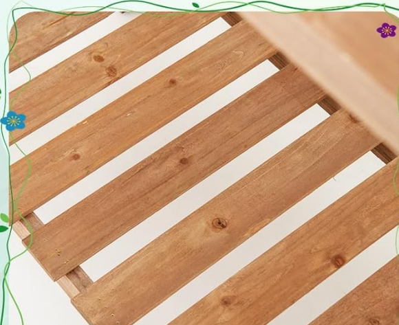
Ventilated Slatted Shelf