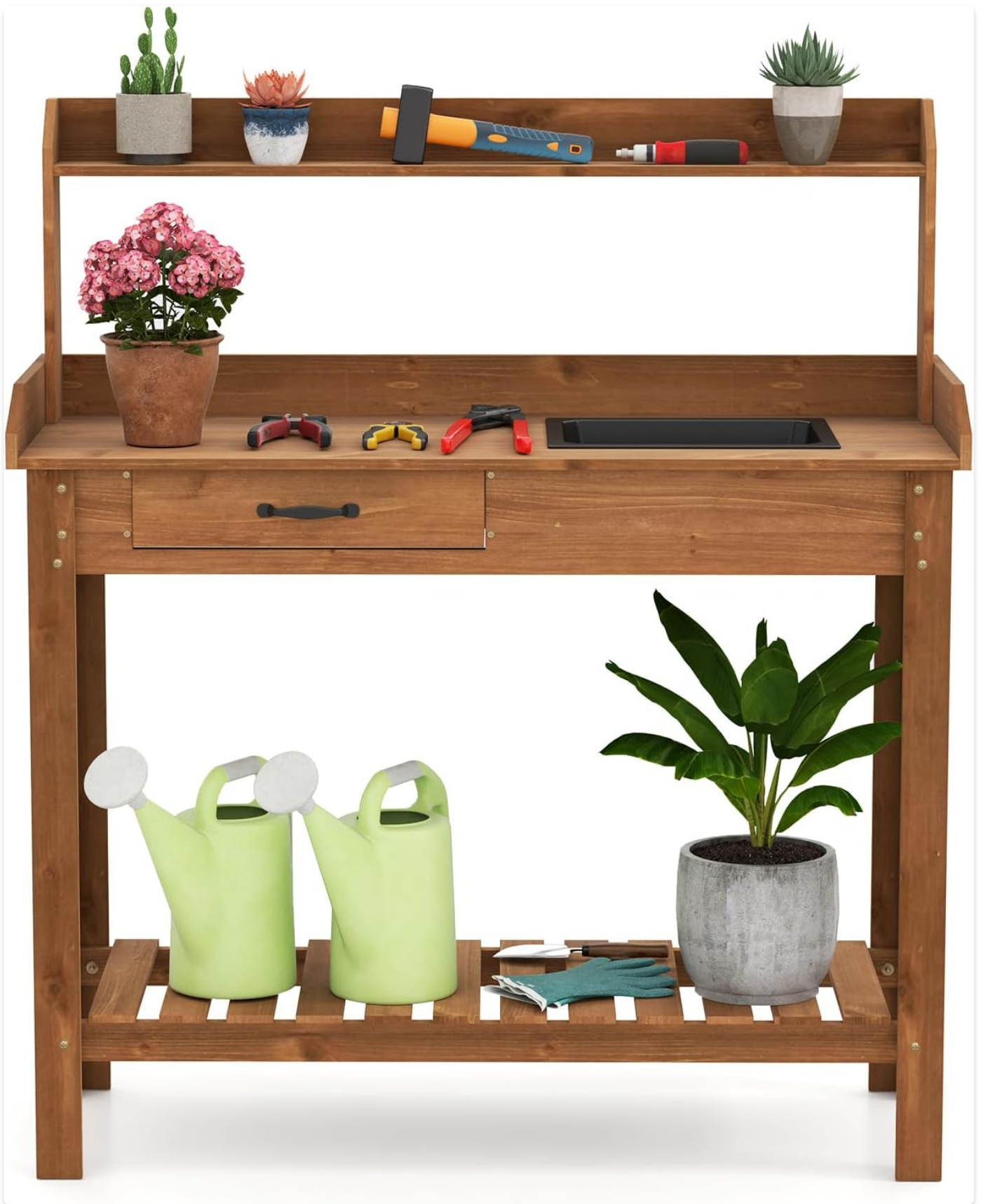
Figure 1: Overview of the HAPPYGRILL Wooden Potting Bench Table.