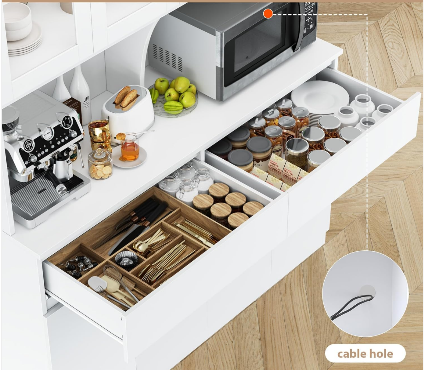
Image 5: Detailed view of the spacious drawers and integrated cable hole.