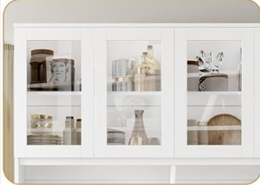
Tempered Glass Doors