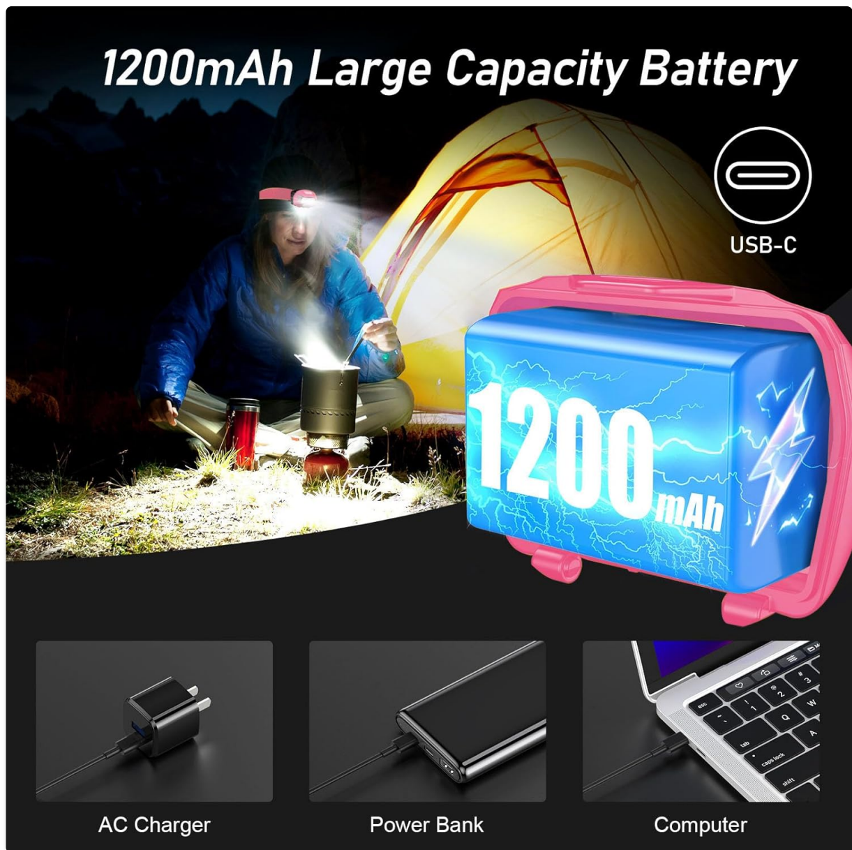
Image: Various usage scenarios for the Blukar LED headlamp, including outdoor recreation and practical tasks.