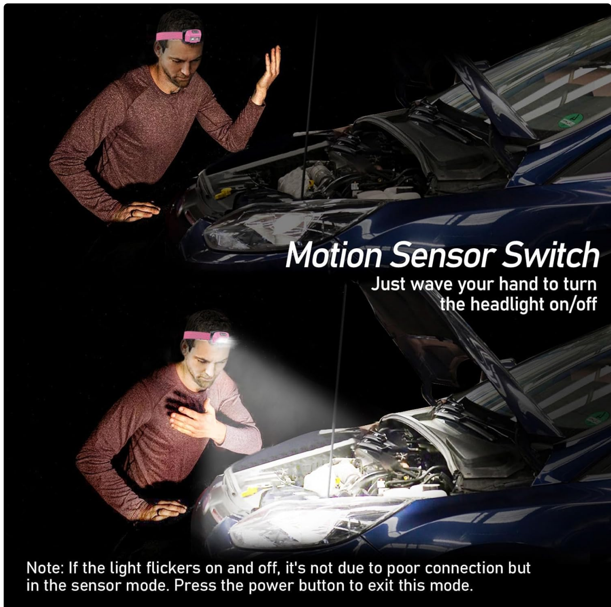
Image: Illustration of the motion sensor switch, allowing hands-free operation by waving a hand.

Press the motion sensor button to activate these modes. Once activated, you can wave your hand in front of the headlamp to turn the light on or off without pressing any buttons.