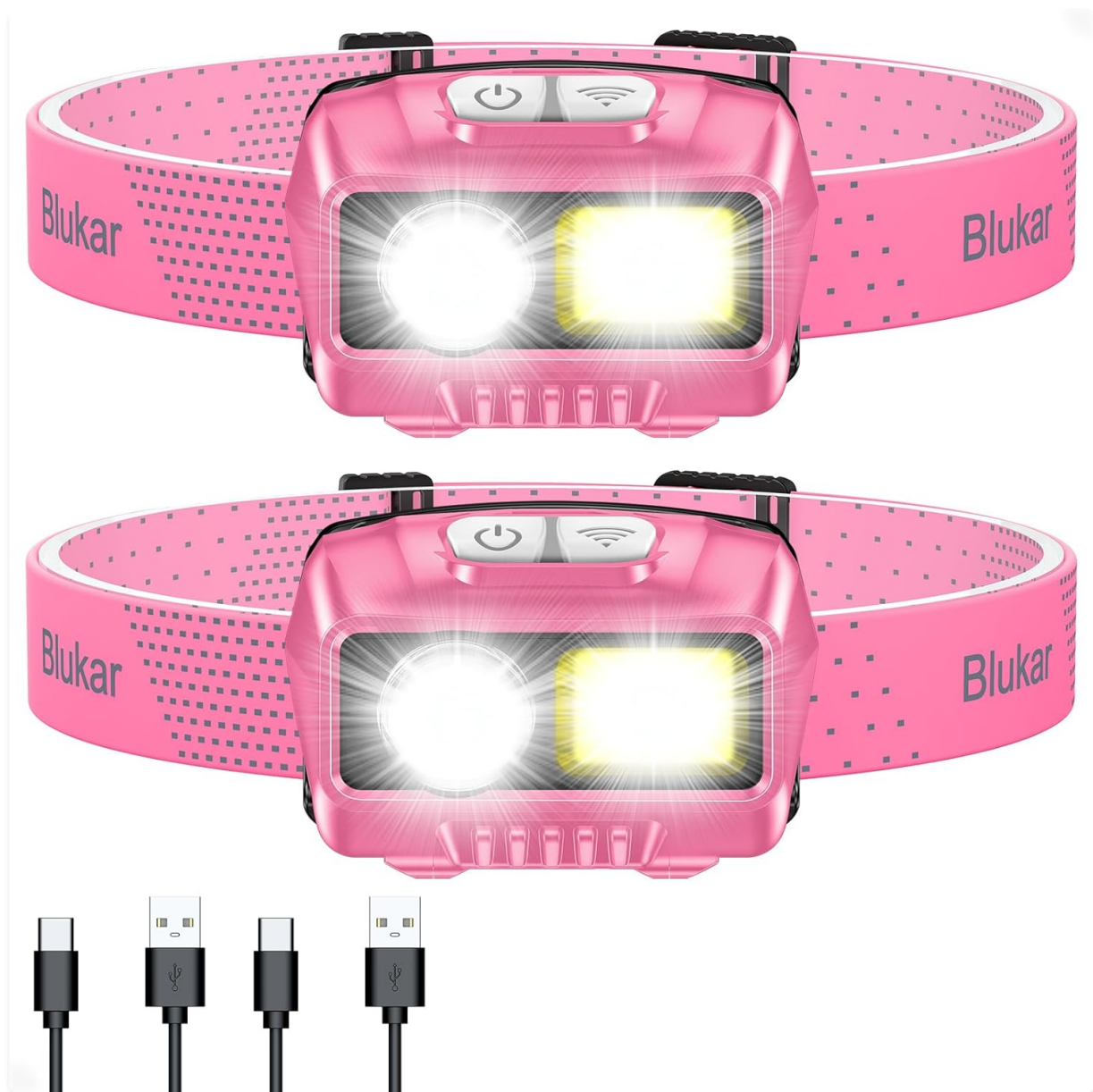
Image: Two Blukar LED Headlamps (Pink) with USB-C charging cables.