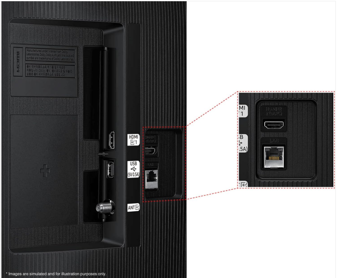
Figure 3: Close-up of the TV's rear ports, including HDMI, USB, and LAN connections.