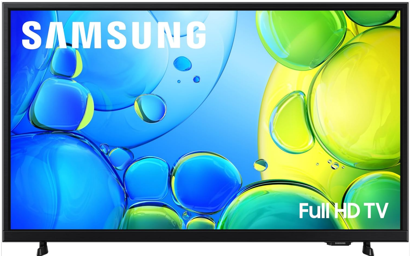
Figure 1: Front view of the Samsung 32-Inch Class Full HD F6000 Smart TV.