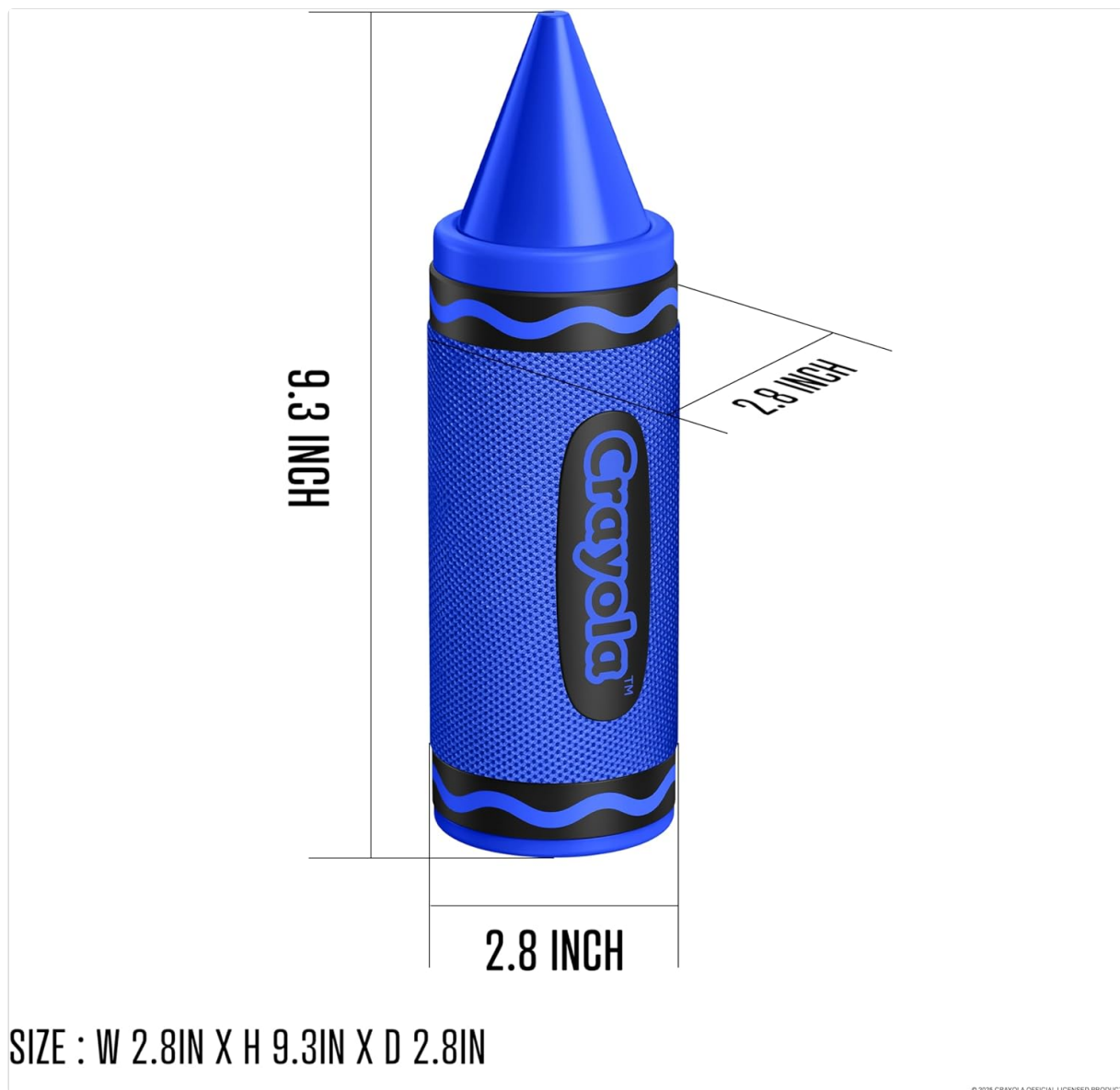
Image: A diagram illustrating the speaker's dimensions: 2.8 inches wide, 9.3 inches high, and 2.8 inches deep.