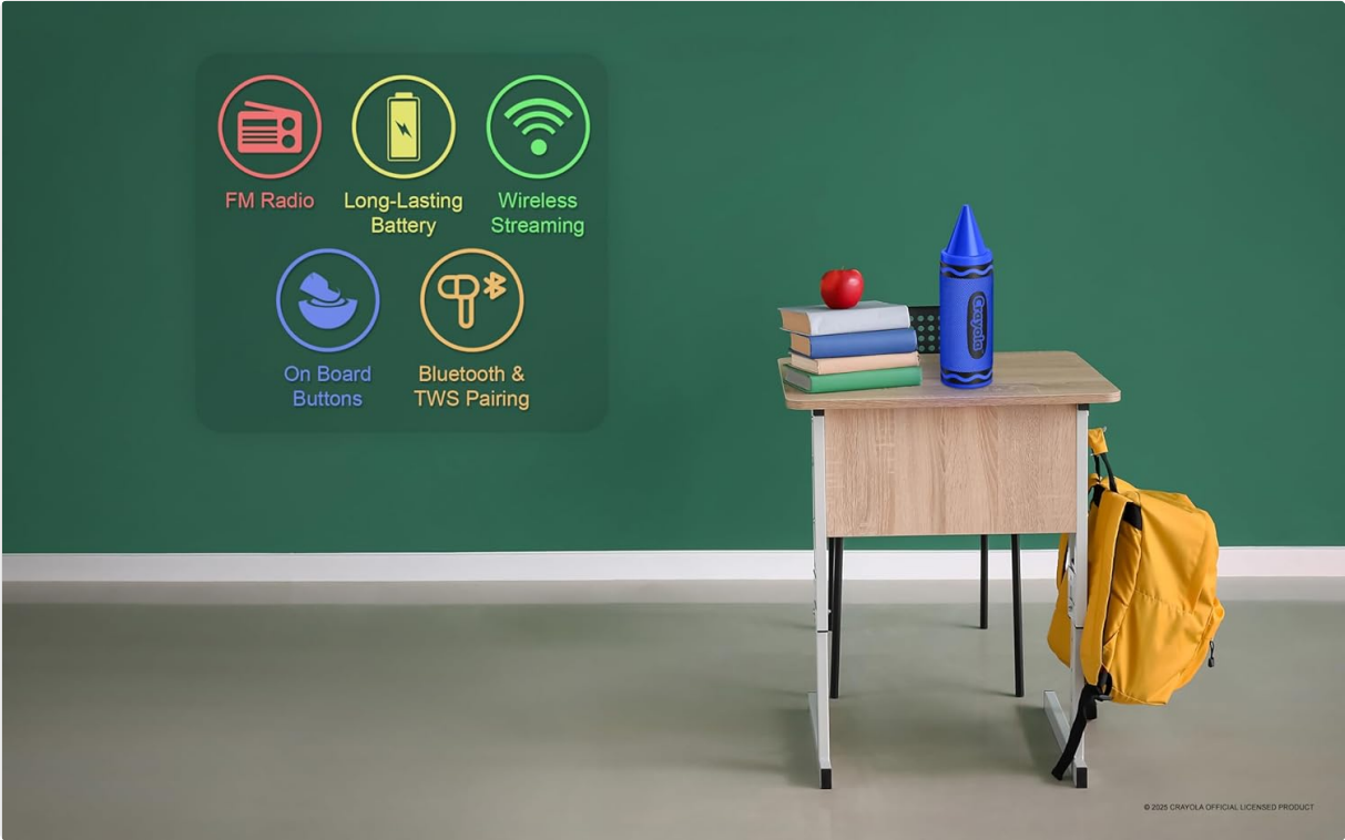
Image: Graphic illustrating the speaker's key features: FM Radio, Long-Lasting Battery, Wireless Streaming, On Board Buttons, and Bluetooth & TWS Pairing.