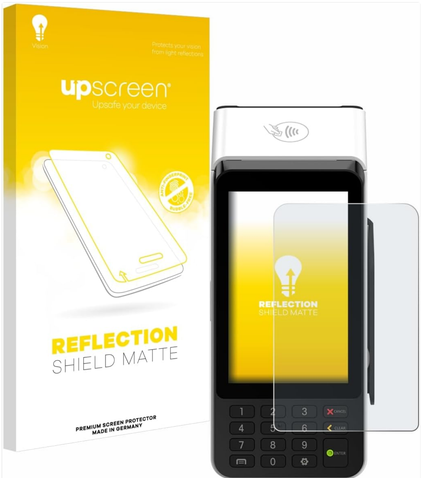
Image: The upscreens screen protector and its packaging alongside the compatible device.