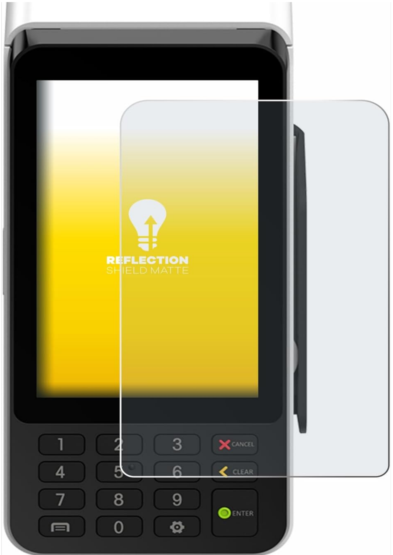
Image: The screen protector being aligned on the Pax A8900 K4 device.