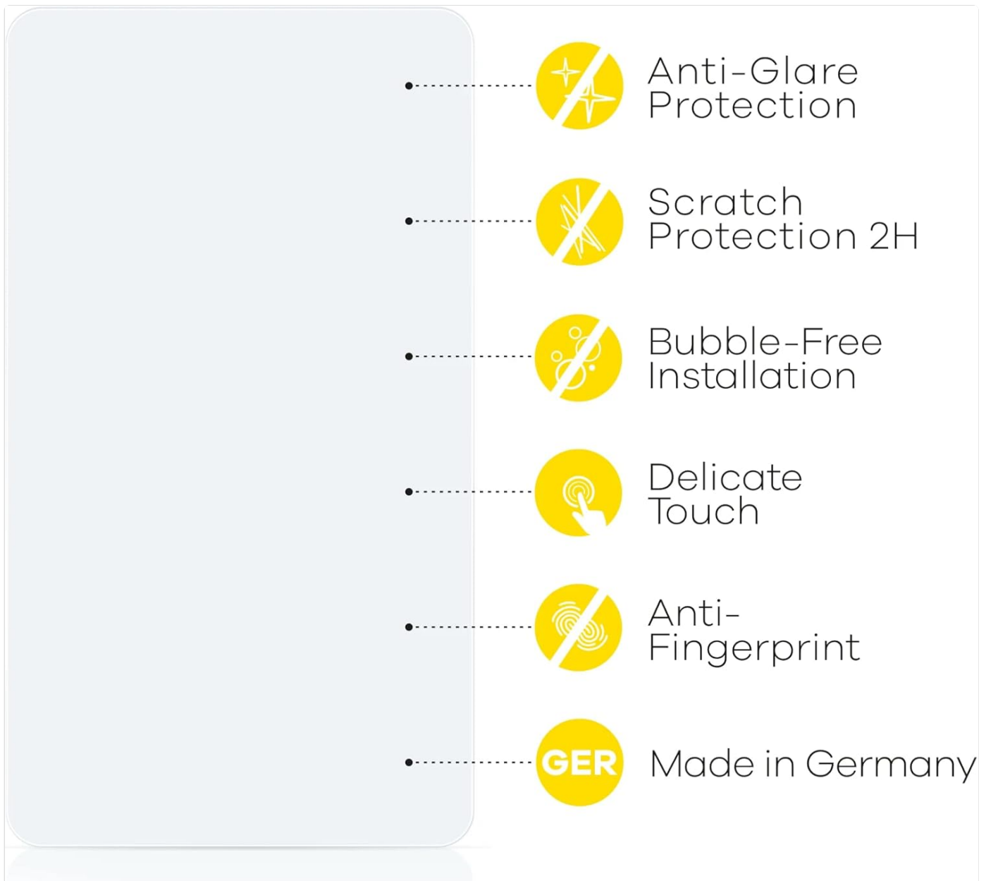
Image: Visual representation of the screen protector's key features.