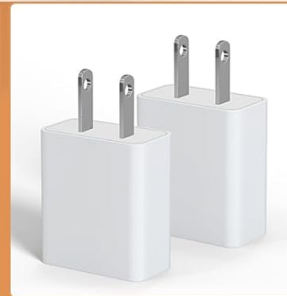
Power Adapter *2