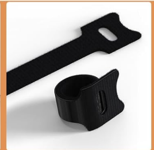
Velcro Strap *4. (Battery Not Included)

The OptiShield Pro Technology ensures even illumination without screen glare, reducing eye strain.