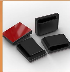
Cable Clip *8