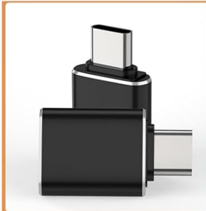
USB-A to USB-C Adapter *2