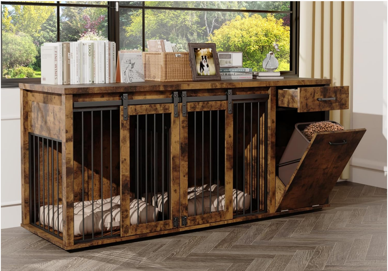
Image: The KIGOTY double dog crate in rustic brown, showing a dog resting inside one compartment. The tilt-out cabinet on the right is open, revealing an internal bin, suitable for pet waste or food storage.