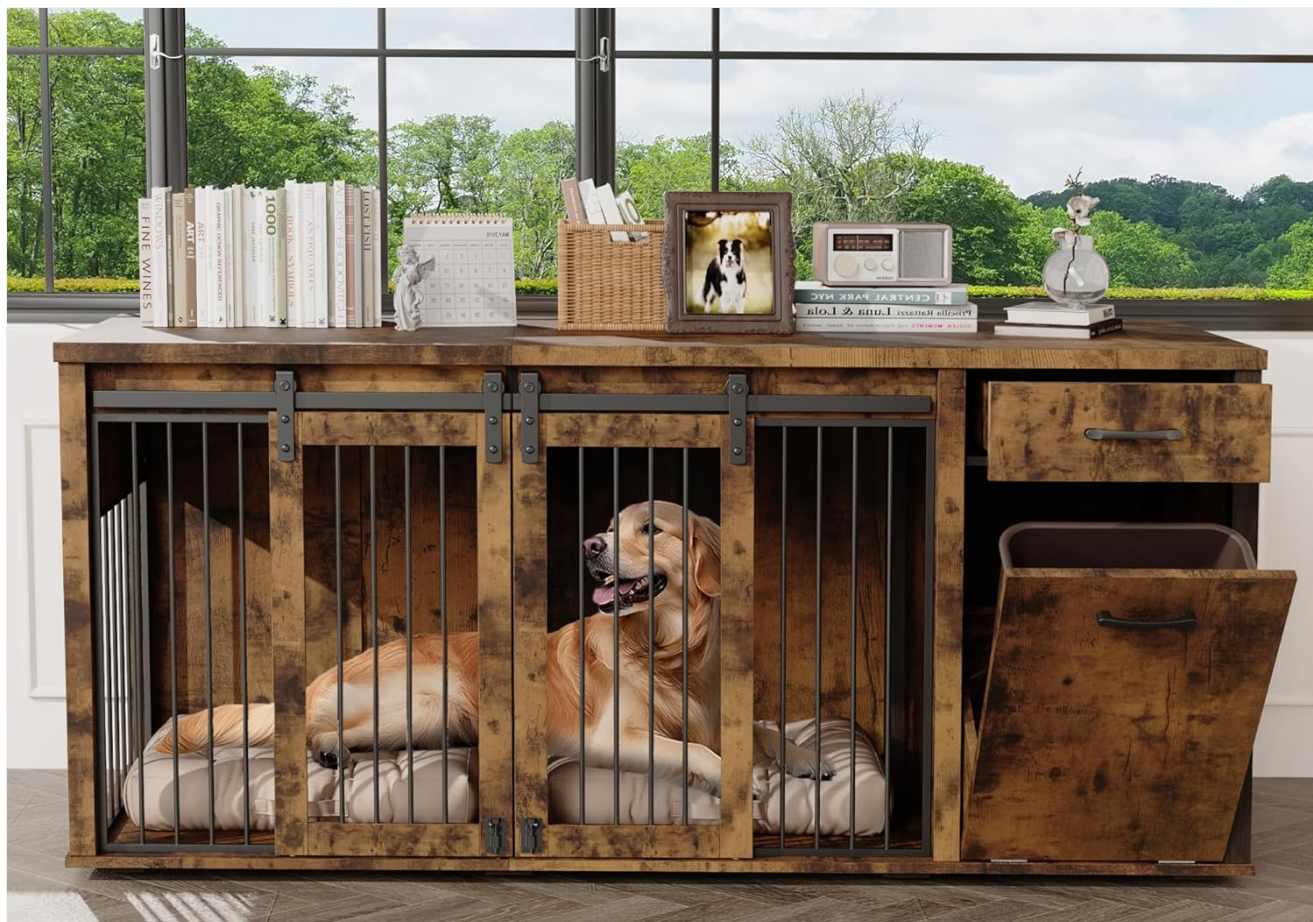
Image: The KIGOTY 71-inch furniture style double dog crate in rustic brown, shown with a golden retriever comfortably resting inside one of the compartments. The crate also features a drawer and a tilt-out cabinet on the right side, with decorative items on top.

Thank you for choosing the KIGOTY 71-Inch Furniture Style Double Dog Crate. This product is designed to provide a comfortable and secure space for your pets while also serving as a functional piece of furniture for your home. This manual provides detailed instructions for assembly, operation, maintenance, and troubleshooting to ensure safe and optimal use of your new dog crate.