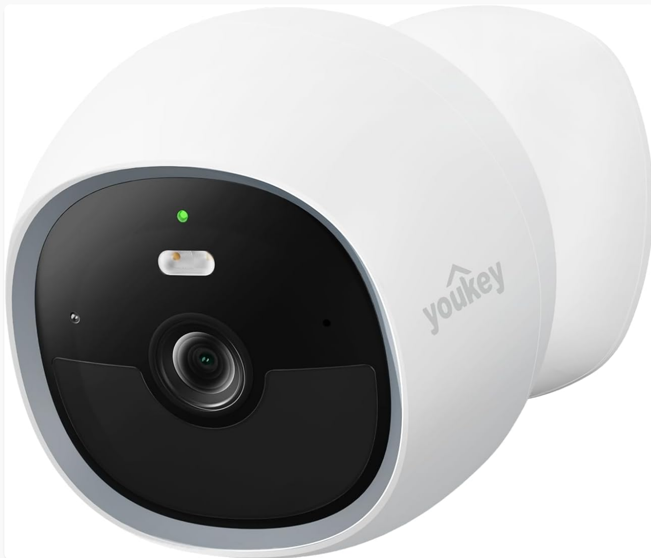
The youkey S320 camera and its magnetic base, ready for setup.

Ensure all listed package contents are present.