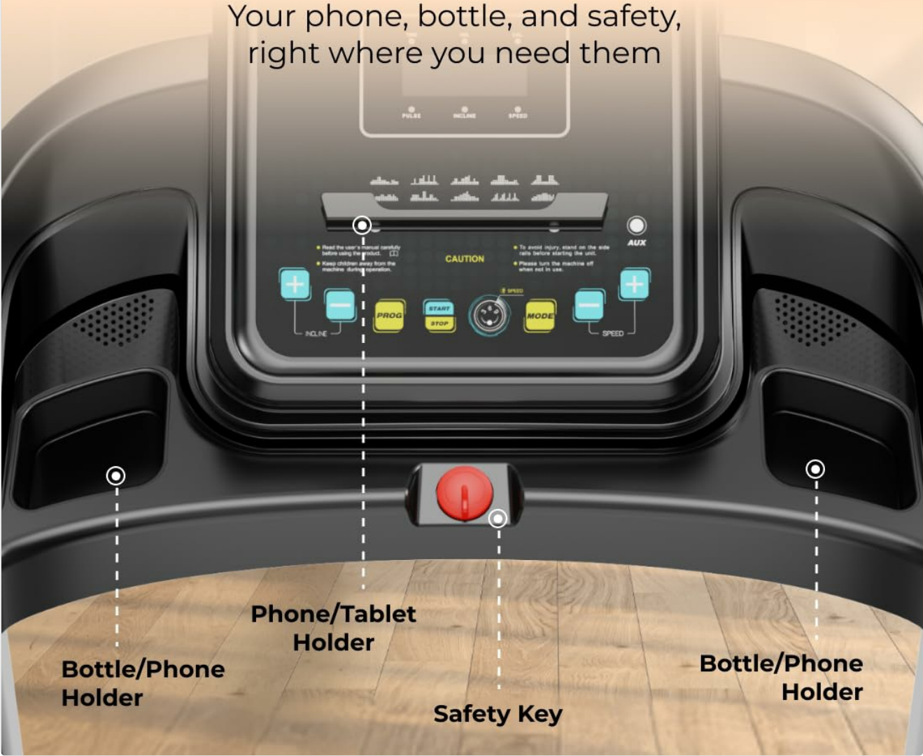
Figure 4.1: The LED display console showing metrics such as Time, Distance, Heart Rate, Calories, and Speed, along with indicators for 12 preset program modes.

Your phone, bottle, and safety, right where you need them