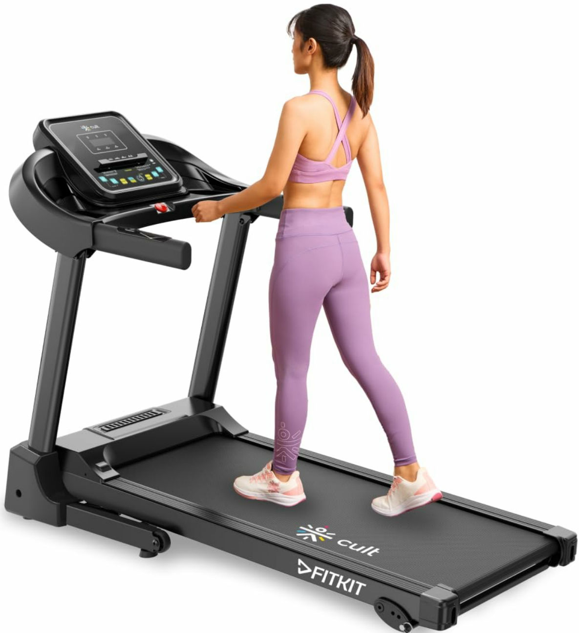
Figure 2.1: Fitkit TurboRun Treadmill in operation, showcasing its compact design and user interface.