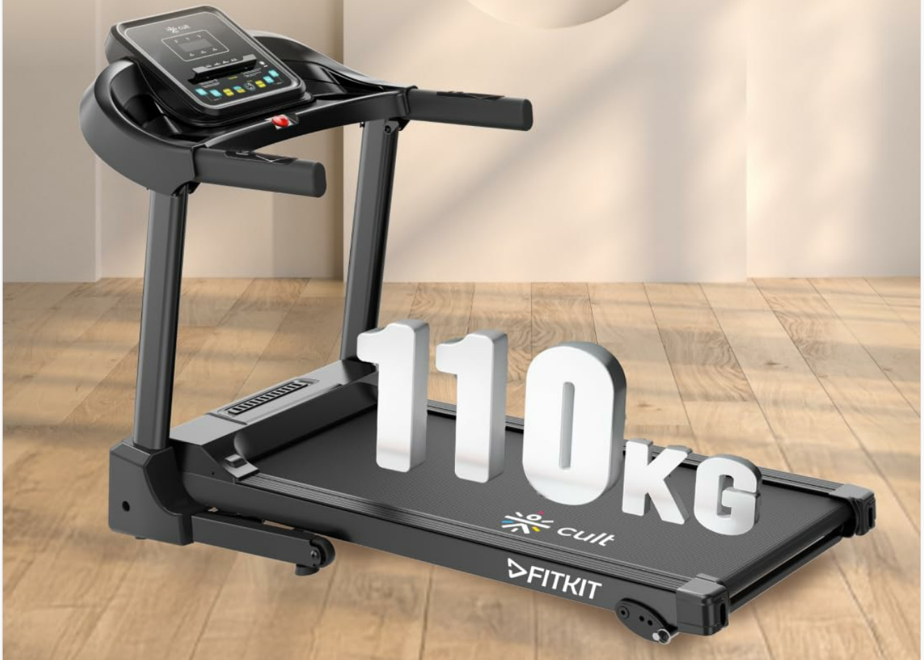
Figure 2.3: Advantages of Fitkit treadmills with BLDC motors, highlighting energy efficiency, lifespan, quiet operation, lower maintenance, and superior durability.

Designed to take on heavier loads with ease