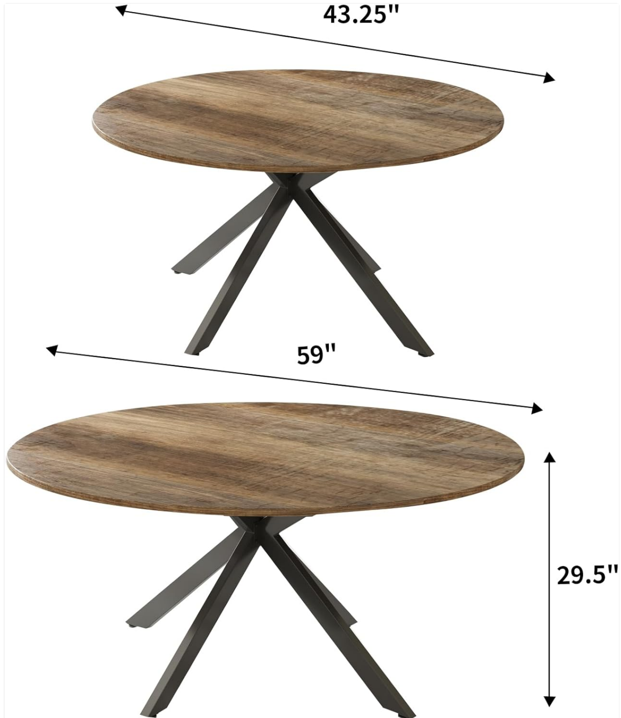
Figure 2.1: Table dimensions in both round and extended oval configurations.

The table measures approximately 43.25"D x 59"W x 29.5"H when fully extended. The unextended round diameter is 43.25 inches.