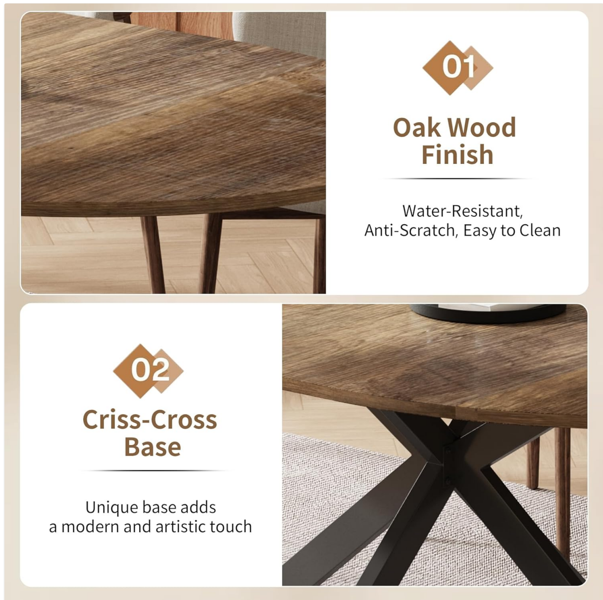
Figure 3.1: Detail of the table's oak wood finish and criss-cross base.