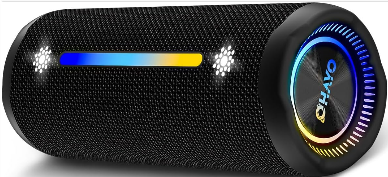
Image: The OHAYO X10 MAX Portable Bluetooth Speaker in glossy black, showcasing its cylindrical design and integrated LED