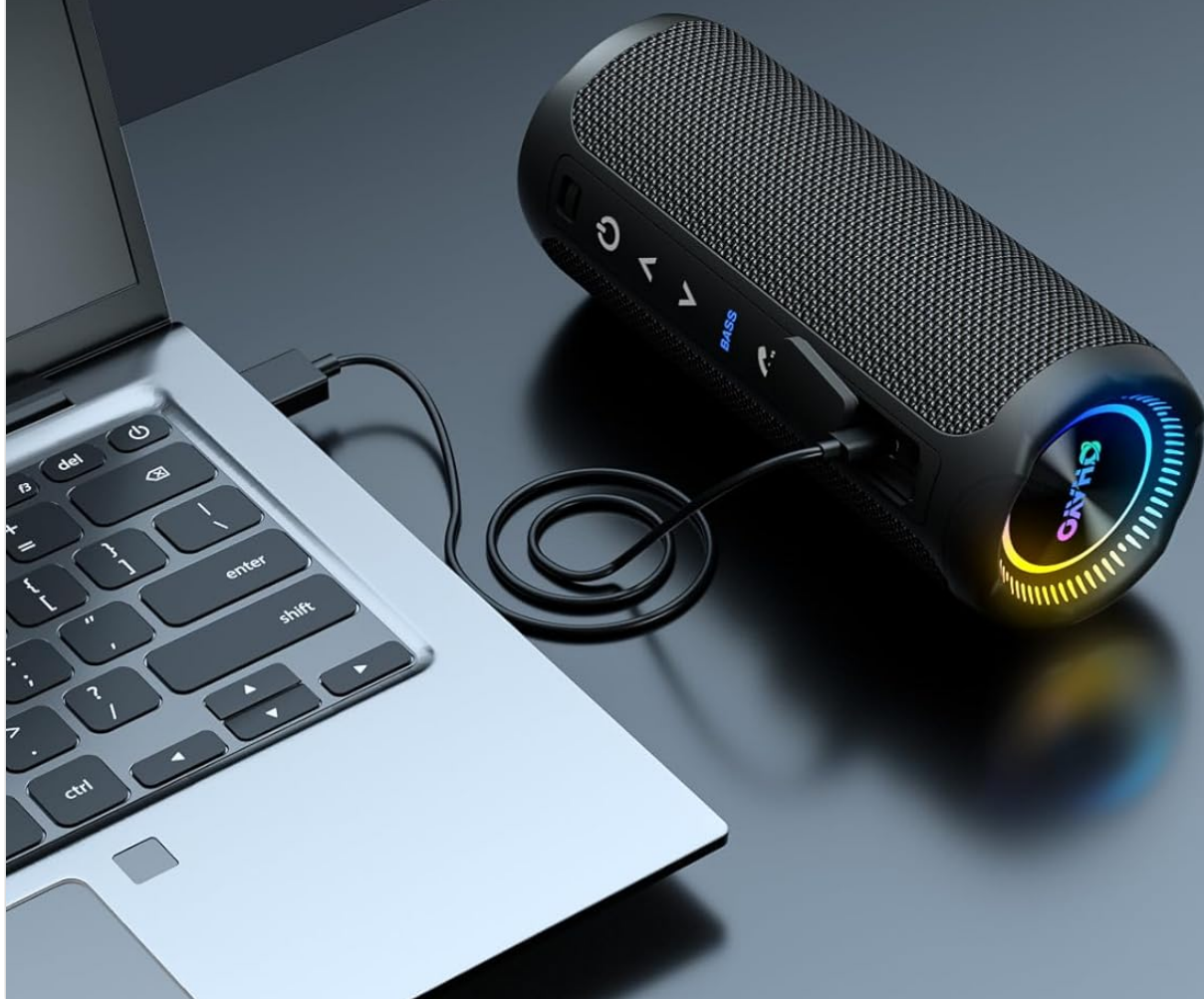
Image: The side of the OHAYO X10 MAX speaker showing the control buttons and the various input ports: Bluetooth, AUX, TF card, and USB-Audio.