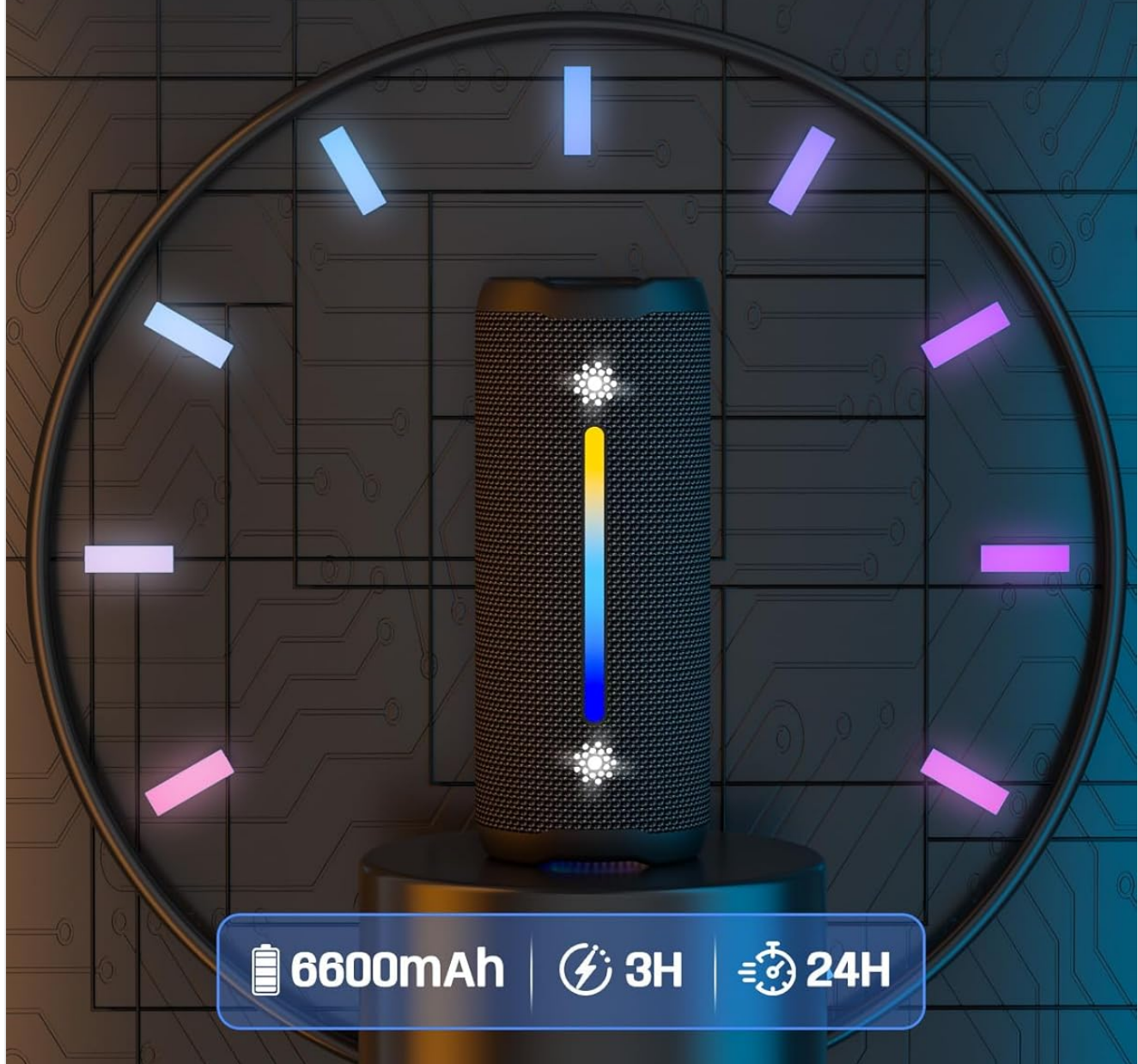
Image: The OHAYO X10 MAX speaker illustrating its 24-hour battery life and 6600mAh battery capacity, with a visual representation of charging and usage time.

Unleash the power of a 6600mAh battery with a handy indicator light - never worry about battery life again.