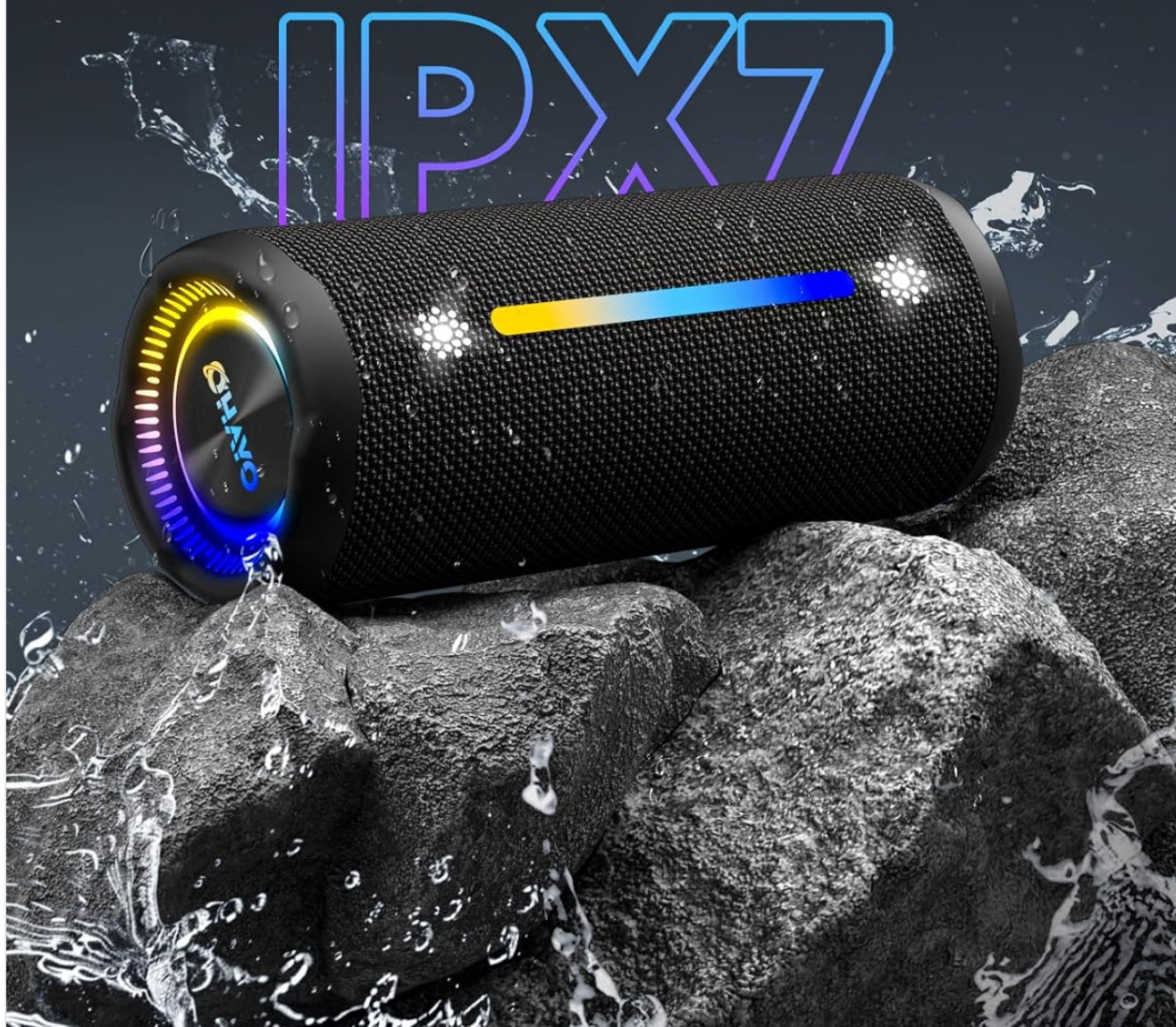
Image: The OHAYO X10 MAX speaker being splashed with water, demonstrating its IPX7 waterproof rating, making it suitable for use near water.

Highly sealed design, no fear of rain and flooding.