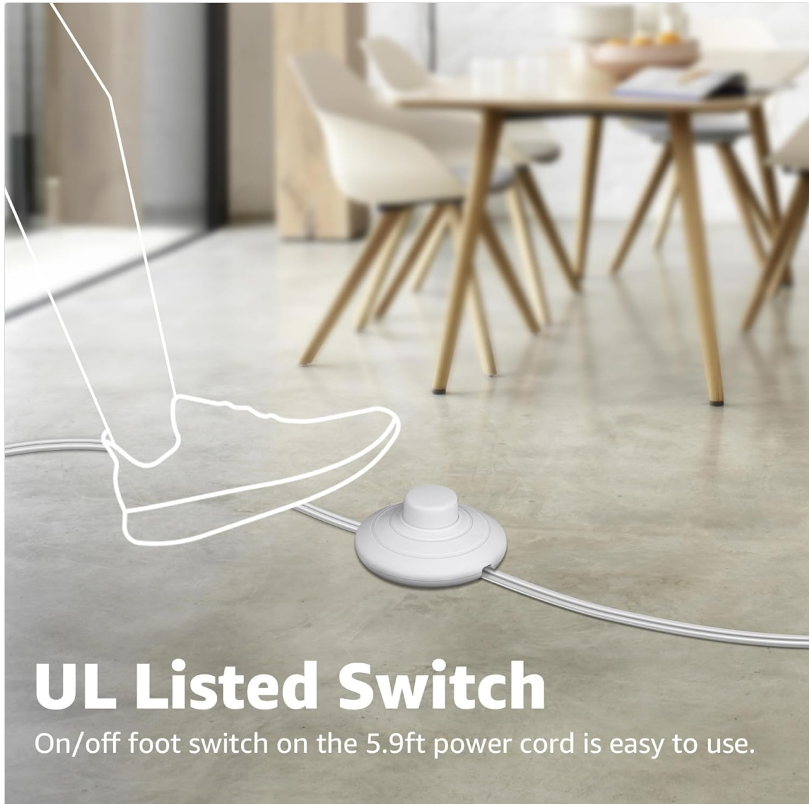
Image: The UL Listed foot switch on the power cord, designed for easy operation.