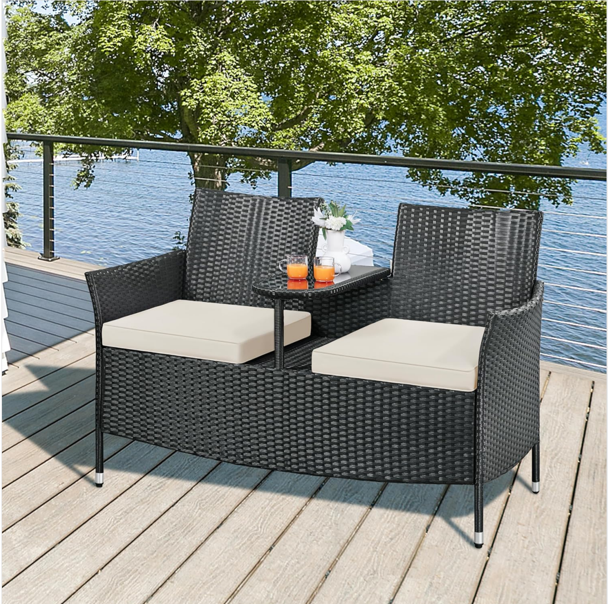
A Yaheetech 2-seater rattan garden bench with an integrated side table, positioned on a wooden deck overlooking a body of water, with trees in the background.