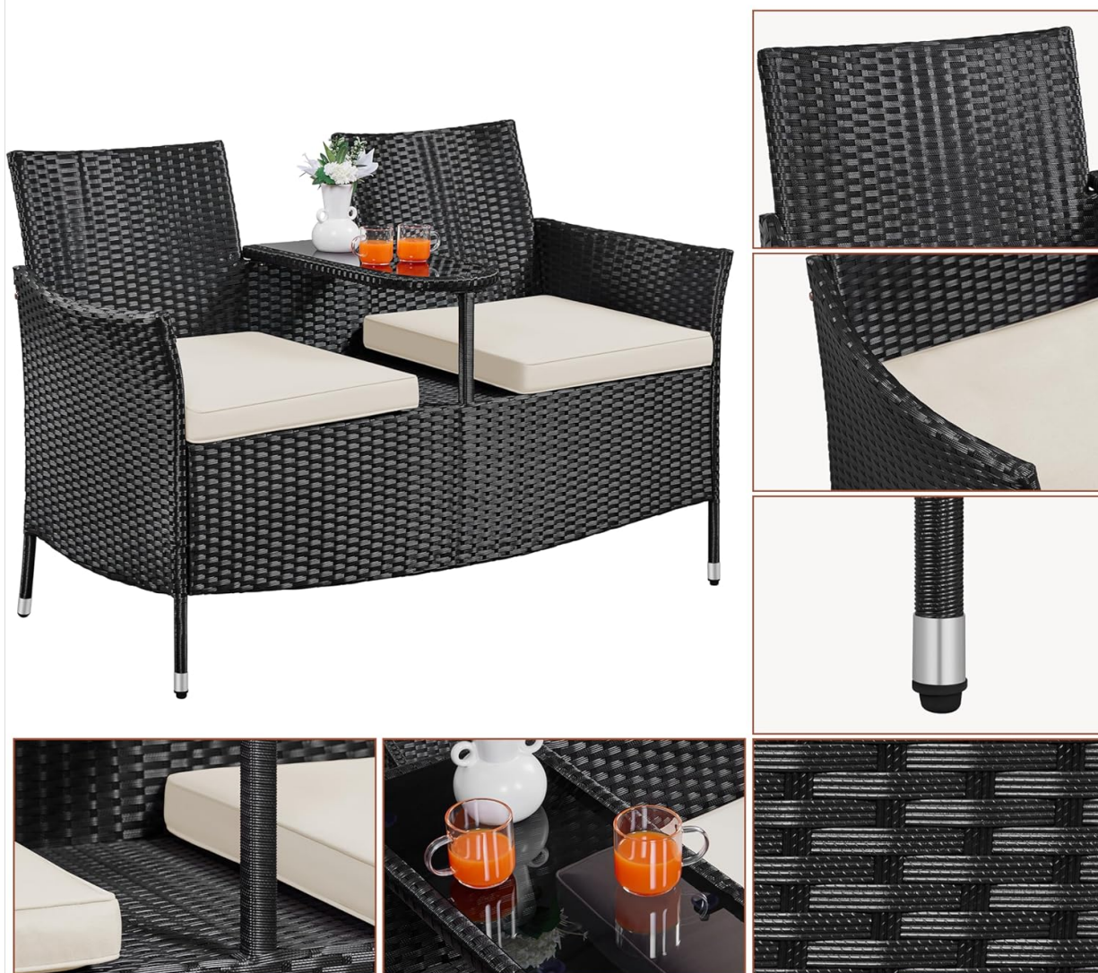
Close-up views of the Yaheetech 2-seater rattan garden bench, highlighting the woven rattan texture, the integrated side table, and the design of the legs.