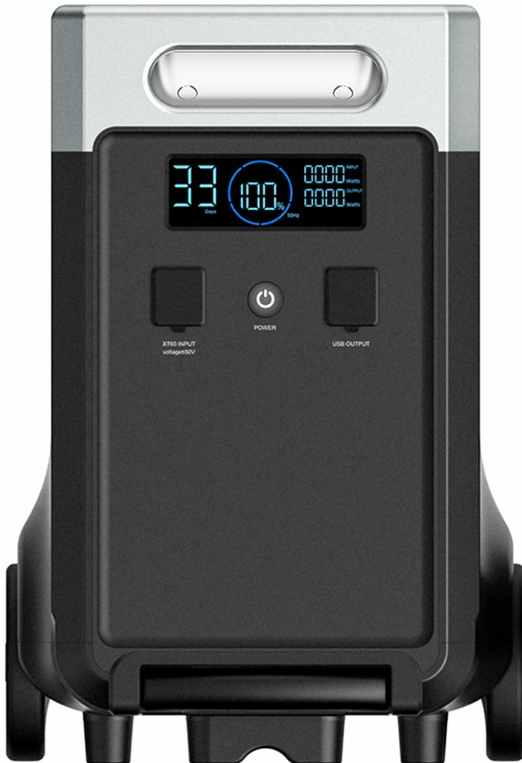
Figure 1: AFERIY P310 Expansion Battery Pack with integrated wheels and handles for portability.