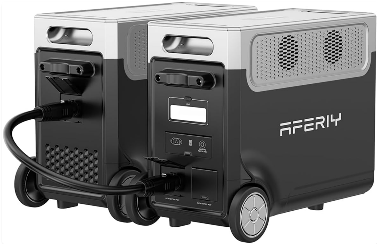
Figure 2: Two AFERIY P310 units connected via the dedicated connecting cable, demonstrating the expandable capacity setup.