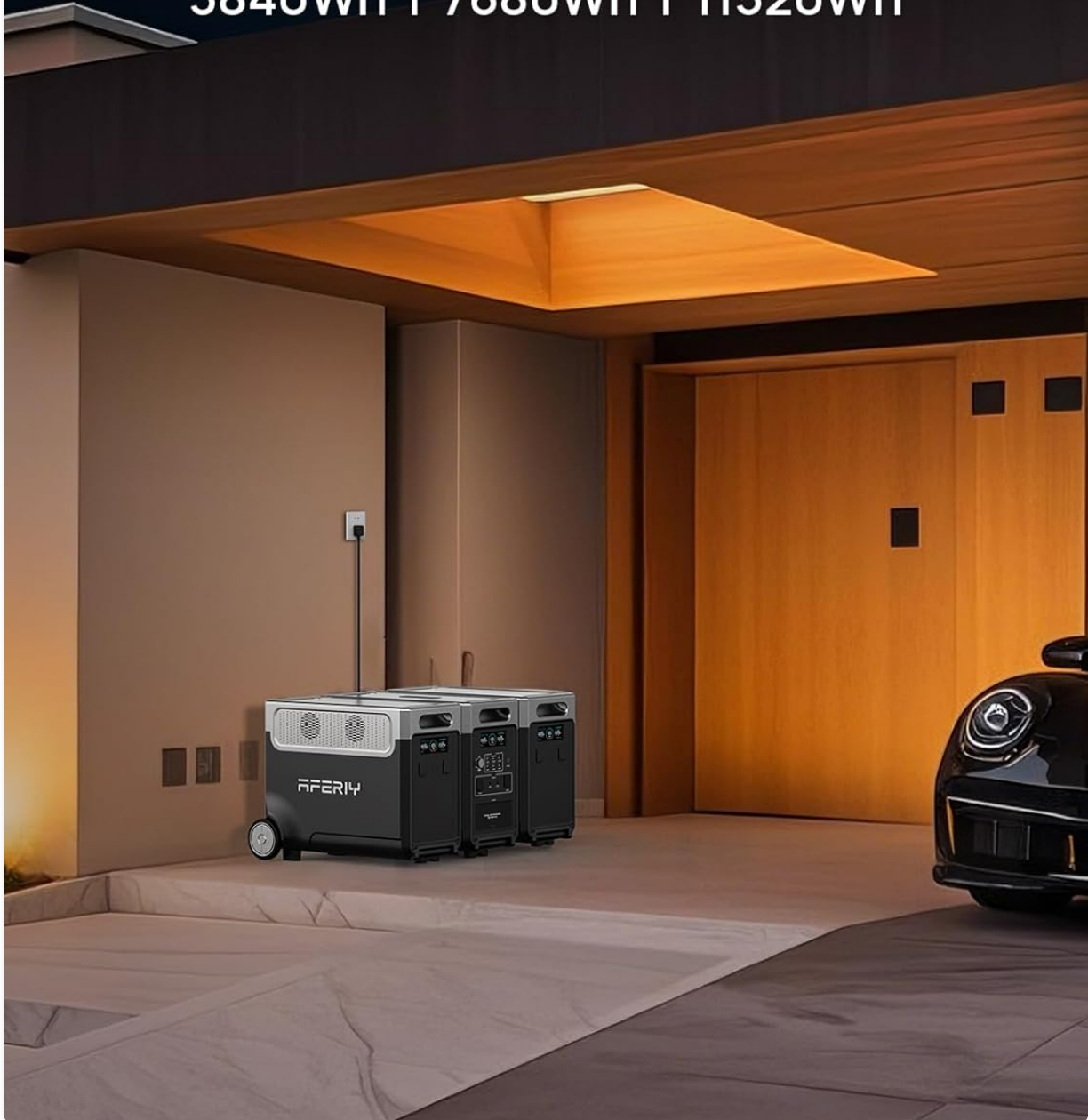
Figure 4: The AFERIY P310 system demonstrating its expandable capacity, allowing for increased power storage with additional battery packs.