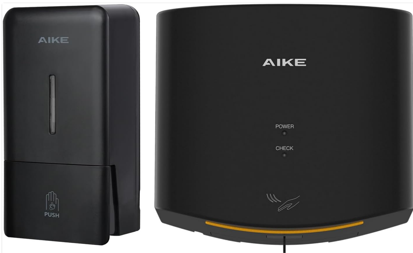
Image: The AIKE Commercial Foam Soap Dispenser (left) and the AIKE Air Wiper Compact Wall Mount Hand Dryer (right), both in black, presented as a bundle.