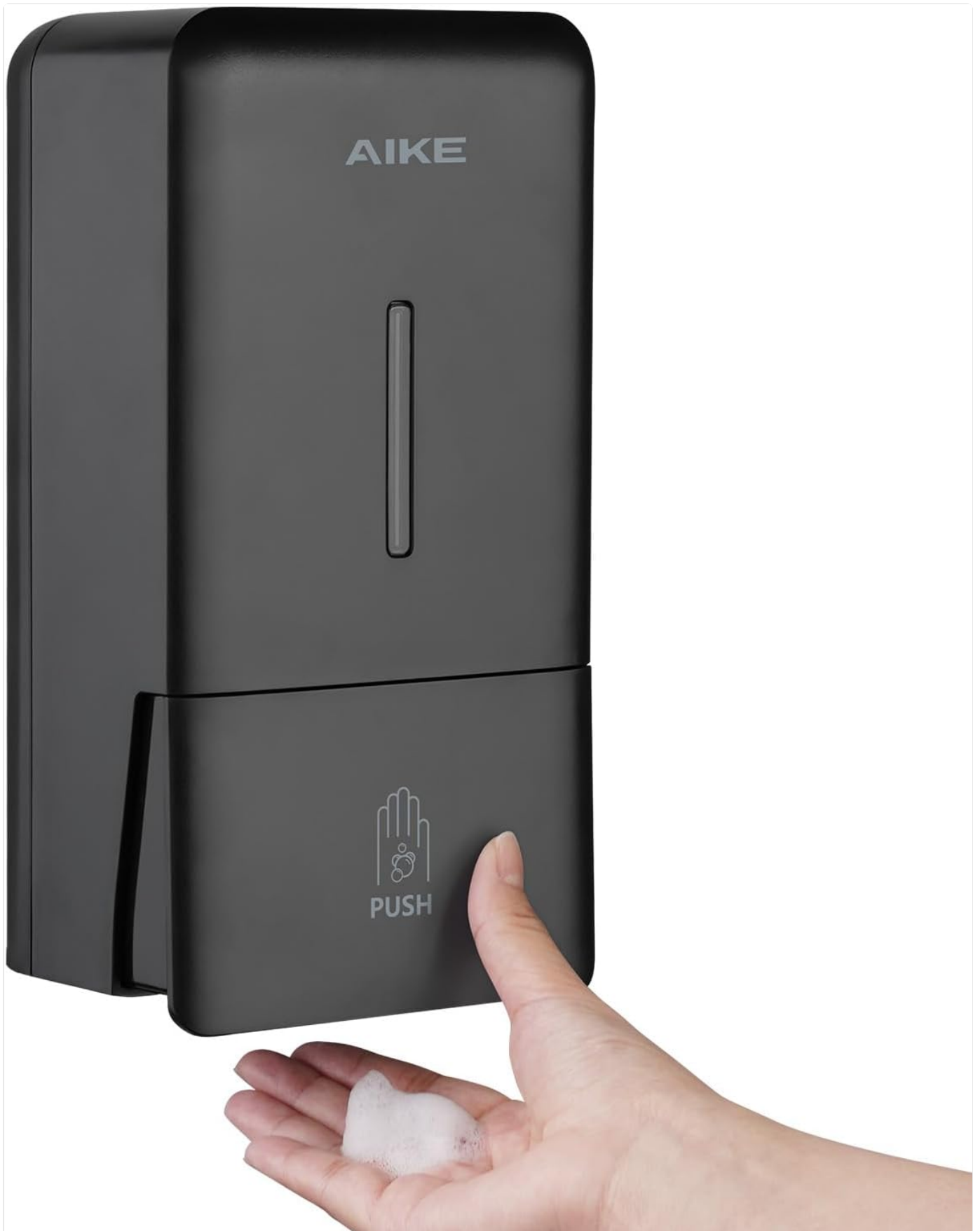
Image: A hand pressing the large push button on the AIKE Manual Foam Soap Dispenser, with foam being dispensed into the hand.