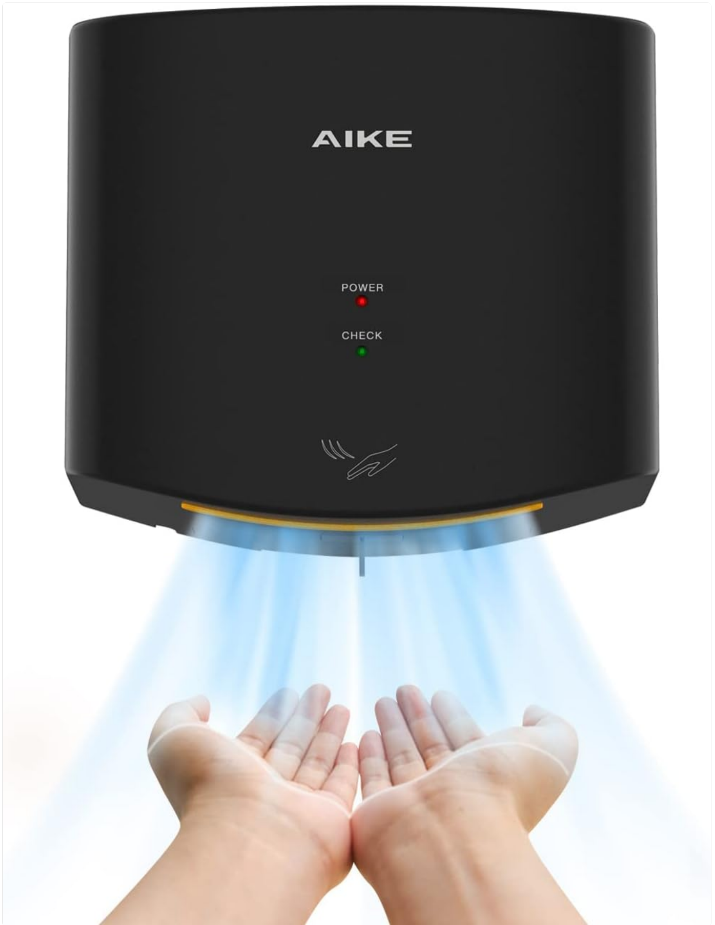
Image: The AIKE Hand Dryer in operation, with blue air streams drying hands placed beneath it. The "POWER" and "CHECK" indicator lights are visible.