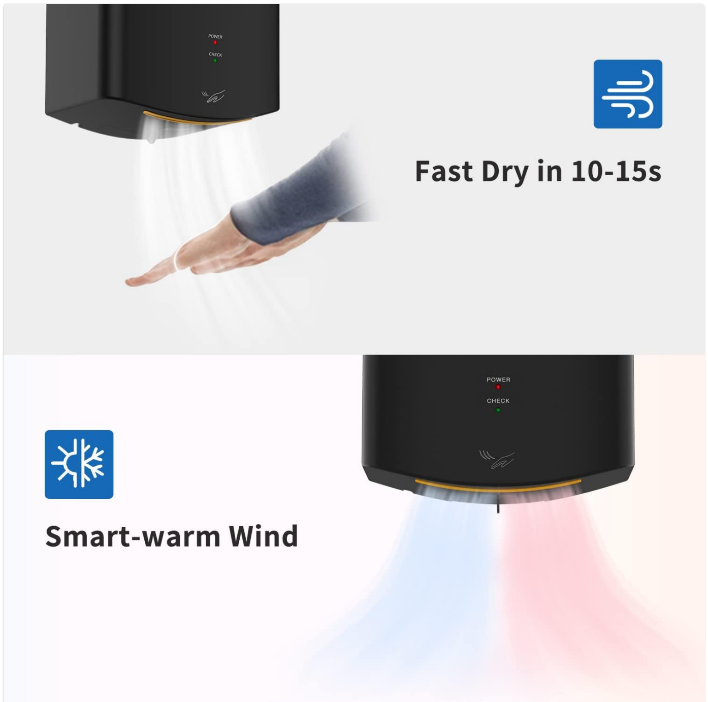
Image: A graphic illustrating the "Fast Dry in 10-15s" capability with a hand under the dryer, and "Smart-warm Wind" with red and blue air streams indicating temperature control.