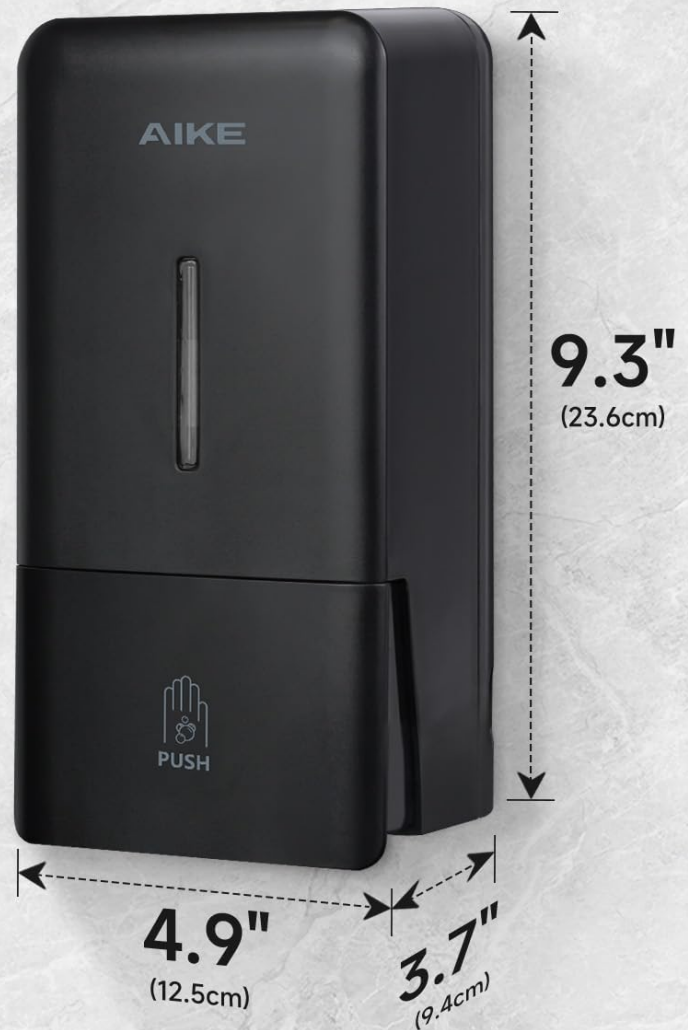
Image: A collage showing detailed features of the AIKE Manual Foam Soap Dispenser, including its durable ABS plastic, key locking system, and large push button for perfect pour.