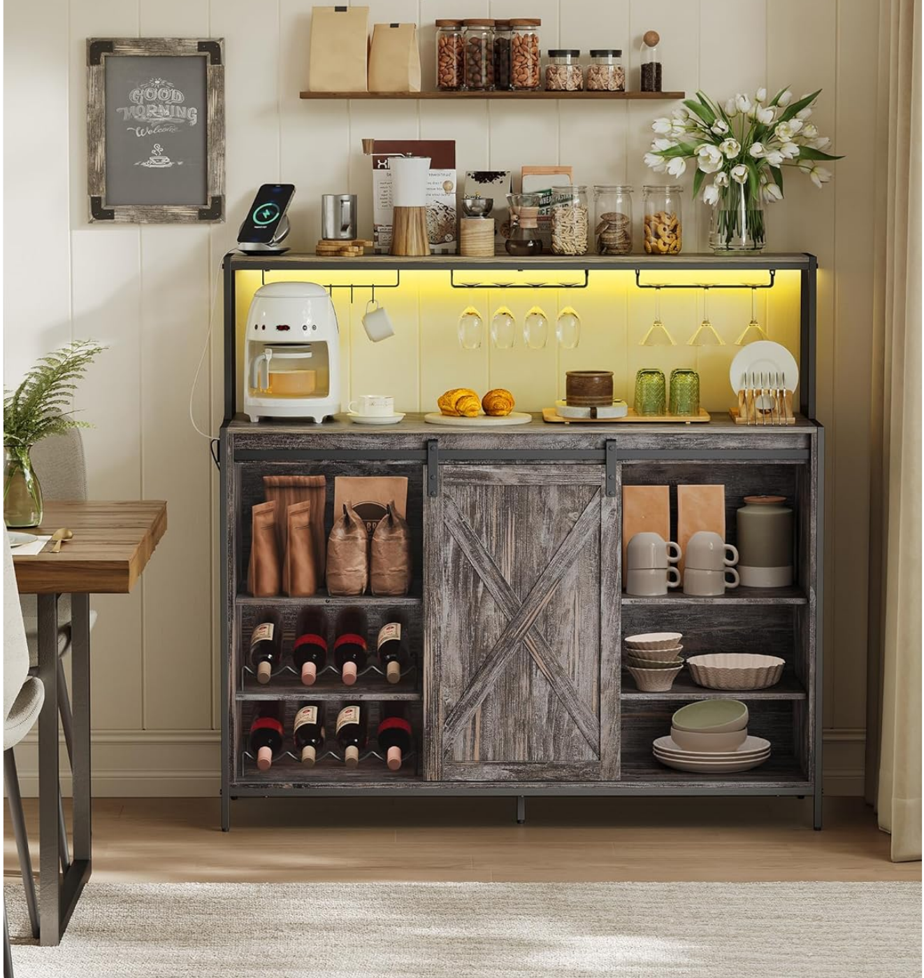
Image Description: The cabinet configured as a coffee station, with a coffee maker and various coffee accessories. The flexible bottle holders are shown, emphasizing that they can be attached or removed to suit user preferences for storage.

Attach them or not to suit your preferences