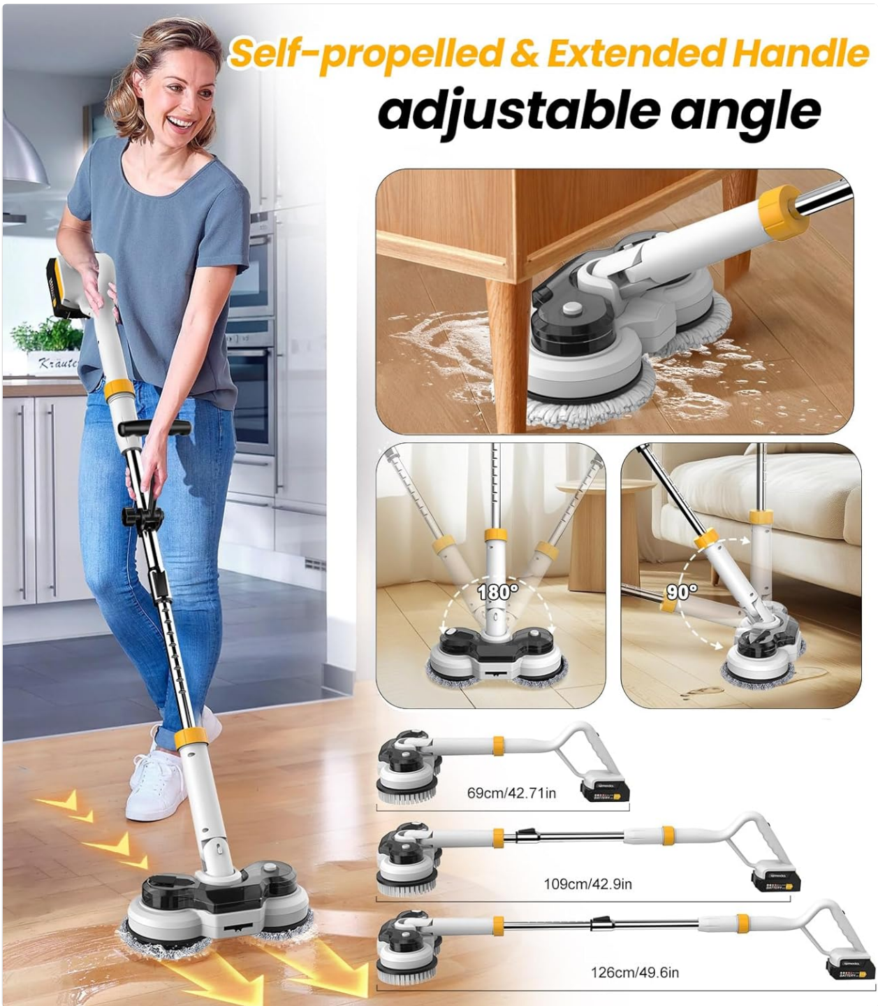
Figure 5.2: Demonstrates the self-propelled nature and adjustable handle, allowing the mop head to reach various angles (90° and 180°) for comprehensive cleaning.

Video 5.1: An official qimedo video demonstrating the features and operation of the Battery Electric Mop M1, including its powerful cleaning action.