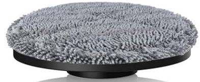
6 Inch Ultra Large Hair Mop Pad