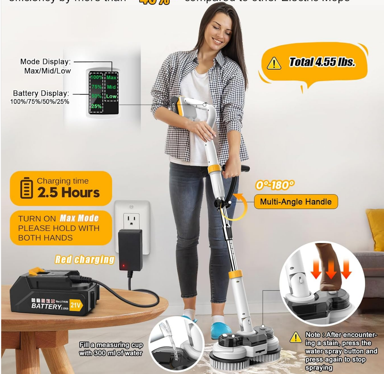
Figure 5.1: The smart display showing battery percentage and power modes (Max/Mid/Low). The image also illustrates the charging process and the multi-angle handle adjustment.

Effortless Handle and foot-pressing 300ml water tank increase cleaning efficiency by more than "40%" compared to other Electric Mops