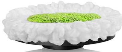
6 Inch Ultra Large Mop Pad