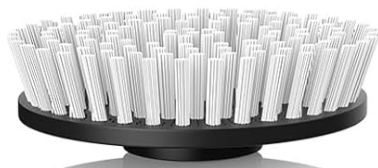
6.5 Inch Ultra Large Brush head

Buying the unrivaled innovation power mop means you have a scrubber and mop that can be used in a variety of situations.