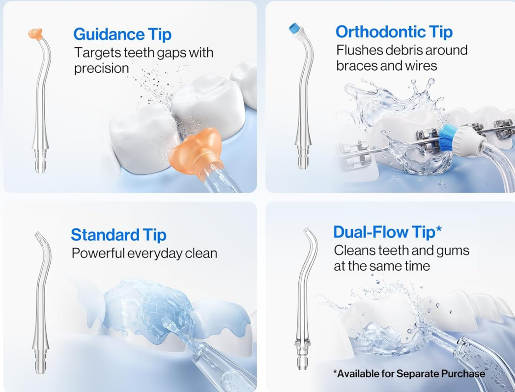
Image: A visual guide to the different nozzles available for the usmile C10, including the Guidance Tip, Orthodontic Tip, and Standard Tip, each designed for specific oral care needs.