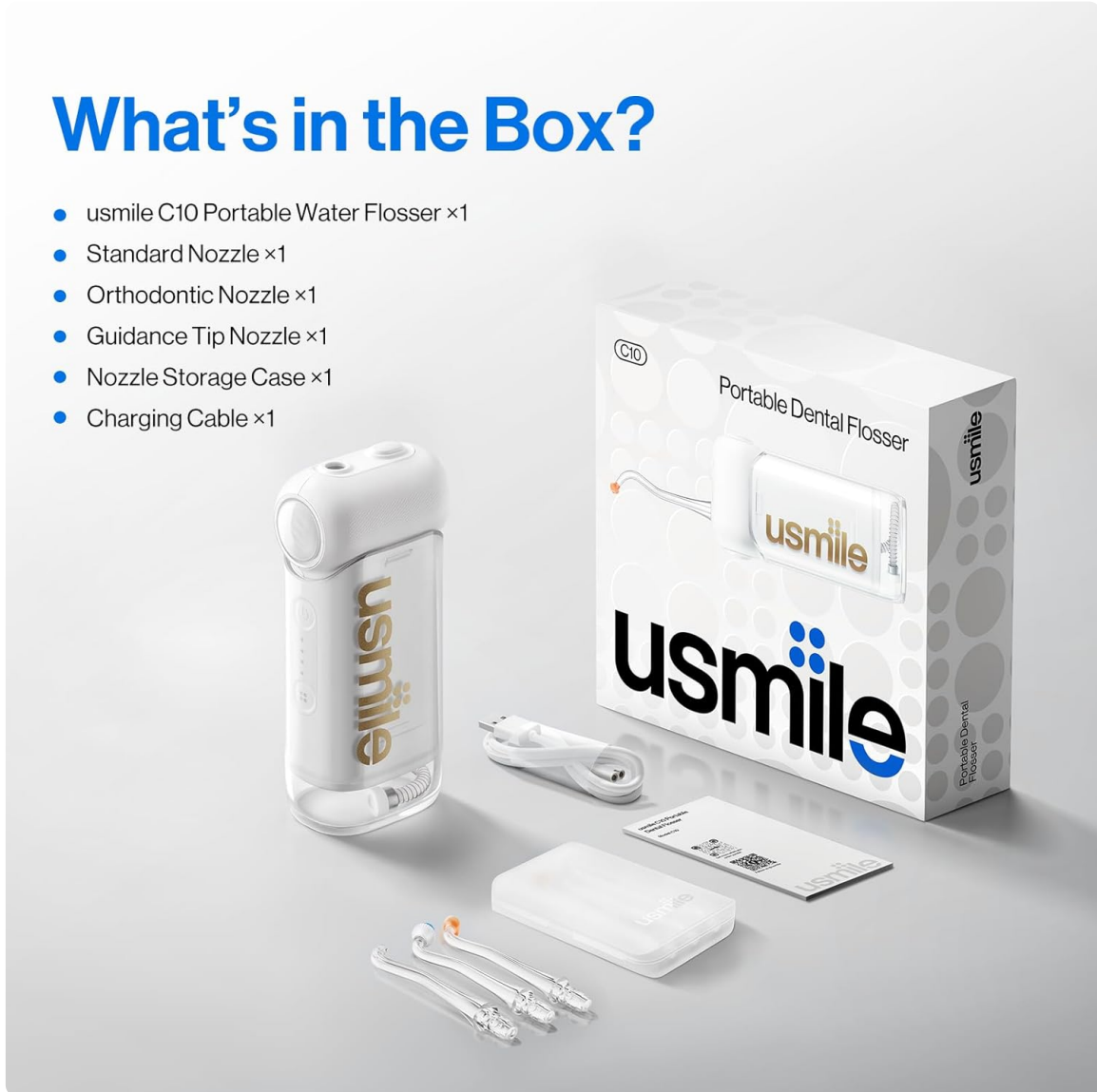
Image: The usmile C10 Portable Water Flosser, along with its standard, orthodontic, and guidance tip nozzles, a nozzle storage case, and a charging cable, neatly arranged in its packaging.