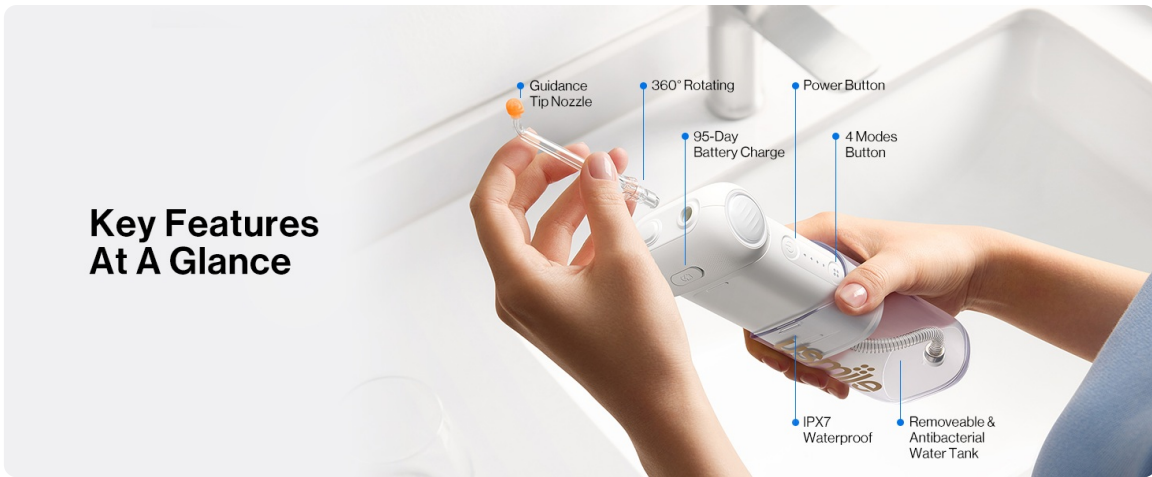
Image: An illustration highlighting the key features of the usmile C10, including the guidance tip nozzle, 360° rotating head, power button, 95-day battery charge, 4 modes button, IPX7 waterproof rating, and removable & antibacterial water tank.