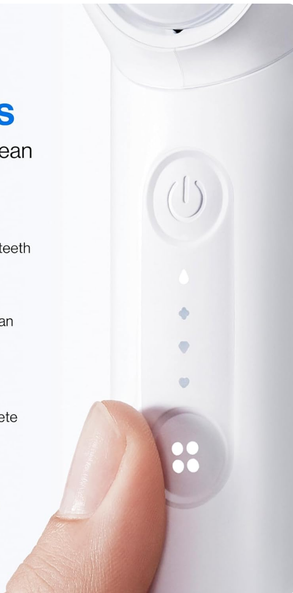
Image: A close-up of the usmile C10 device illustrating the four personalized cleaning modes: Massage, Soft, Standard, and Intense, with their respective PSI levels.

High-pressure flush for deep plaque removal