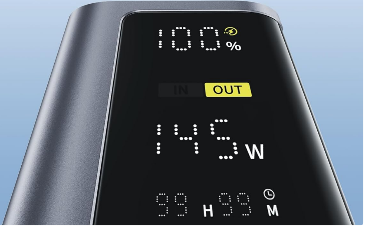
Image: A detailed view of the smart digital display, showing battery status, current wattage, and estimated time.