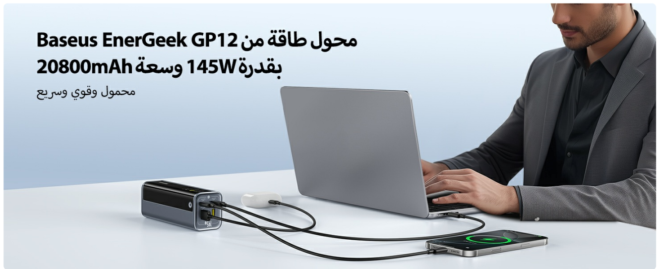
Image: The power bank simultaneously charging a laptop via a 100W USB-C port and a smartphone via a 45W USB-C port.