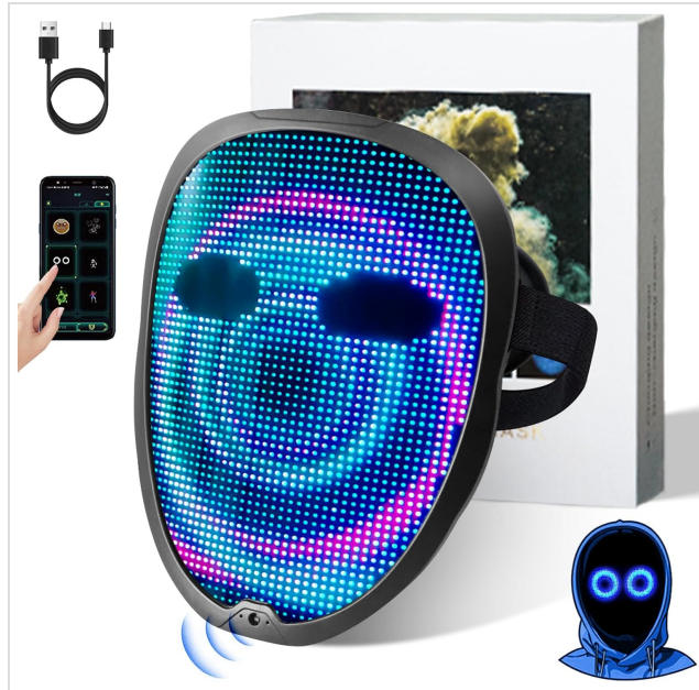
Image: The Ompusos LED Mask, a USB-C charging cable, and a smartphone displaying the mask's control app.