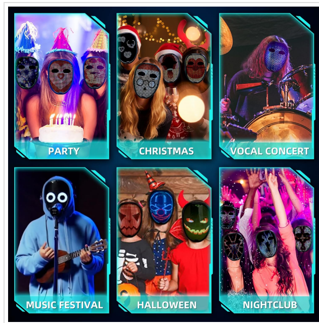
Image: A group of individuals wearing Ompusos LED masks, showcasing the vibrant and dynamic display patterns in a social setting.

This manual provides comprehensive instructions for the safe and effective use of your Ompusos LED Mask with Gesture Sensing. Please read this manual thoroughly before operating the device and retain it for future reference.