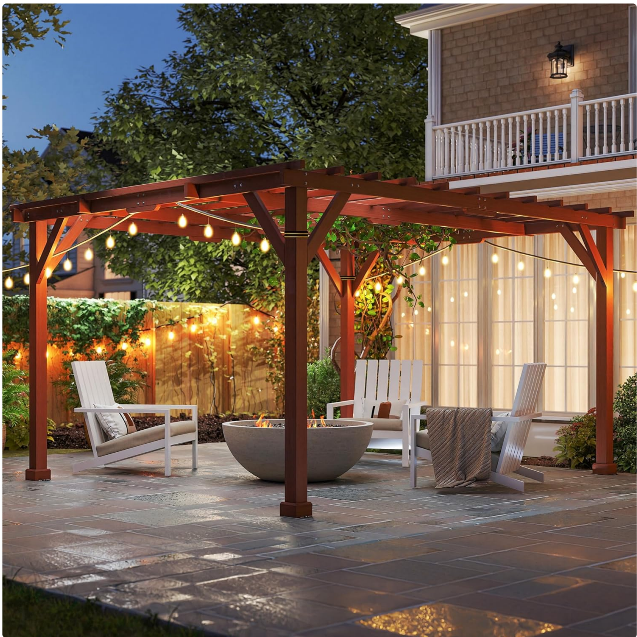
Figure 1: Outsunny Wood Pergola providing a shaded outdoor space.