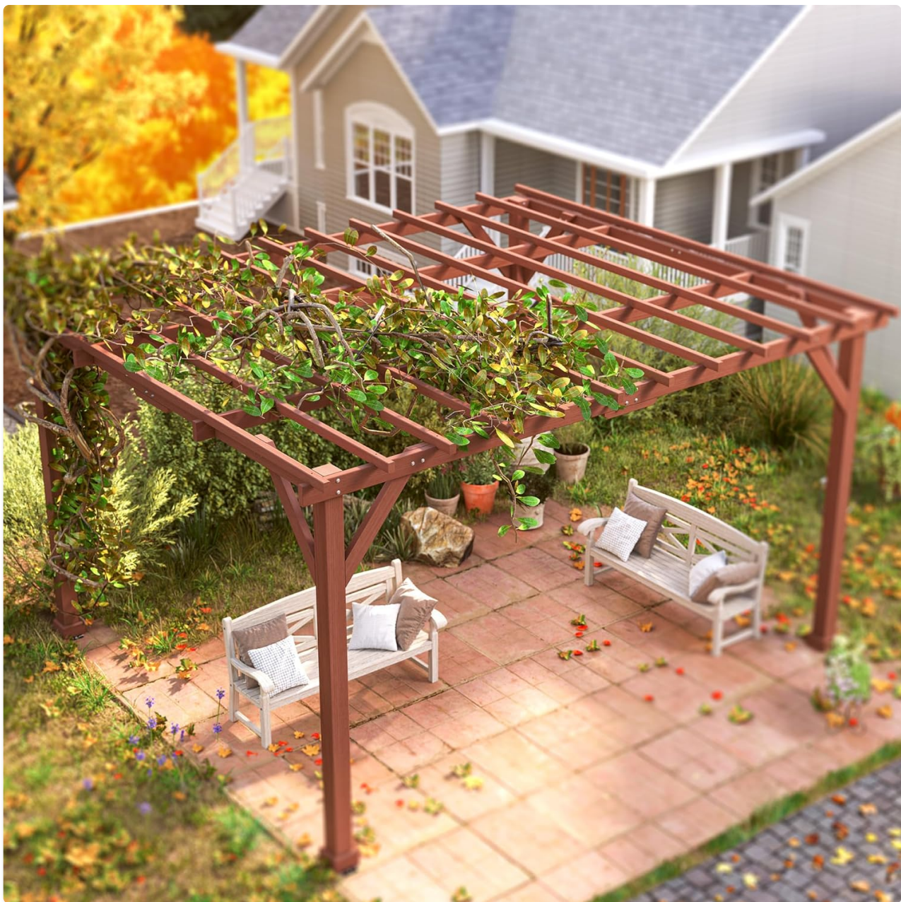
Figure 5: A pergola with established climbing plants, demonstrating its function as a grape trellis.