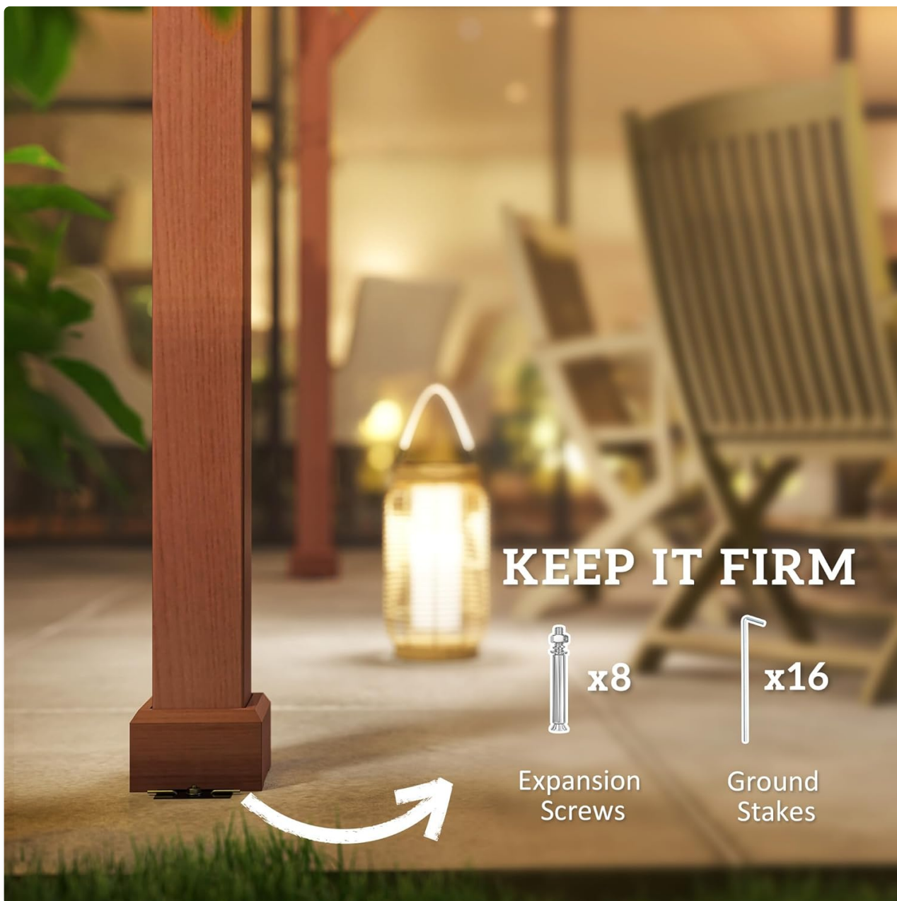
Figure 3: Illustration of how the pergola posts are secured using expansion screws and ground stakes for maximum stability.