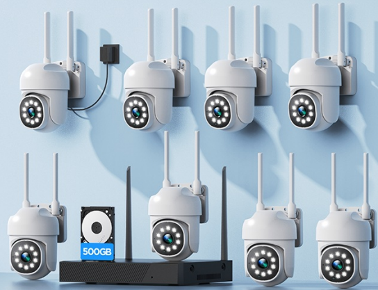
Image: Diagram illustrating the wireless connection between multiple CAMCAMP cameras and the NVR unit.

Your browser does not support the video tag.