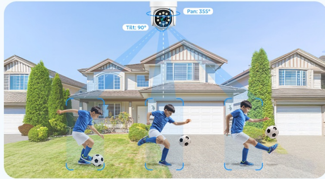
Image: Illustration of the camera's 355° pan and 90° tilt capabilities, highlighting its wide surveillance coverage.

CAMCAMP dome camera features with 355° pan and 90° tilt adjustment to continuously lock moving person, to ensure that no one is missed.