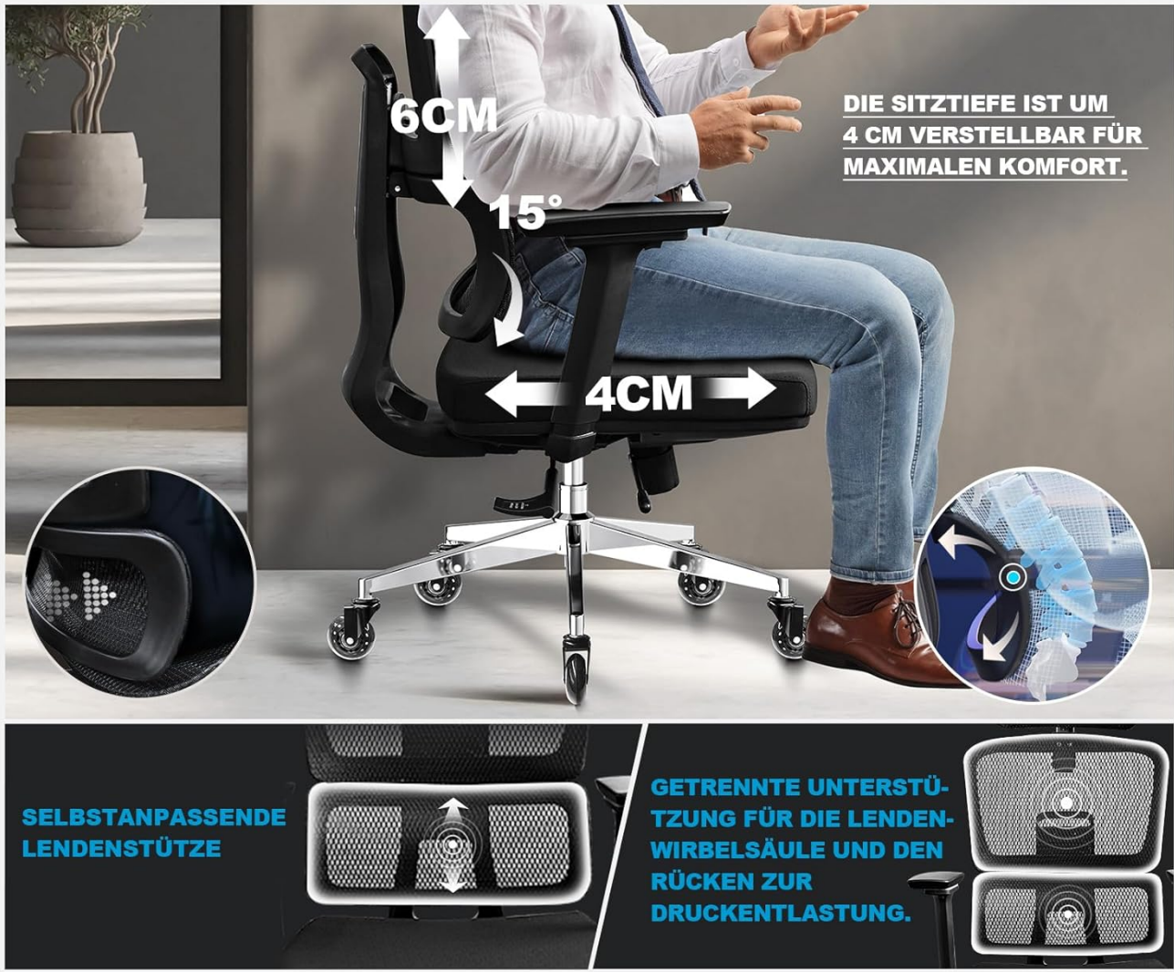
Figure 5: Adjustable lumbar support and 4 cm seat depth adjustment.

24-STUNDEN KOMFORTABLE PASSFORM, DIE PERFEKT DIE PROBLEME EINES STARREN RÜCKENS LÖST, DER SICH NICHT AN DIE KÖRPERKURVEN ANPASST!