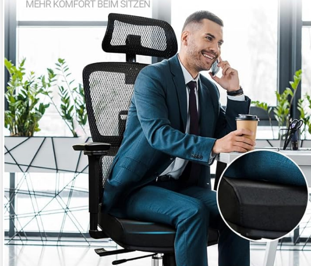
Figure 6: Quality standards and durability tests for the MELOKEA E060B chair.

PASST BESSER AN DEN KÖRPER, SCHÜTZT KNIE, MEHR KOMFORT BEIM SITZEN