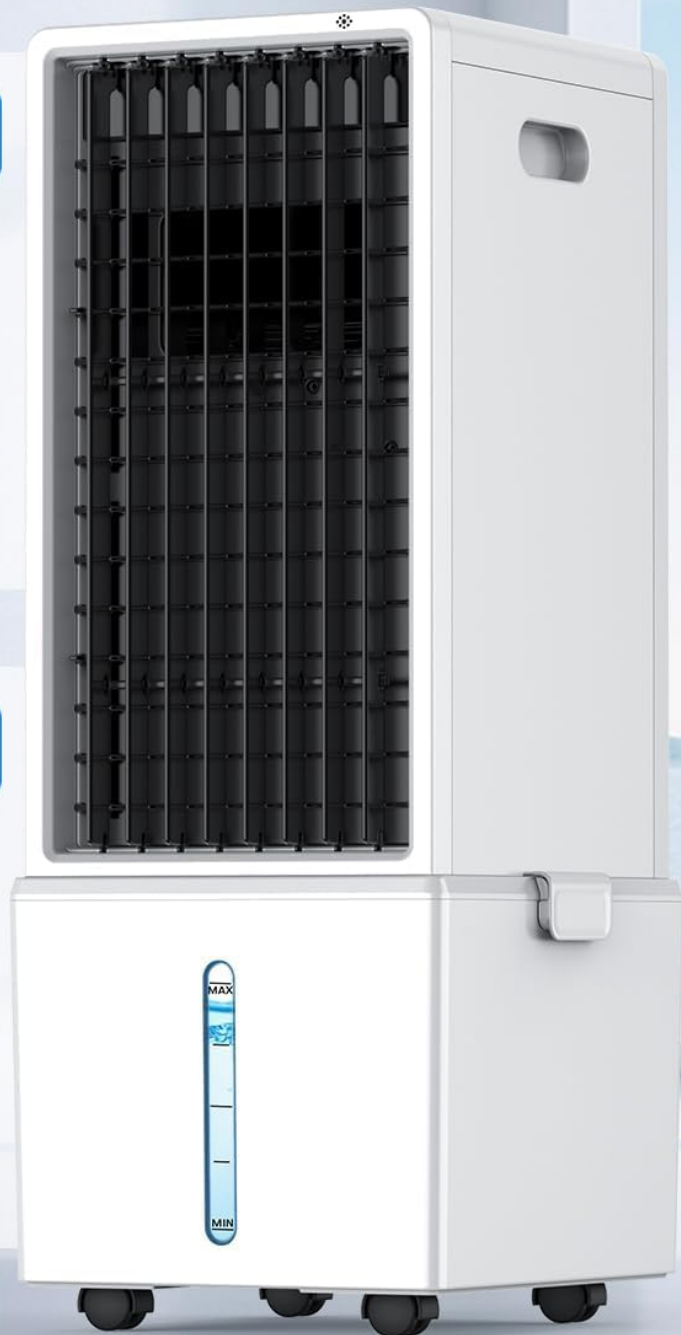
Image Description: A visual representation of the COOLECH Air Cooler highlighting its 4 modes (Normal, Natural, Sleep, Cooling) and 4 speeds (Low, Medium, High, Powerful) on the LED display, along with the water level indicator.