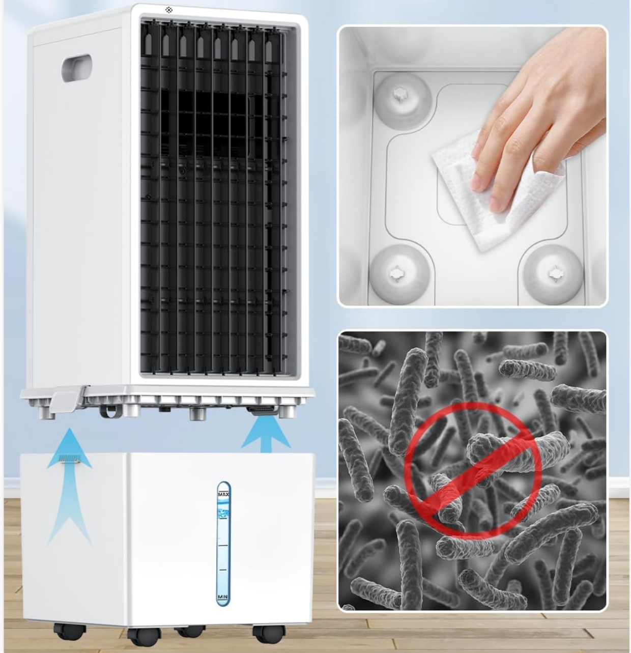
Image Description: This image shows the detachable water tank design, illustrating how to remove and clean it for hygiene and optimal performance.