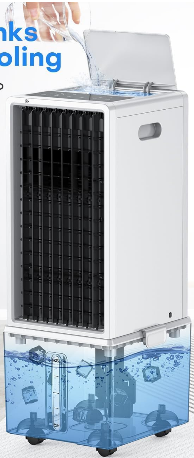
Image Description: This image illustrates the double tank design of the COOLECH Air Cooler, emphasizing its 3.2-gallon capacity for up to 24 hours of continuous cooling.