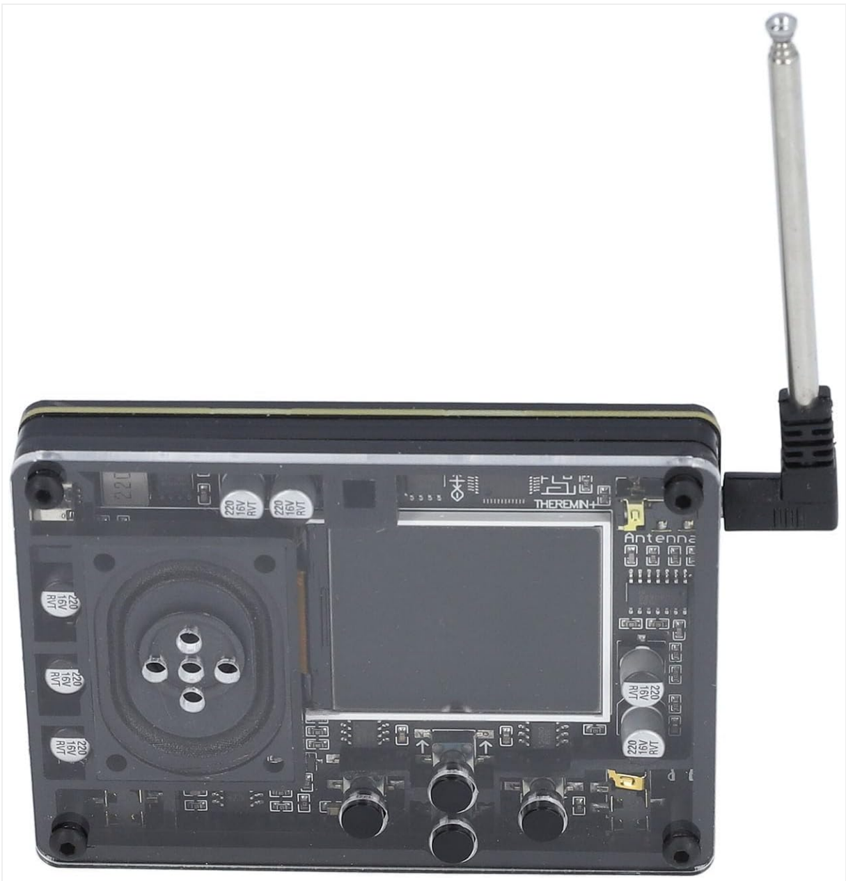
Side view of the Akozon Mini Theremin with one antenna attached, illustrating the connection point.