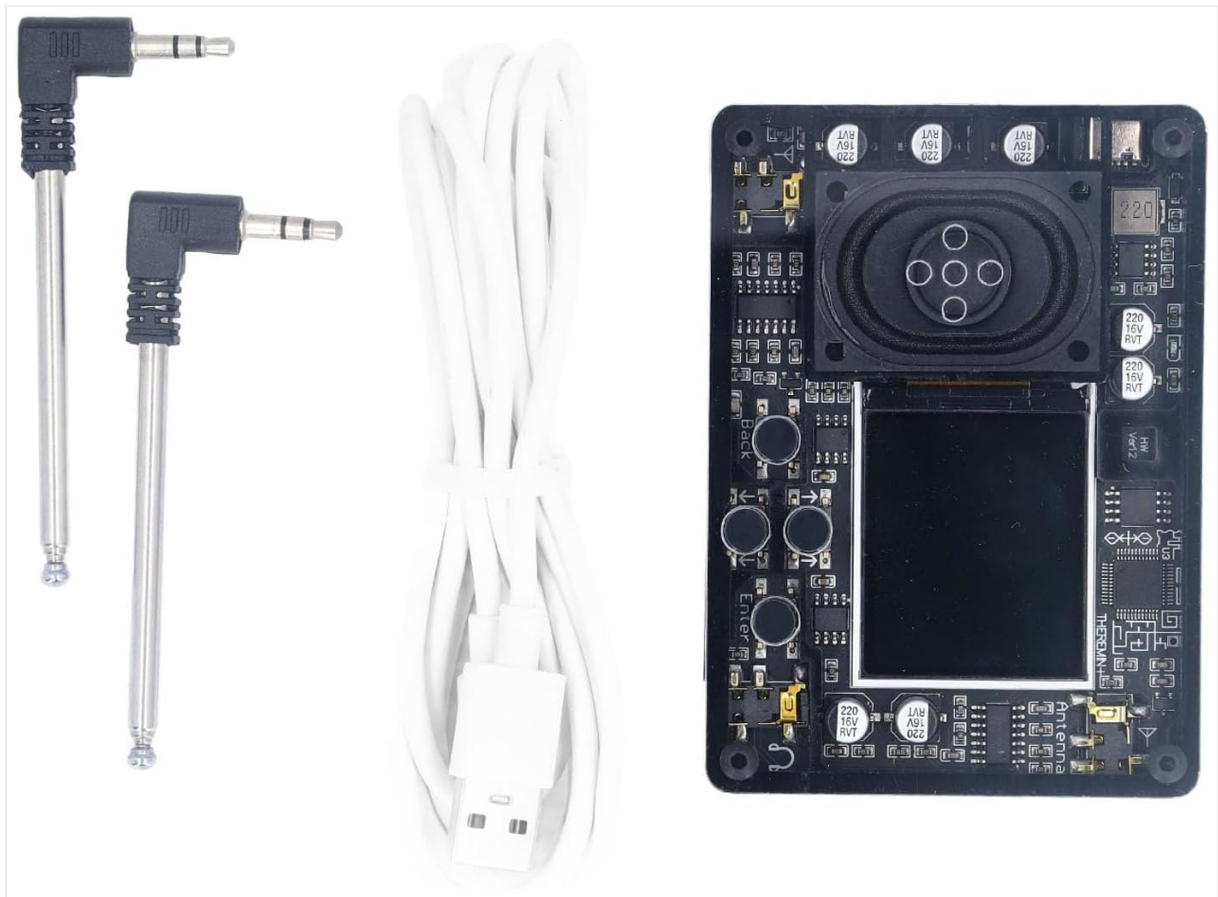
Image showing the complete package contents: the Theremin module, two antennas, and a Type-C USB cable.