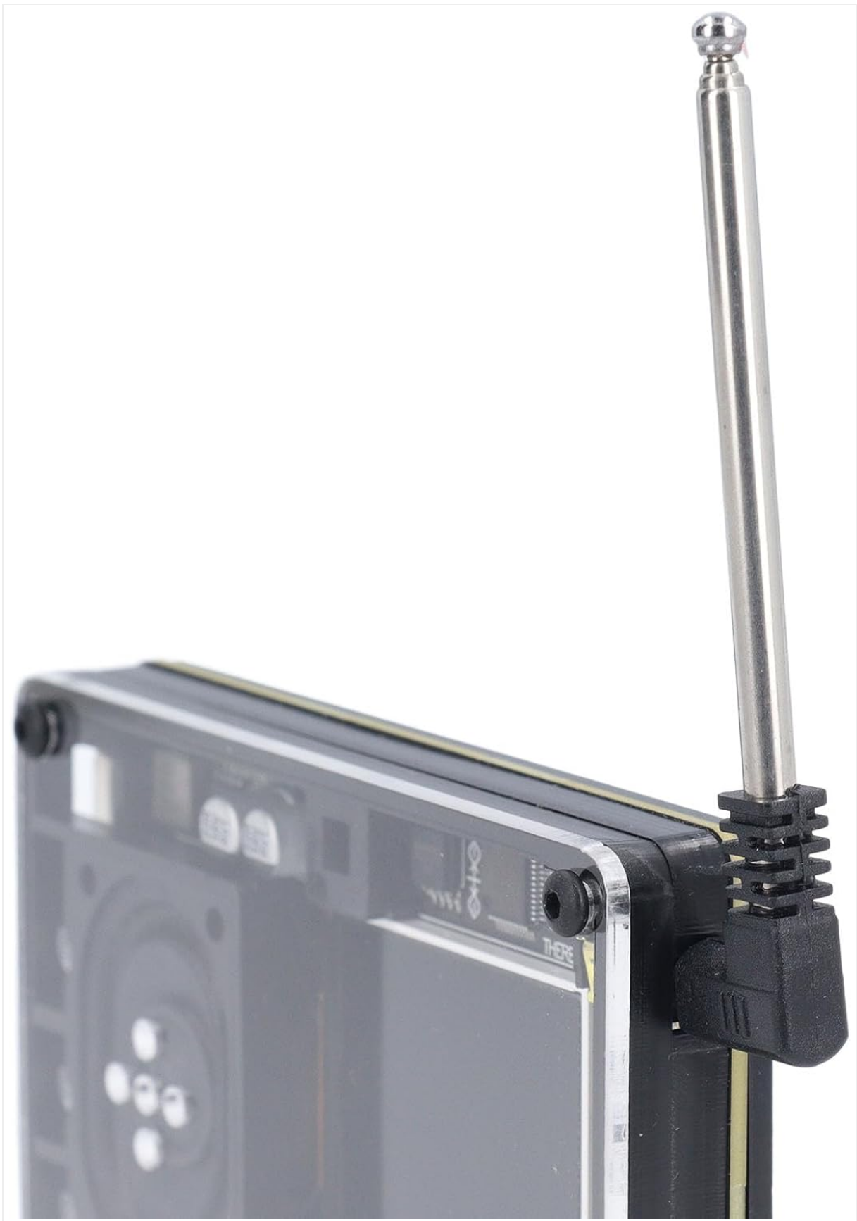
Close-up view of the Akozon Mini Theremin's Type-C USB power port.