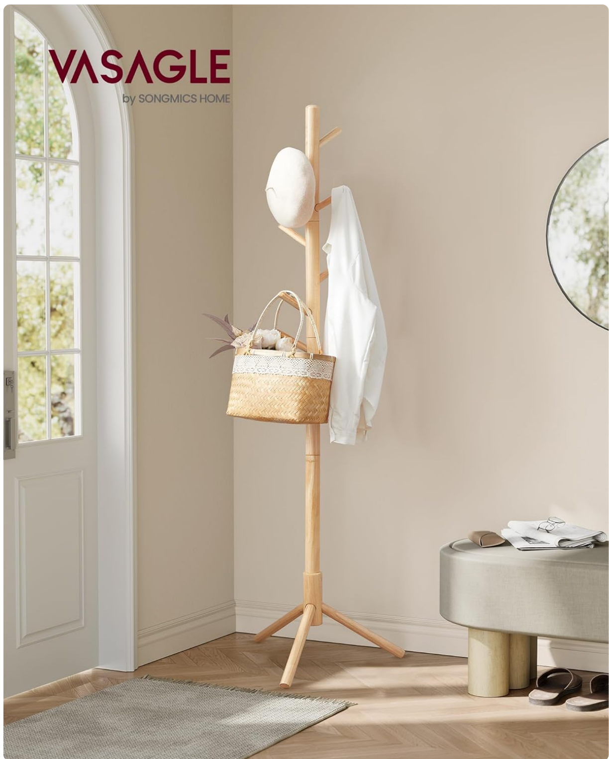
Image: The VASAGLE Solid Wood Coat Rack, showcasing its natural beige finish and tree-shaped design, positioned in a home entryway.