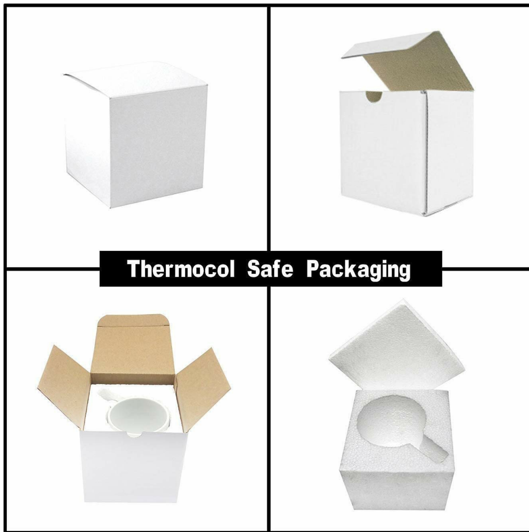
Image 2: Illustration of the thermocol safe packaging designed to protect the mug during shipping.