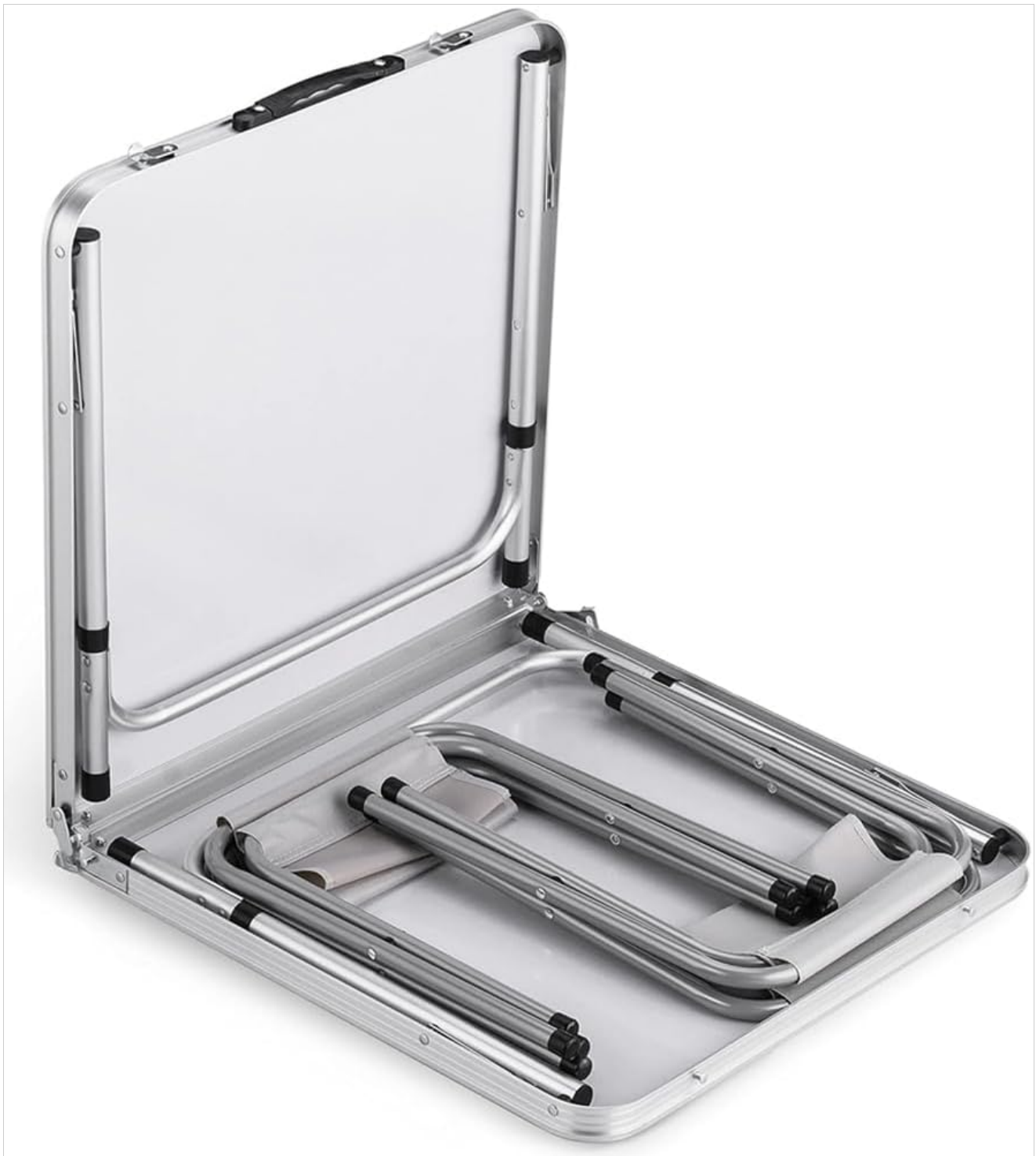
Figure 5: The table and chairs folded into a compact, portable case for easy storage and transport.