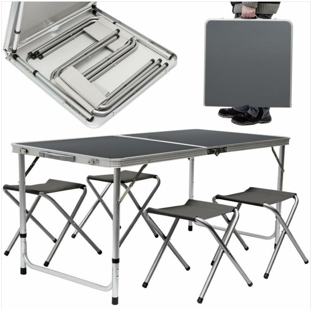
Figure 1: The BAKAJI folding table and chairs set, ready for use in an outdoor environment.