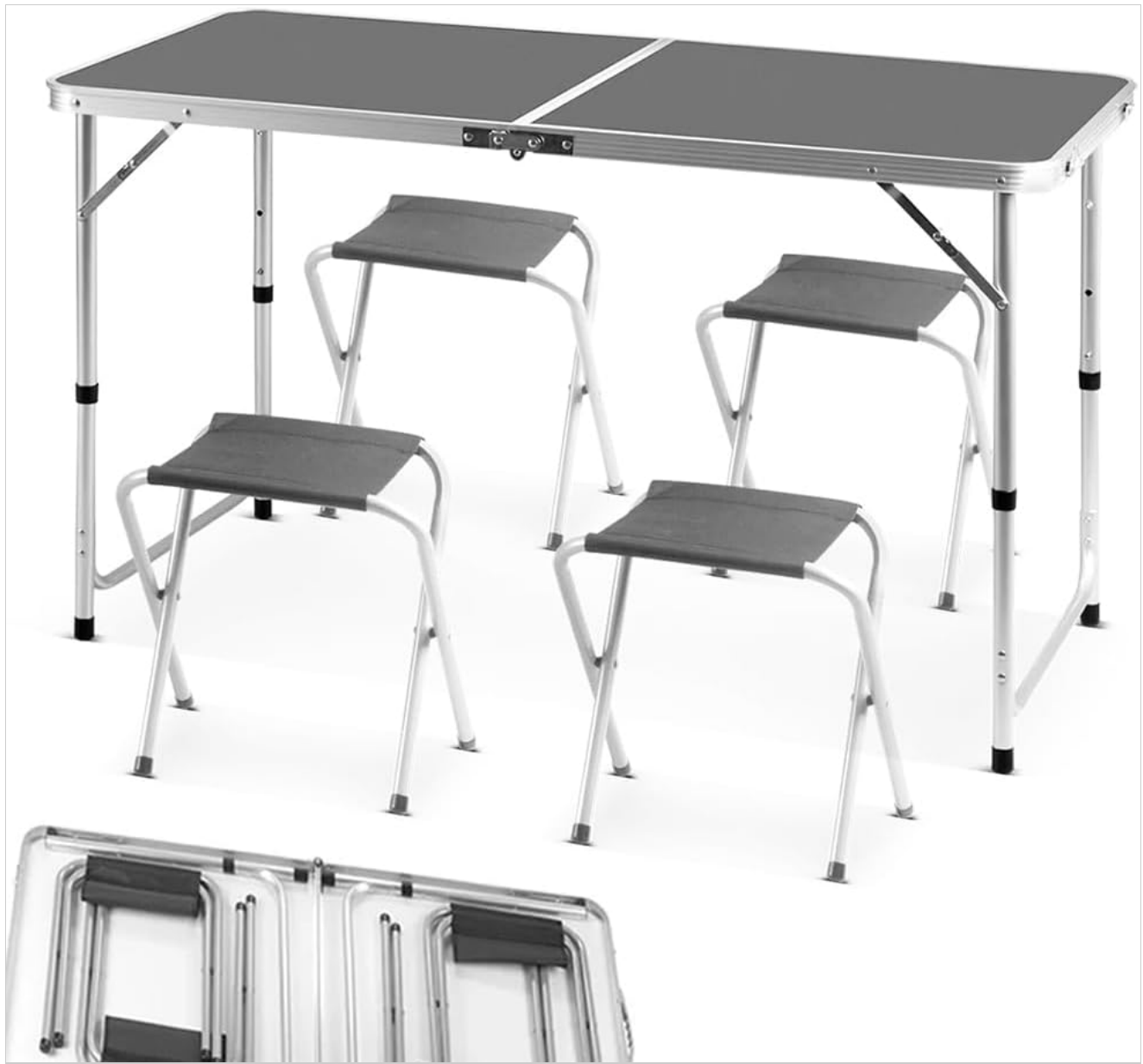
Figure 4: The complete set, including the table and four chairs, ready for use.