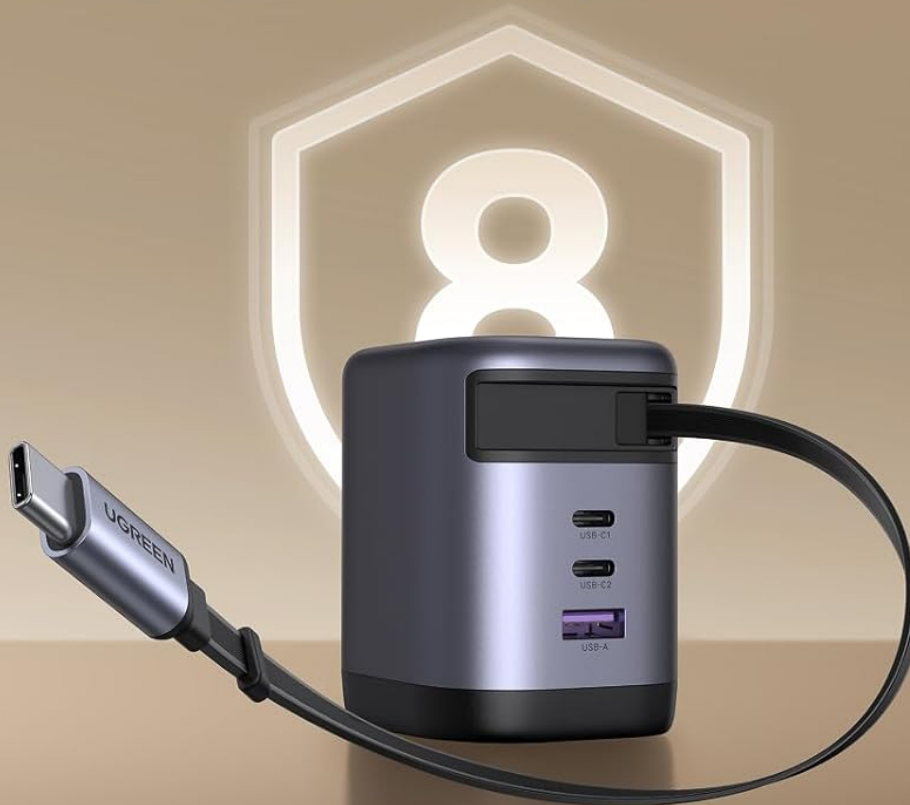
Figure 2.4: Diagram illustrating the 8-layer safety protection features, including overvoltage, overcurrent, short-circuit, and temperature protection.