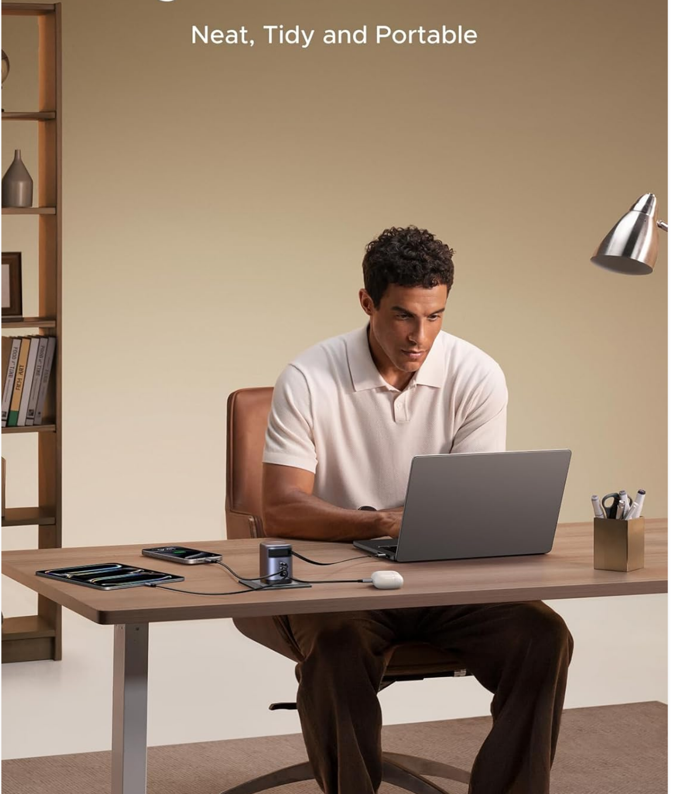
Figure 2.3: A user charging multiple devices (laptop, phone, earbuds, tablet) simultaneously with the UGREEN Nexode charger, illustrating its multi-device capability.