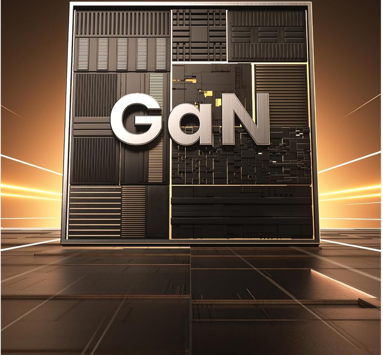
Figure 2.2: Visual representation of GaNInfinity Technology, highlighting the advanced GaN chip for higher conversion efficiency and smaller size.

Higher Conversion Efficiency Smaller Size