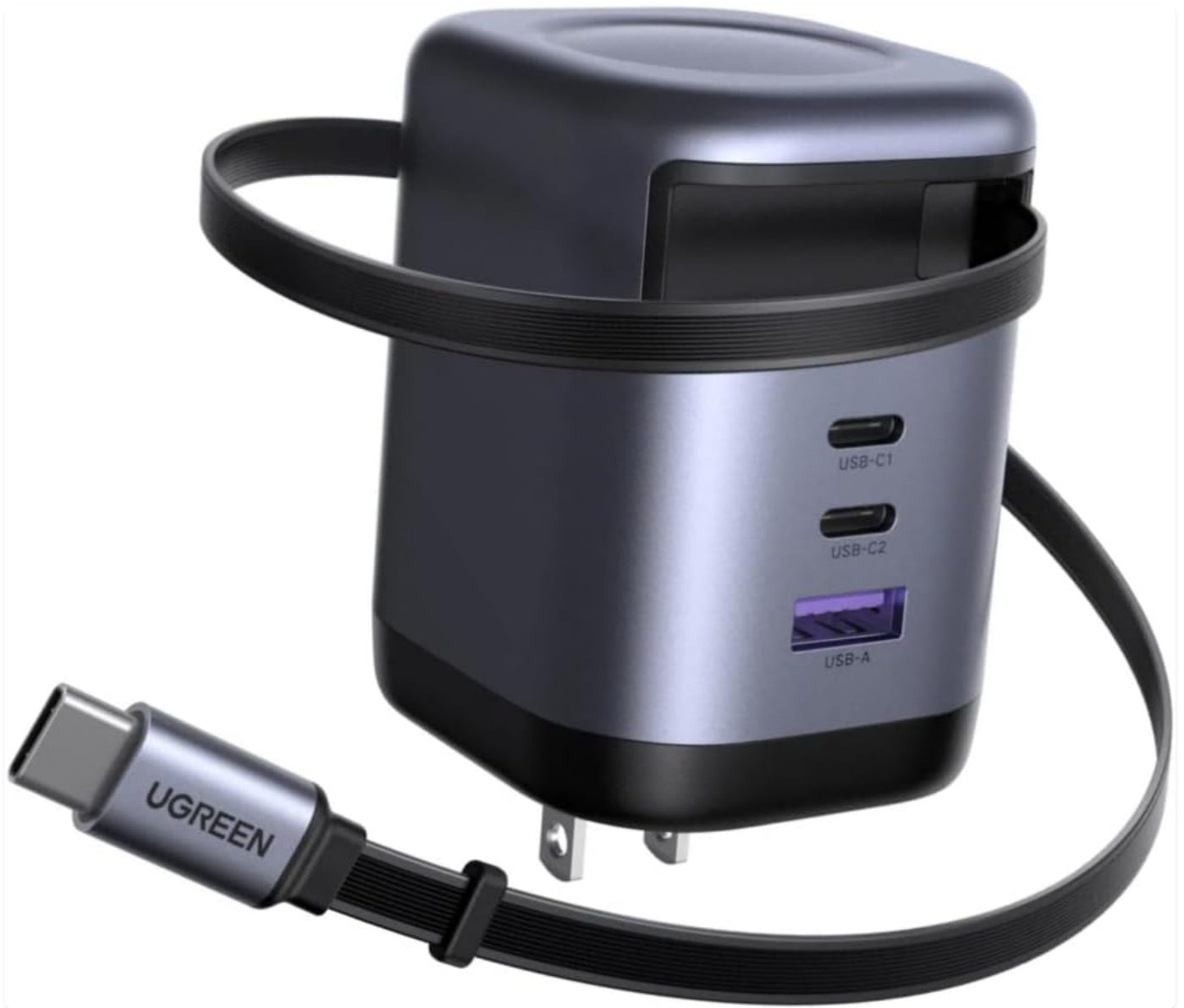
Figure 1.1: UGREEN Nexode 100W GaN USB C Retractable Charger. This image shows the compact charger with its integrated retractable USB-C cable and multiple output ports (USB-C1, USB-C2, USB-A).