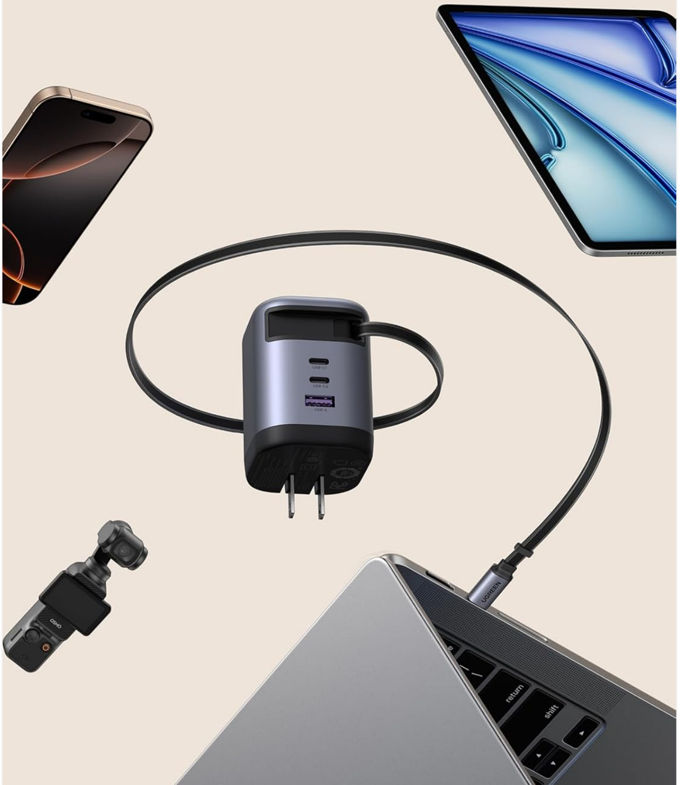
Figure 2.6: An image showcasing the charger's compatibility with various devices such as laptops, smartphones, tablets, and drones.