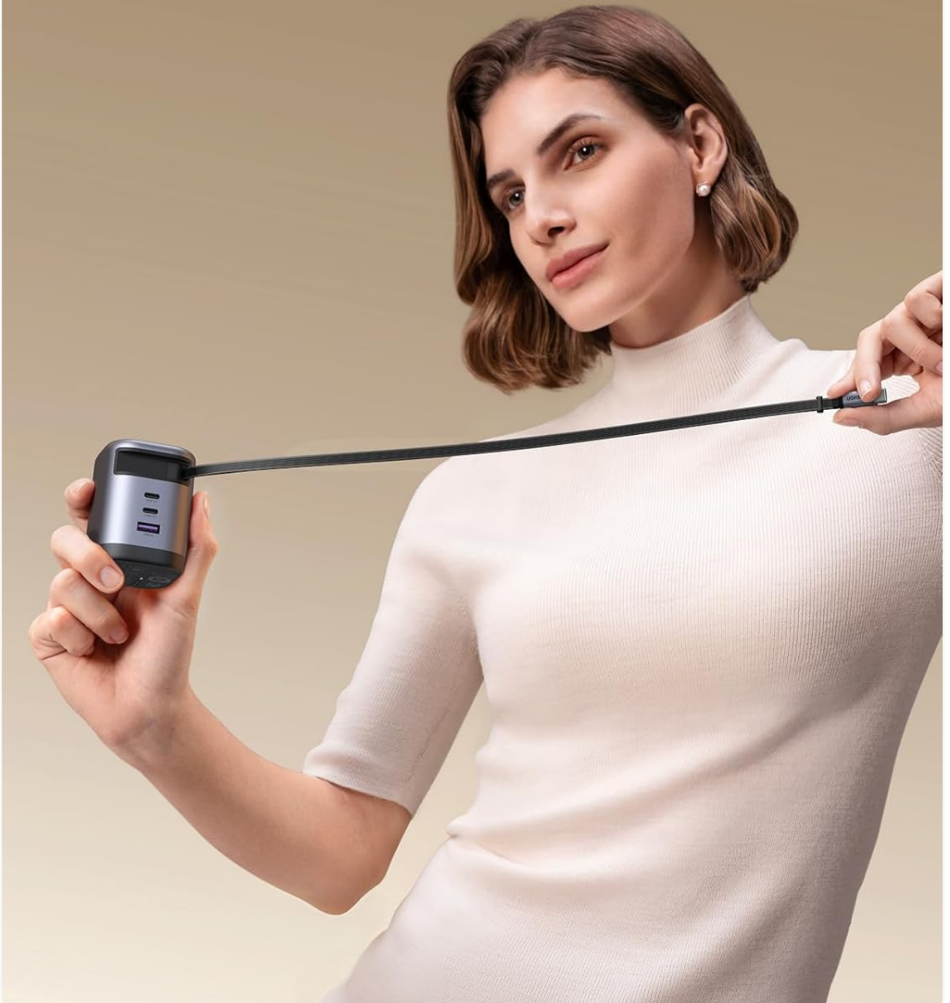
Figure 2.1: Illustration of the 75cm full-length coiled retractable cable, demonstrating its convenience and tangle-free design.