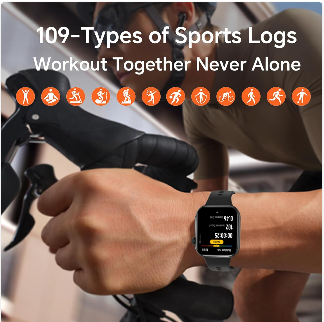
Figure 4.4: The watch tracking a cycling workout, demonstrating its 109+ sports modes.