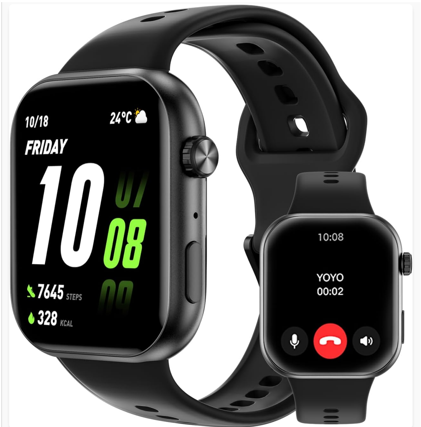
Figure 1.1: The HONOR CHOICE Watch 2i, a sleek black smartwatch with a vibrant display.