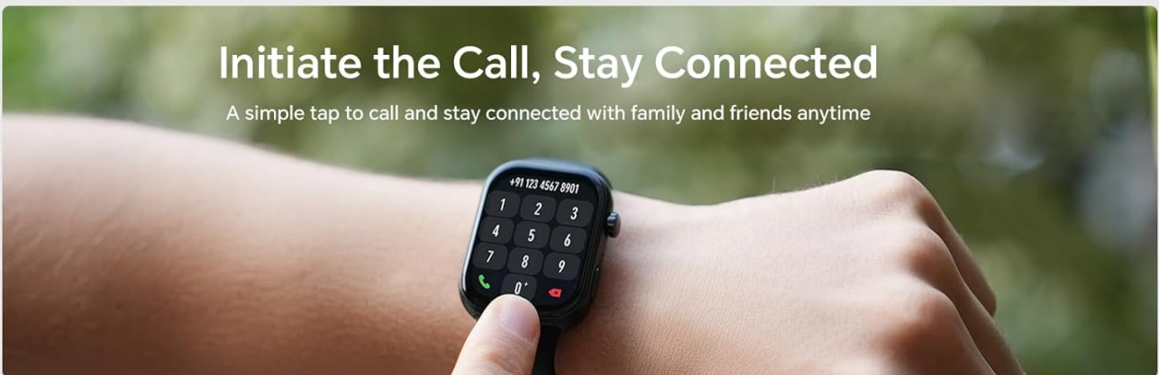
Figure 4.2: Bluetooth call functionality on the HONOR CHOICE Watch 2i.

A simple tap to call and stay connected with family and friends anytime