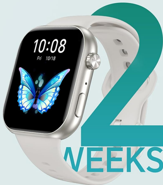
Figure 3.1: The HONOR CHOICE Watch 2i being charged, highlighting its extended battery life.

With comprehensive software and hardware optimization, it achieves an impressive two-week battery life on a single charge Eliminating the worry of battery life for smartwatches.