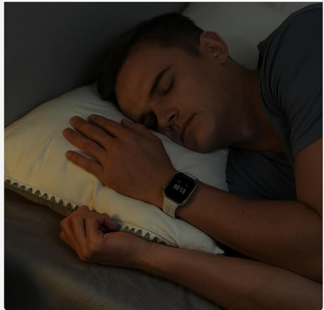
Figure 4.3: All-day health monitoring features.