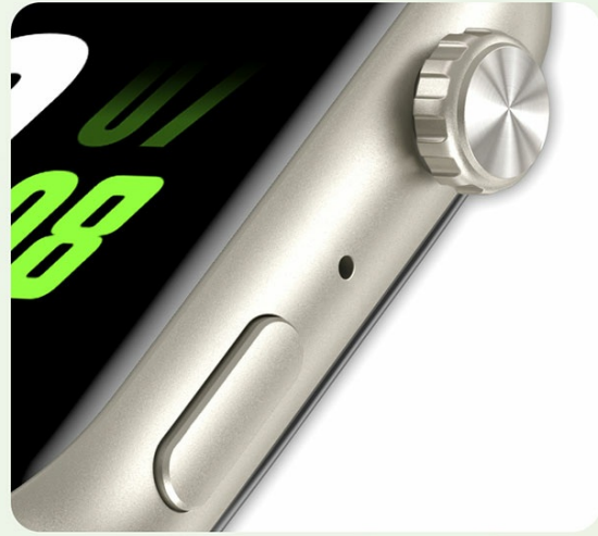
Figure 4.5: Overview of smart features on the watch.

Armonizza perfettamente estetica e funzionalità