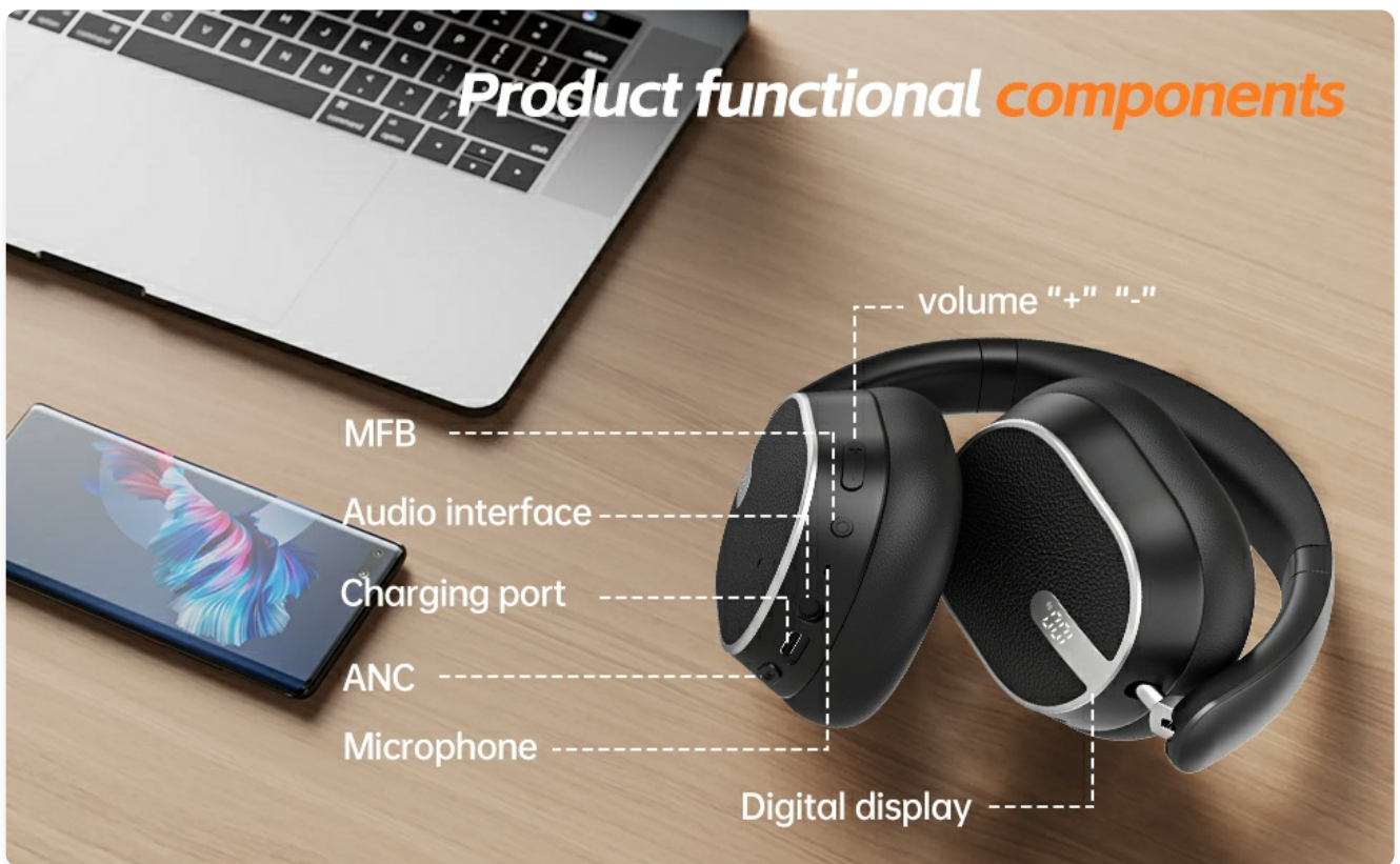
Image: A diagram illustrating the functional components of the Sisism H2 headphones, including volume controls, MFB (Multi-Function Button), audio interface, charging port, ANC button, microphone, and digital display.