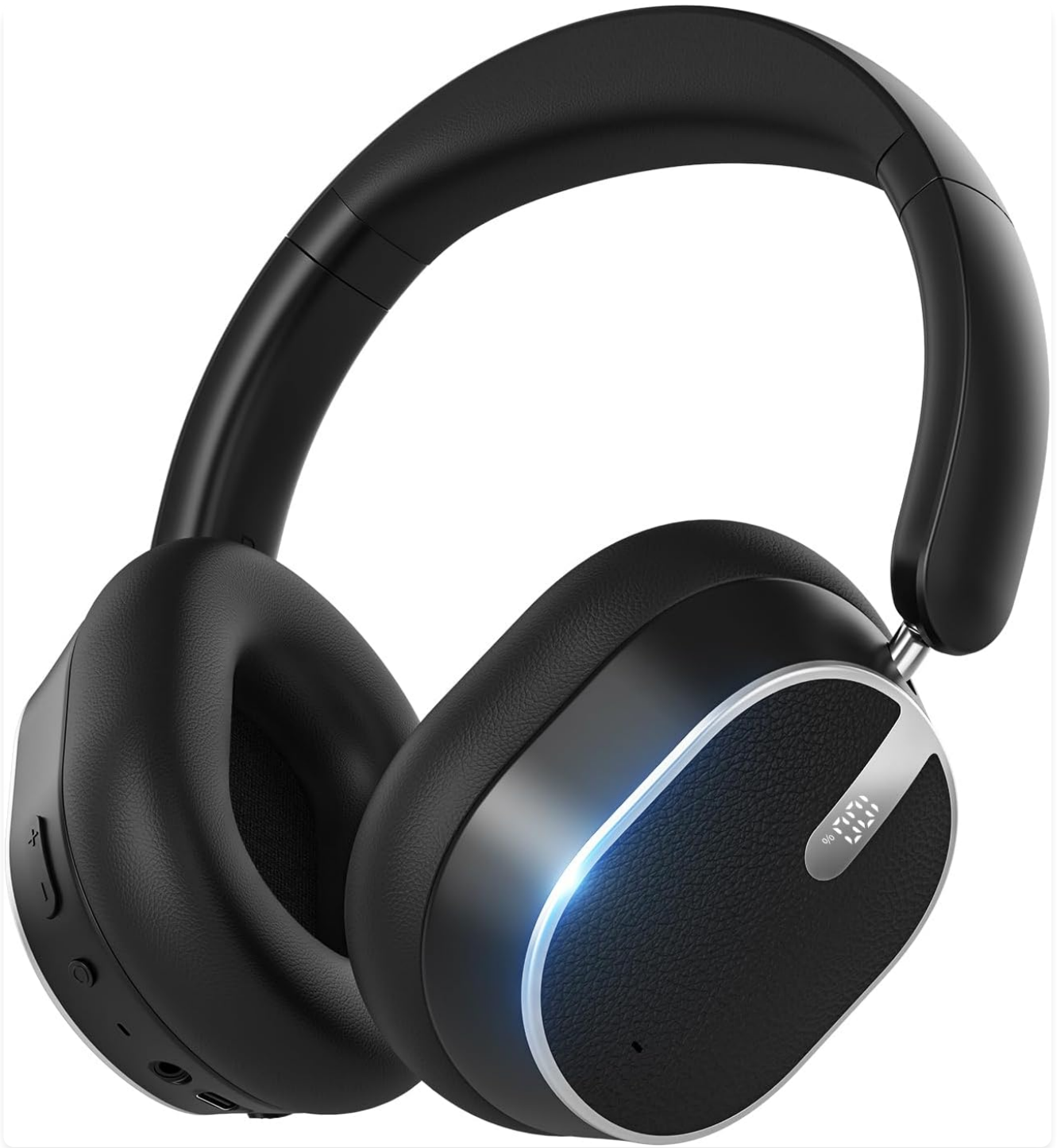
Image: The Sisism H2 Hybrid Active Noise Cancelling Headphones, black with silver accents, showcasing the over-ear design and earcups.