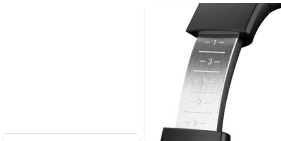
Image: Left: Sisism H2 headphones folded, demonstrating their portable design. Right: A close-up of the adjustable headband with numerical markings for precise fit.