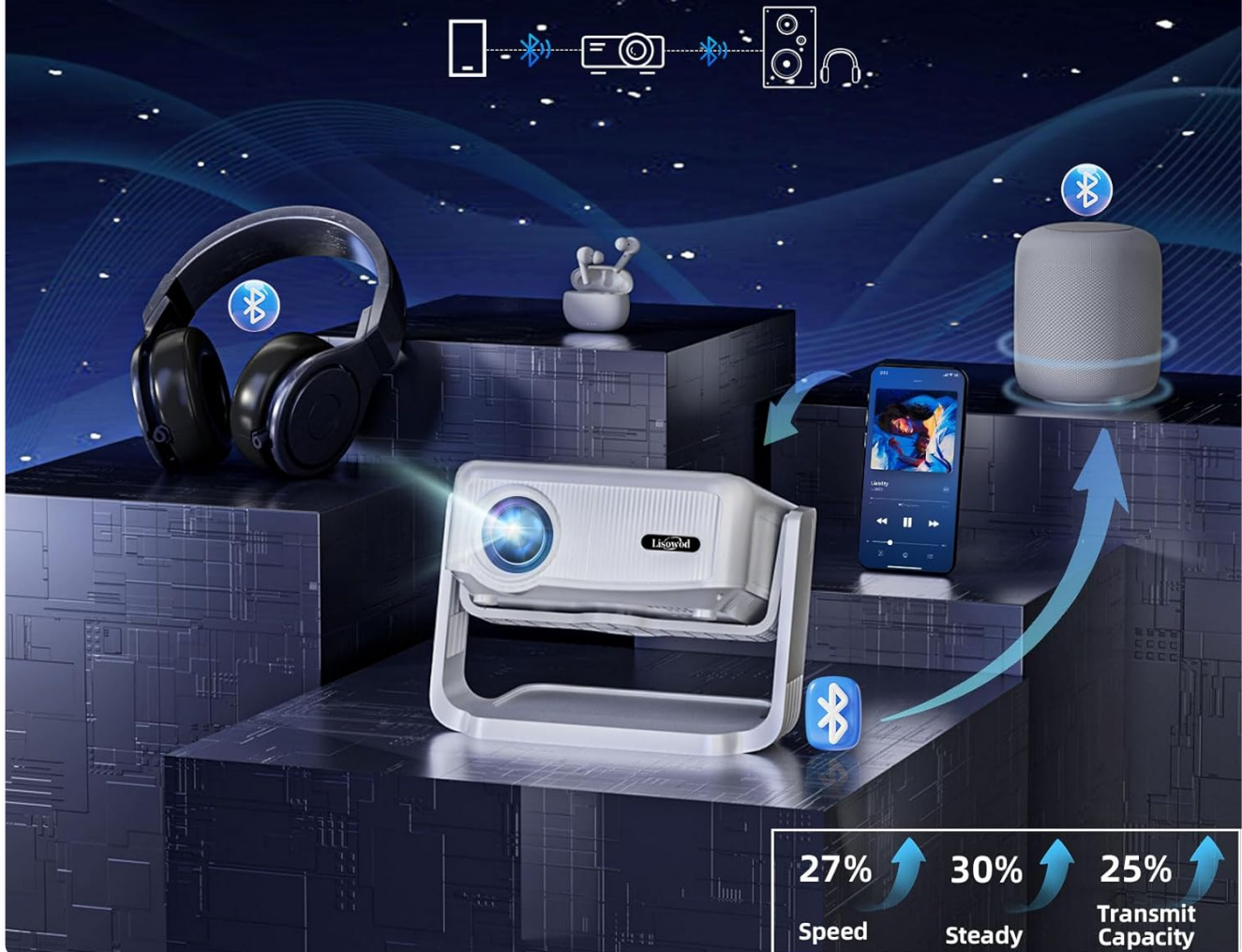
Image: The Lisowod L02 Mini Projector connected wirelessly to headphones and a portable speaker via Bluetooth 5.2.

Quick to Find Your Device and Reduce Signal Interference