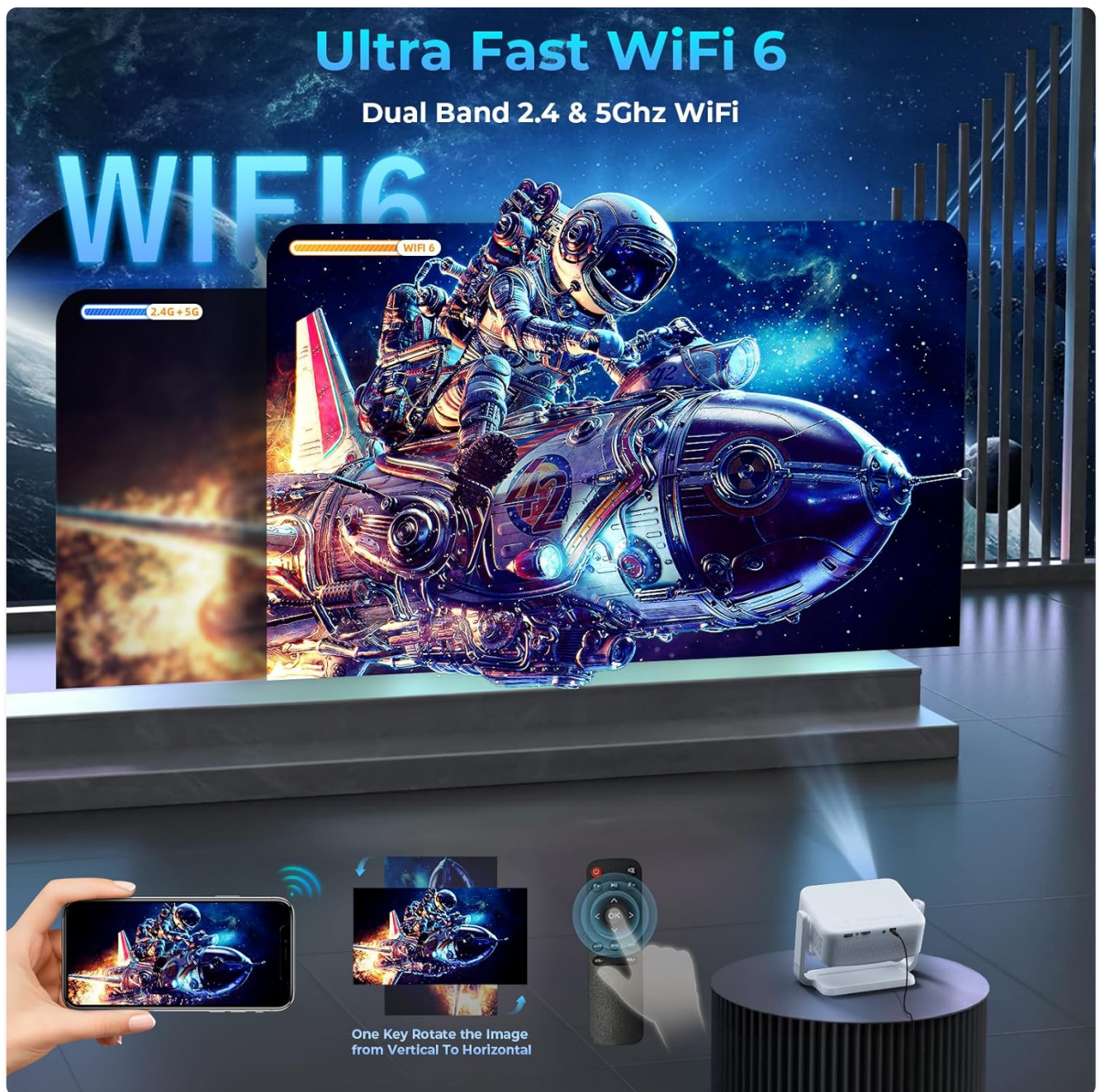
Image: A smartphone screen mirroring content to the Lisowod L02 Mini Projector, illustrating its Wi-Fi 6 capabilities.