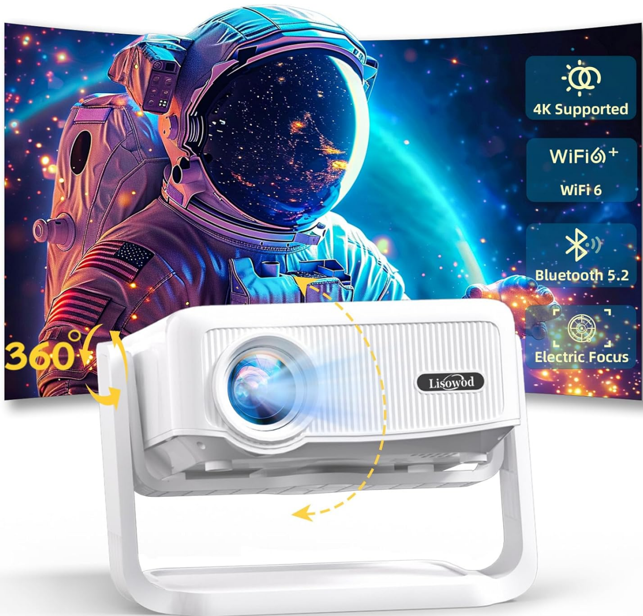
Image: Front view of the Lisowod L02 Mini Projector, showing the lens and the Lisowod branding.