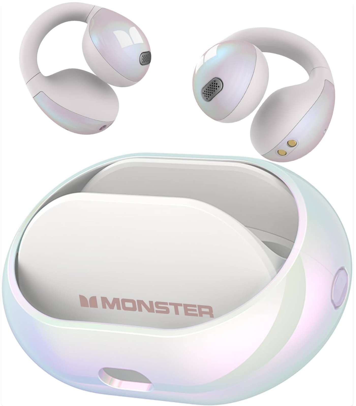
Image: Monster Open Ear AC600 Headphones and their charging case, showcasing the white, iridescent design.