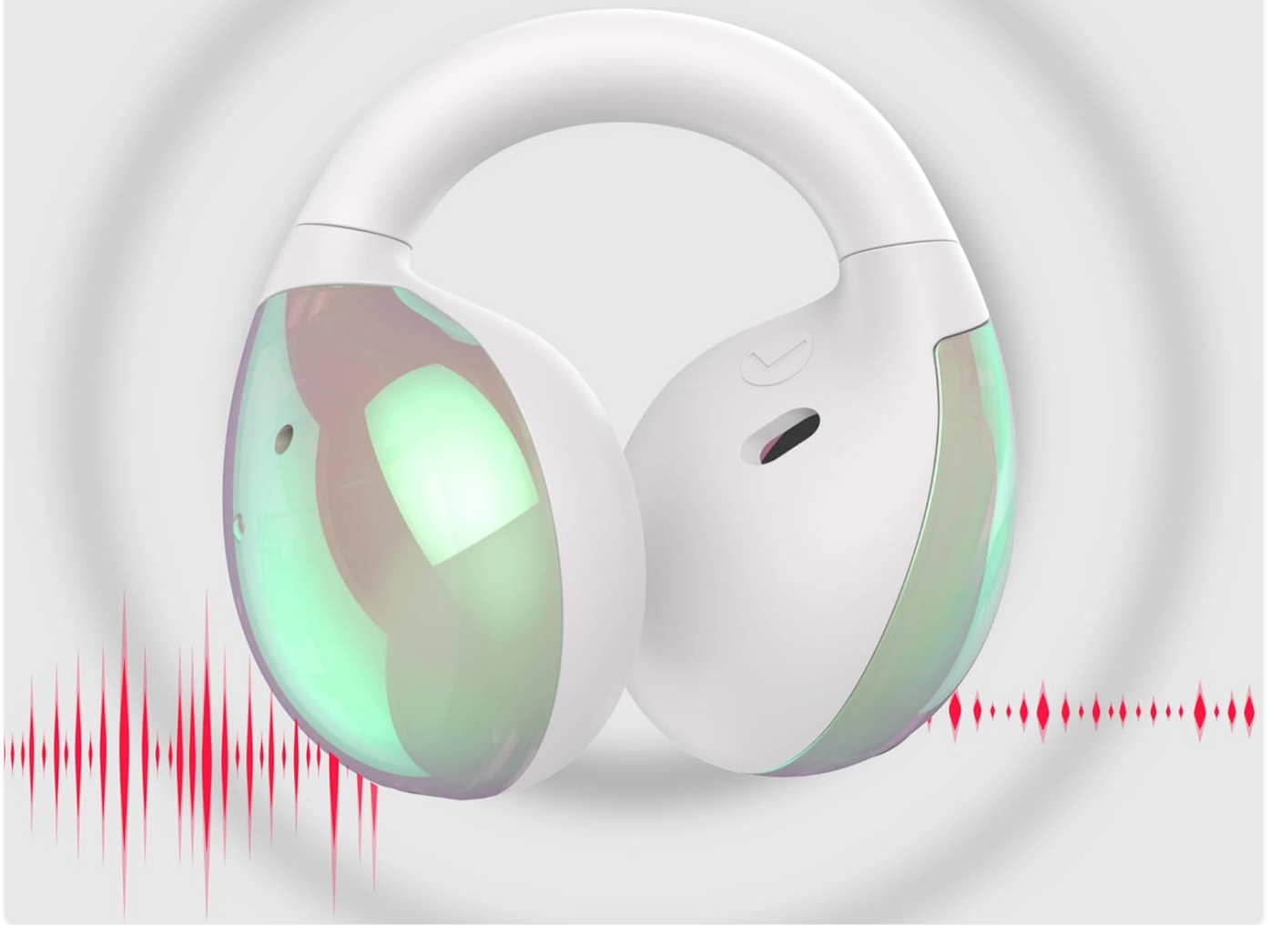
Image: The Monster Open Ear AC600 Headphones with an illustration of sound waves, representing the ENC noise reduction feature for clear calls.

Intelligently filters out ambient sounds while precisely capturing your voice