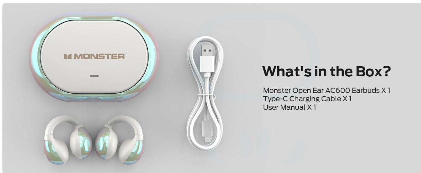
Image: The contents of the product box, including the Monster Open Ear AC600 Headphones, a Type-C charging cable, and the user manual.