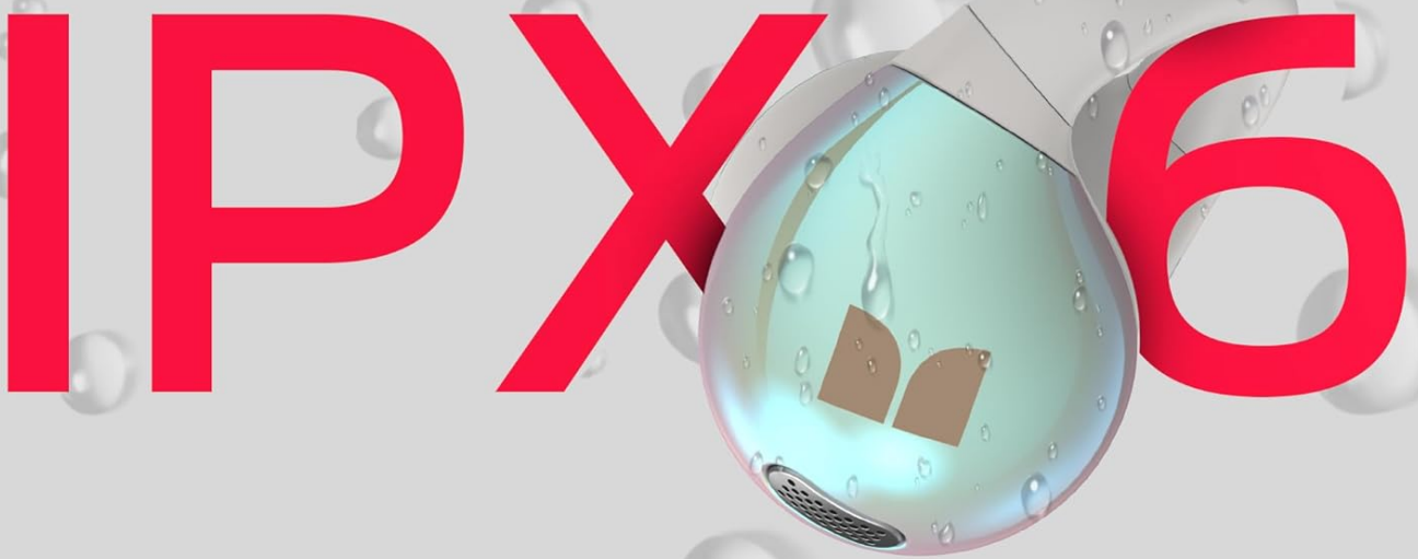
Image: The Monster Open Ear AC600 Headphones with water droplets, visually representing their IPX6 water-resistant rating, suitable for rain and sweat.