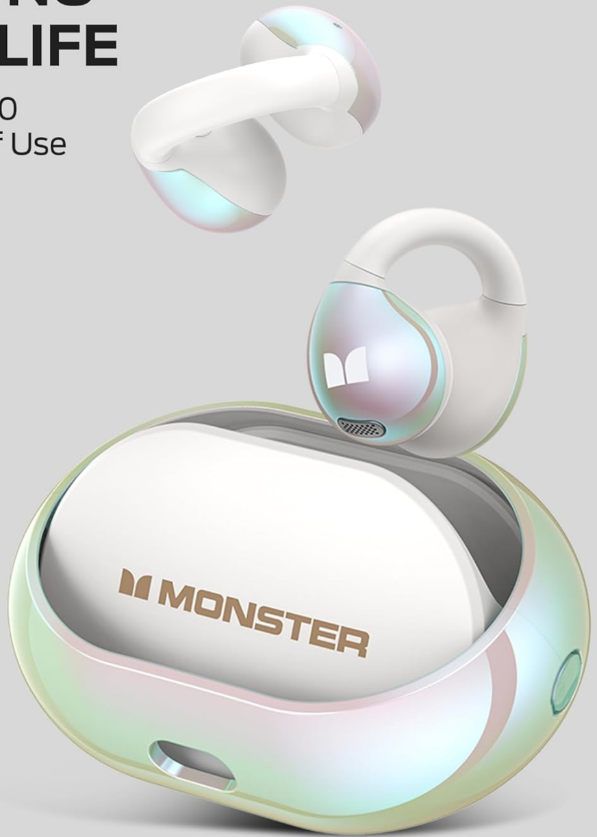
Image: The Monster Open Ear AC600 Headphones and their charging case, illustrating the long battery life and fast charging capabilities.