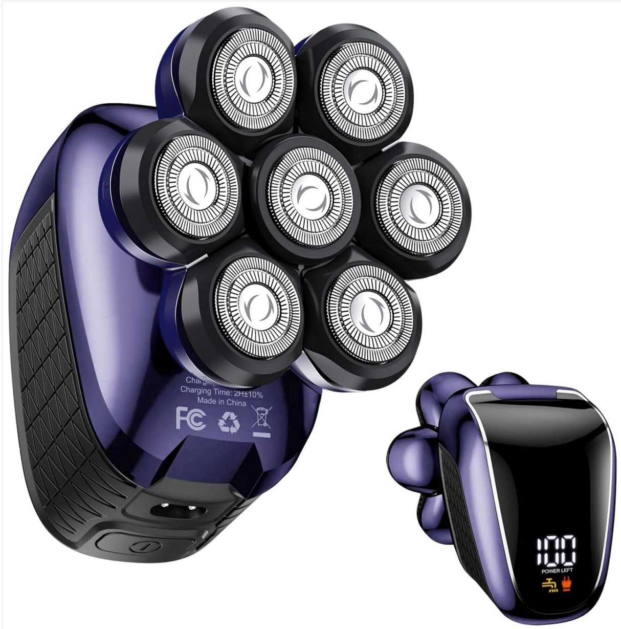
The Wyklus 5-in-1 Electric Head Shaver in Deep Blue, showcasing its ergonomic design and multiple rotary blades.

The Wyklus 5-in-1 Electric Head Shaver is designed for versatile grooming. It features a 7D floating shaving head, double-layer durable blades, an LED intelligent display, and is IPX6 waterproof for wet and dry use.