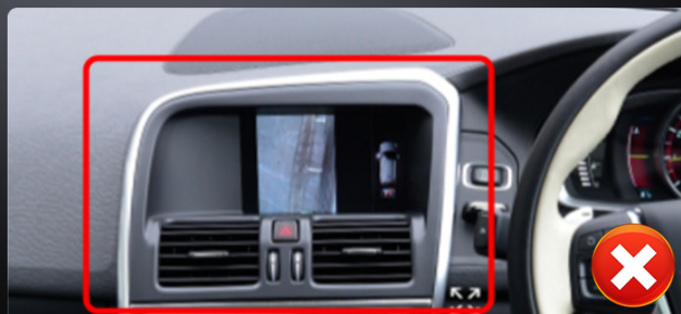
B: Right-hand drive

Image: Visual guide illustrating the difference between left-hand drive (Option A, compatible) and right-hand drive (Option B, incompatible) central control panels for Volvo XC60.