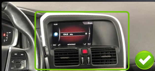
A: Left-hand drive

Before purchasing, please select the product based on your original car's central contropanel. This product only supports Option A. If you require Option B, pleasecontact our customer service for suitable recommendations