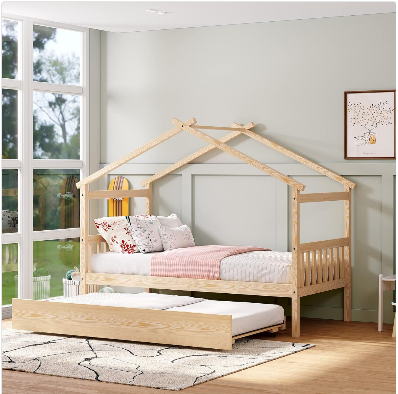
Image 1.1: The Bellemave Twin House Bed with Trundle, showcasing its natural wood finish and house-shaped frame, complete with the pull-out trundle bed.