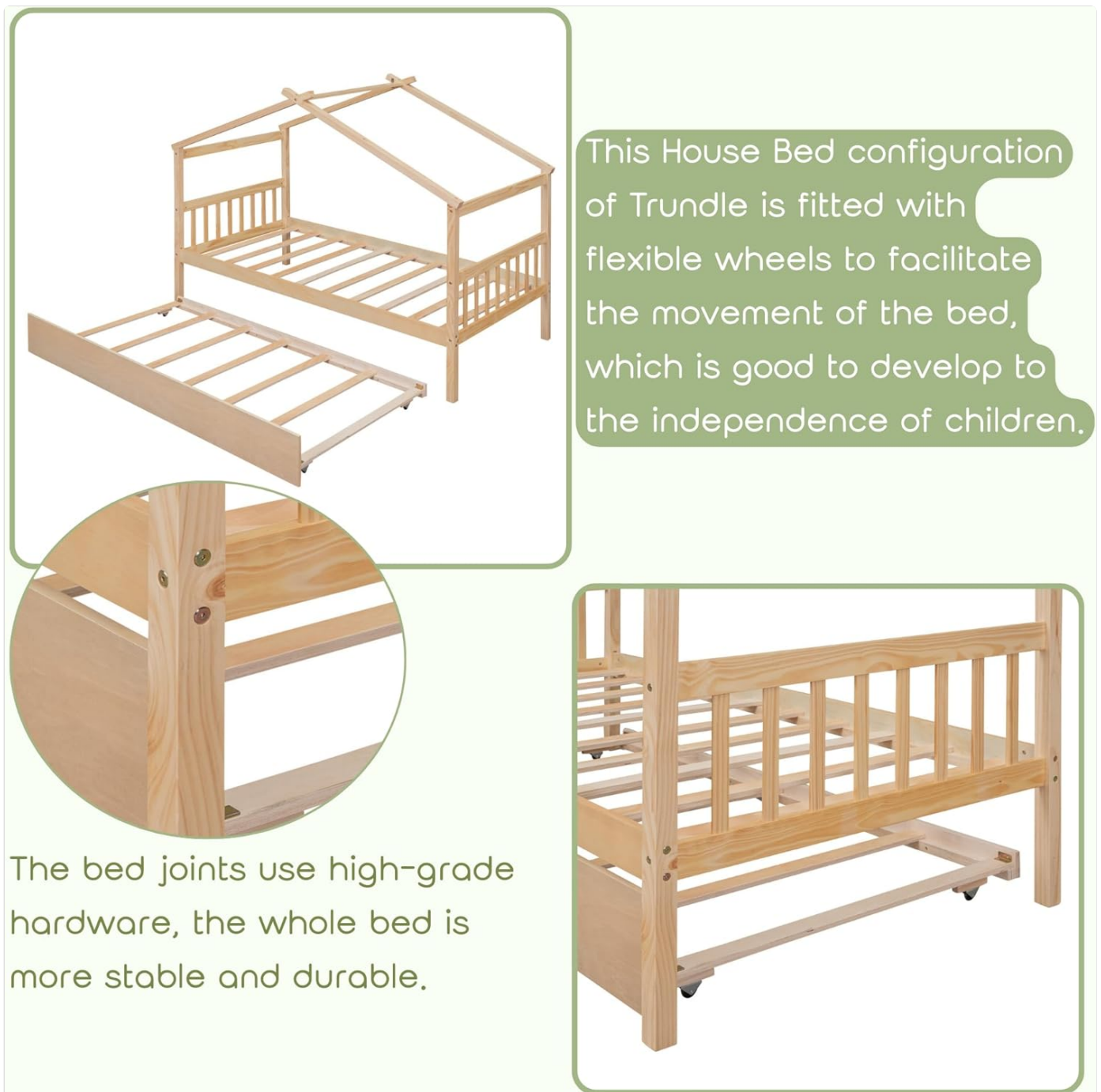
Image 4.1: Detail of the trundle bed's flexible wheels and sturdy construction, designed for smooth operation.