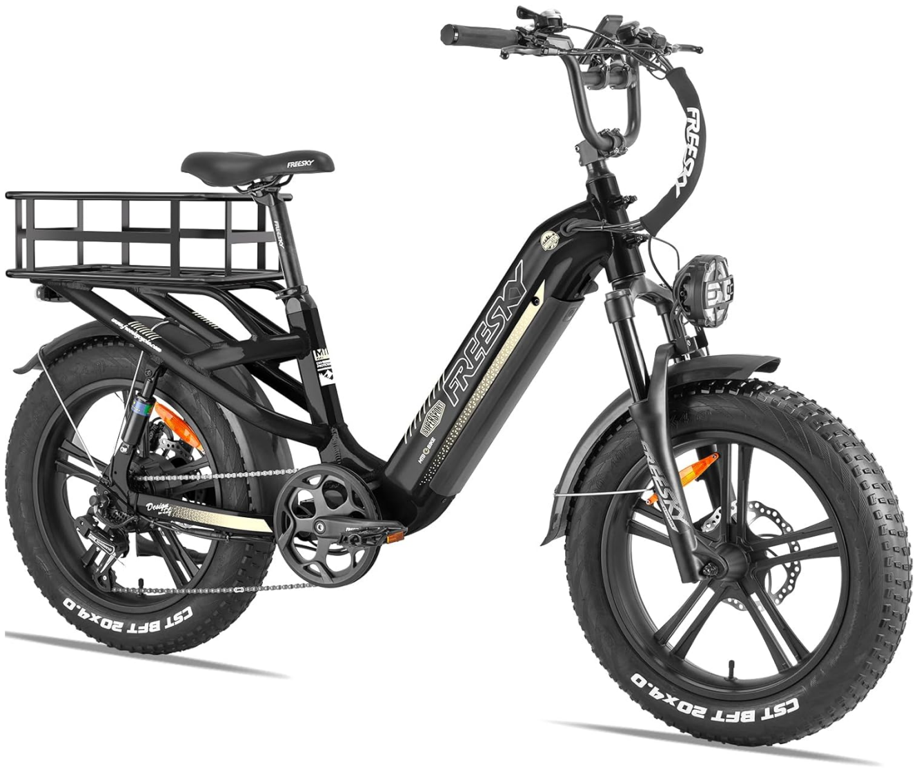
Image: The FREESKY 1200W Electric Bike, showcasing its robust design and integrated rear cargo rack.