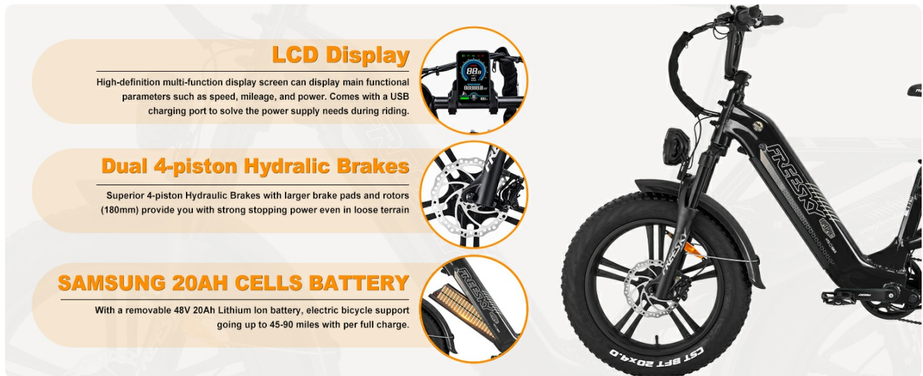
Image: Detailed view of the LCD display, highlighting its functions, alongside the dual 4-piston hydraulic brakes and the integrated Samsung 20Ah battery.

Press and hold the power button on the LCD smart display to turn on the bike. The display will show key riding metrics such as speed, battery level, mileage, and current riding mode. Use the control buttons near the display to navigate through modes and settings.