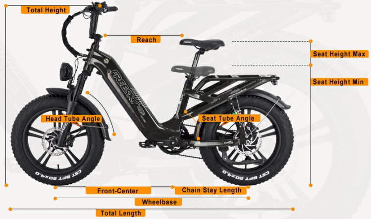
Image: A comprehensive diagram illustrating the key dimensions and specifications of the FREESKY electric bike, including total length, height, wheelbase, and seat height ranges.