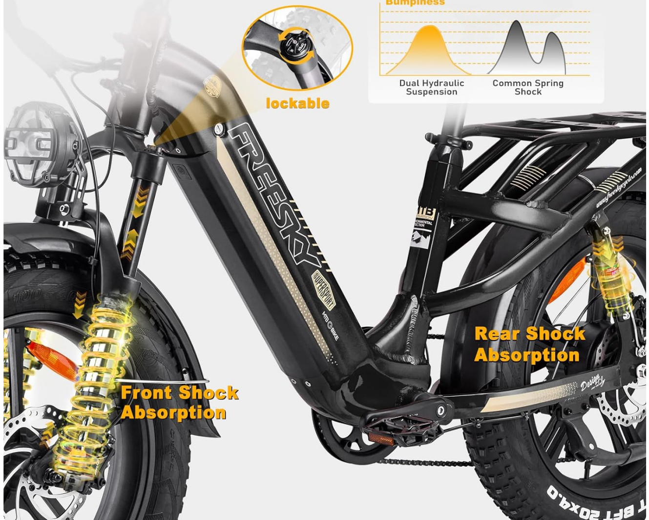
Image: An illustrative diagram showcasing the dual hydraulic suspension system, detailing both the front fork and rear shock absorption for enhanced riding comfort.

CDC continuously variable damping dual shock absorbers