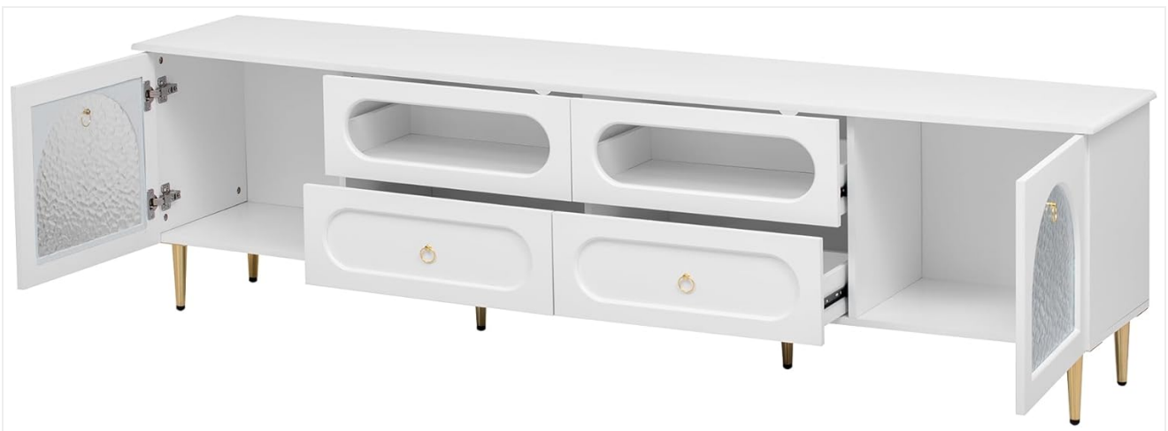
Figure 4.1: Interior view of the TV stand showing the open cabinets and drawers, highlighting the storage capacity.

The TV stand features four drawers and two side cabinets. The drawers and cabinets are equipped with easy-to-open pull rings for smooth and effortless access. Use these compartments to store media accessories, books, or other household items.