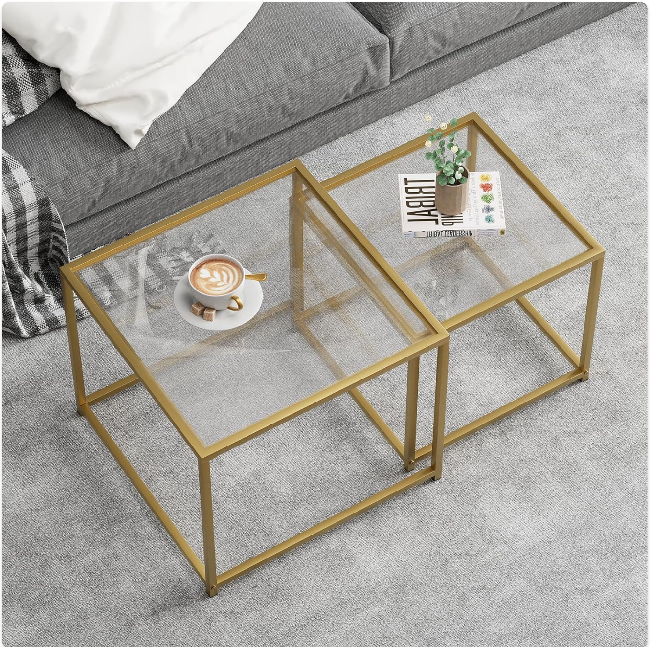
Image 1.1: The Adompacat Glass Coffee Table Set in a living room setting, demonstrating its nesting capability.