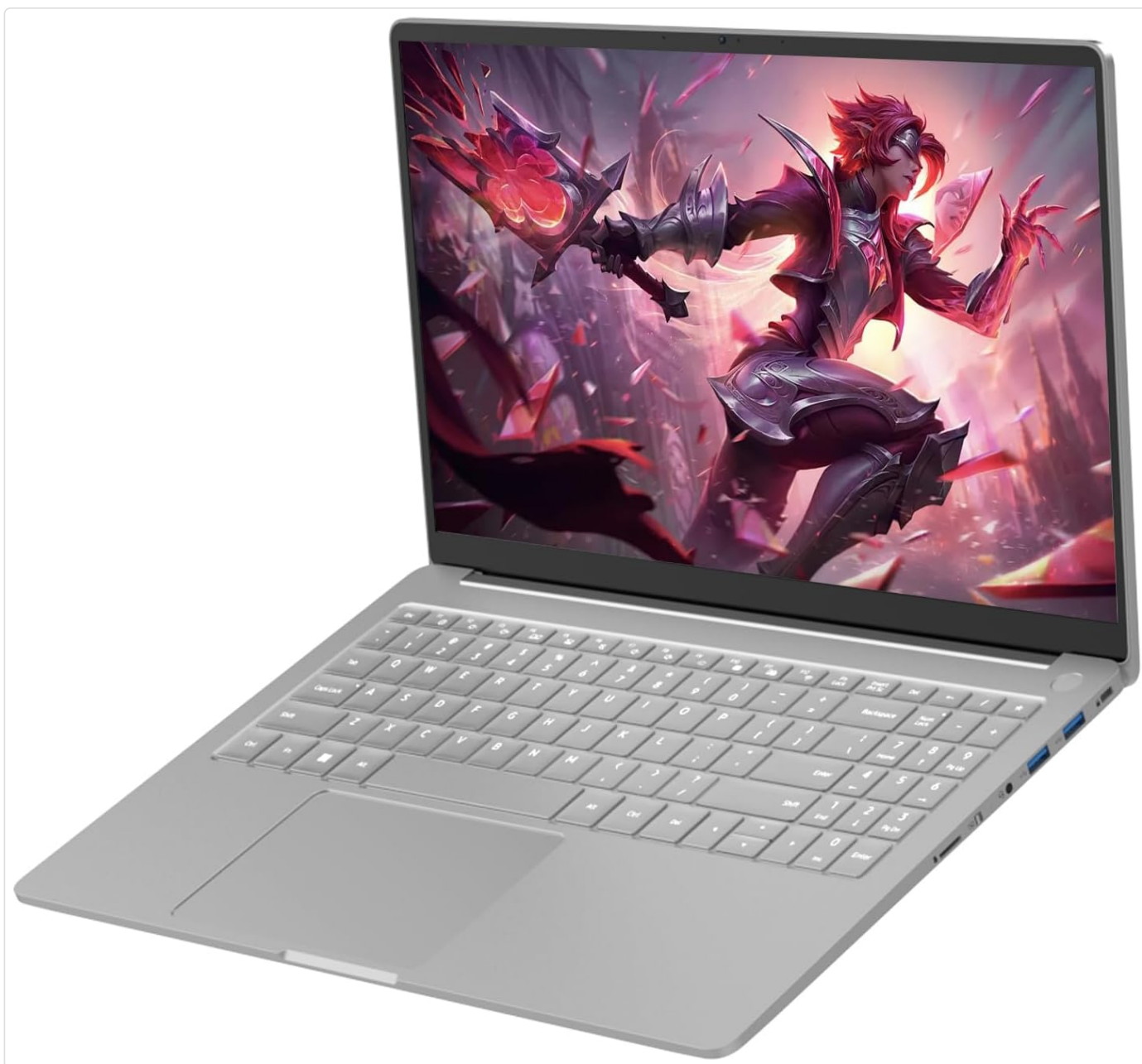
Figure 6: Side profile views of the laptop, illustrating the placement of various ports and connectors for easy access.