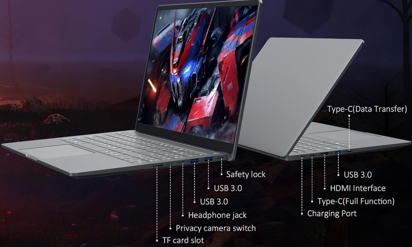
Figure 5: Overview of the laptop's rich interfaces, including USB 3.0, USB-C, HDMI, headphone jack, TF card slot, charging port, and safety lock.