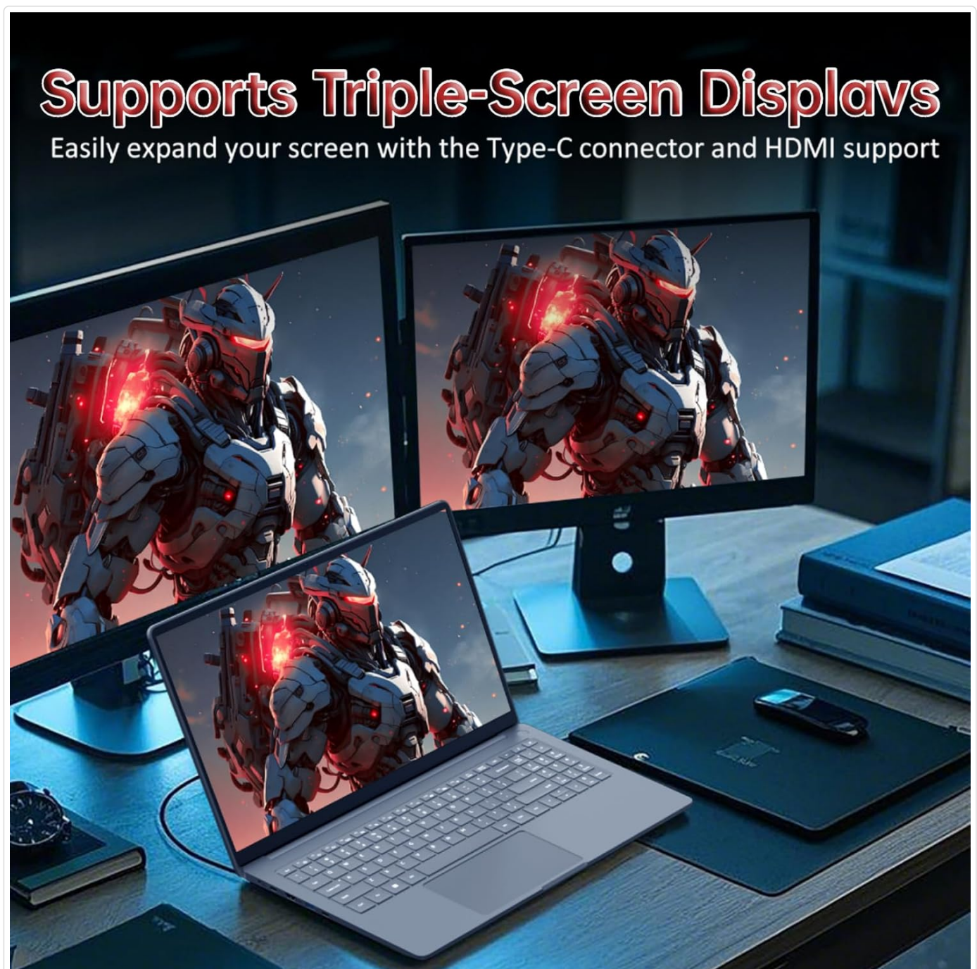
Figure 7: The laptop connected to two external monitors, showcasing its capability to support triple-screen displays for enhanced