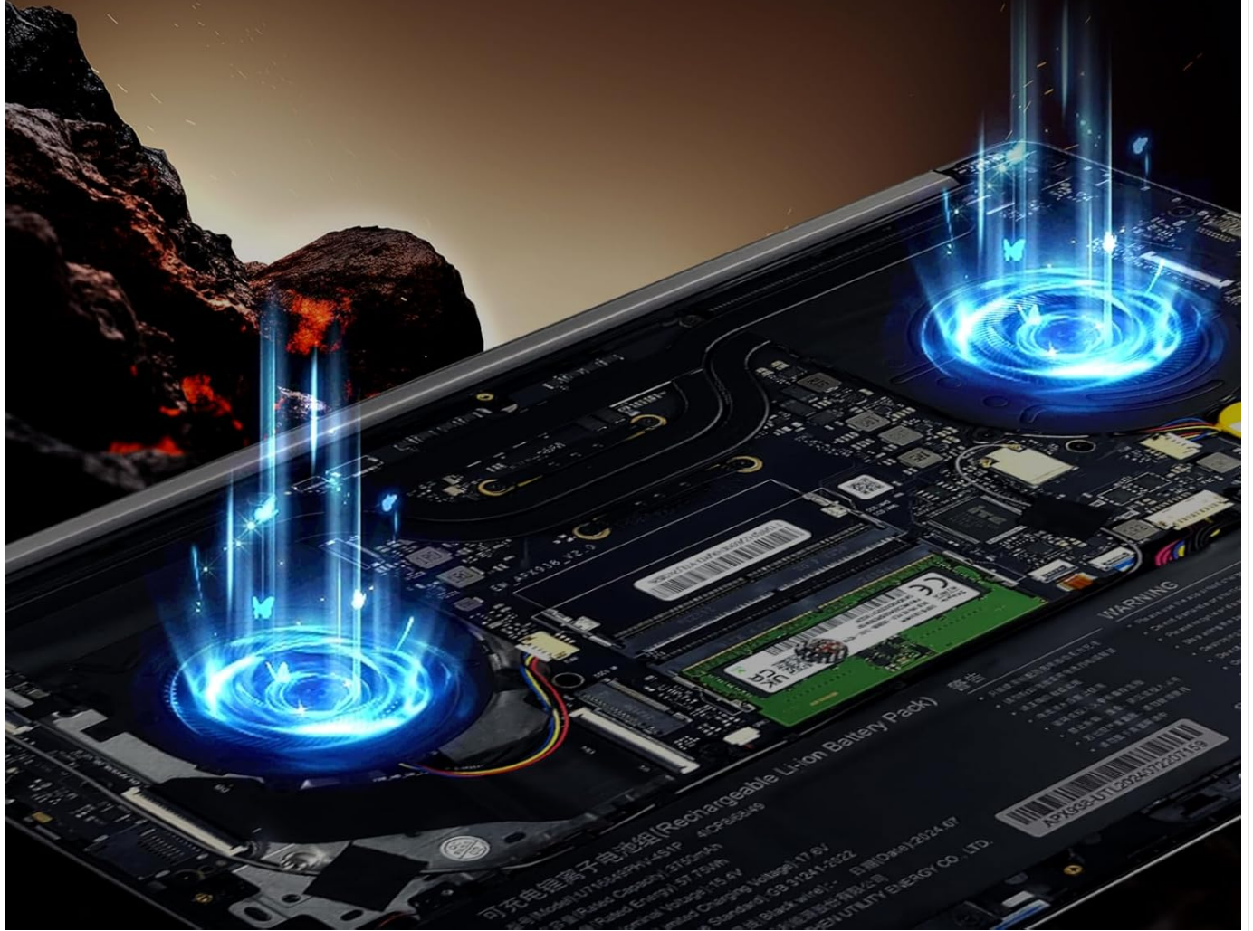
Figure 4: View of the laptop's dual-fan cooling system, designed to prevent overheating and ensure stable performance during intensive use.

With two powerful cooling fans, KurieTim laptop prevents overheating, provides a smooth gaming experience and enhances overall performance.