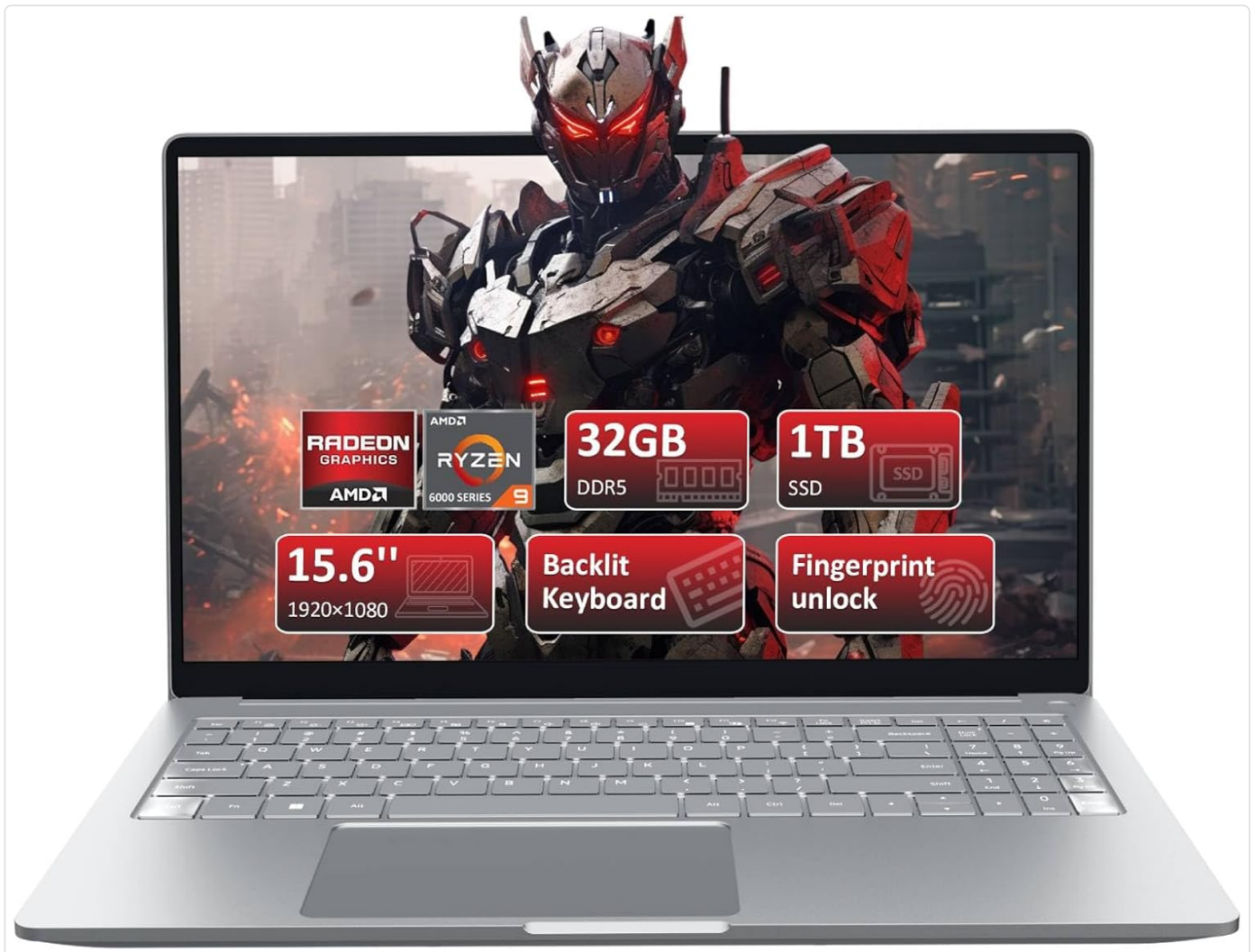
Figure 1: Front view of the KurieTim 15.6" Gaming Laptop, showcasing its display and key specifications like 32GB DDR5, 1TB SSD, 15.6" FHD screen, backlit keyboard, and fingerprint unlock.