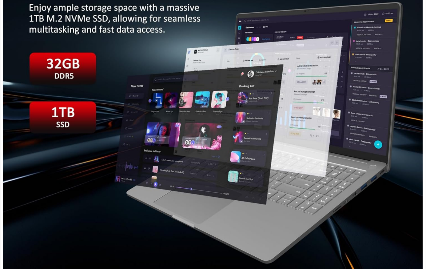
Figure 3: Illustration of the laptop's internal components, emphasizing the 32GB DDR5 memory and 1TB NVMe SSD for high-capacity storage and fast data access.