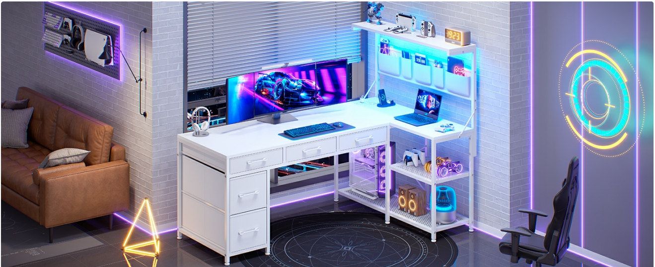
Figure 4.1: Reversible design options for the storage shelves.

The 4-tier storage shelves can be installed on either the left or right side of the desk to suit your space and preference. Refer to the specific diagrams in your printed manual for both configurations.