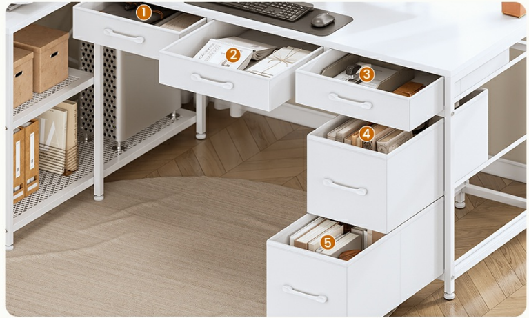
Figure 5.3: Fabric drawers for organized storage.