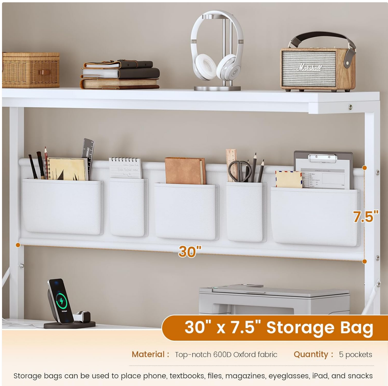
Figure 5.4: Multifunctional storage bag.