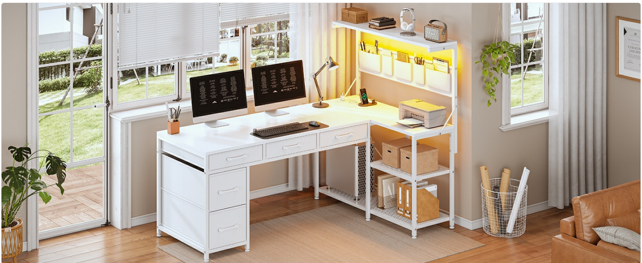
Figure 1.1: Fully assembled SEDETA L-Shaped Corner Computer Desk.

This manual provides detailed instructions for the assembly, operation, and maintenance of your SEDETA L-Shaped Corner Computer Desk. This versatile desk is designed to optimize your workspace with integrated storage, LED lighting, and a power outlet. Please read this manual thoroughly before assembly and use to ensure proper function and safety.