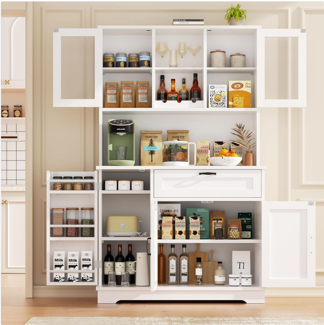
Image 4.1: The cabinet interior, showcasing various storage compartments and the removable wine rack.