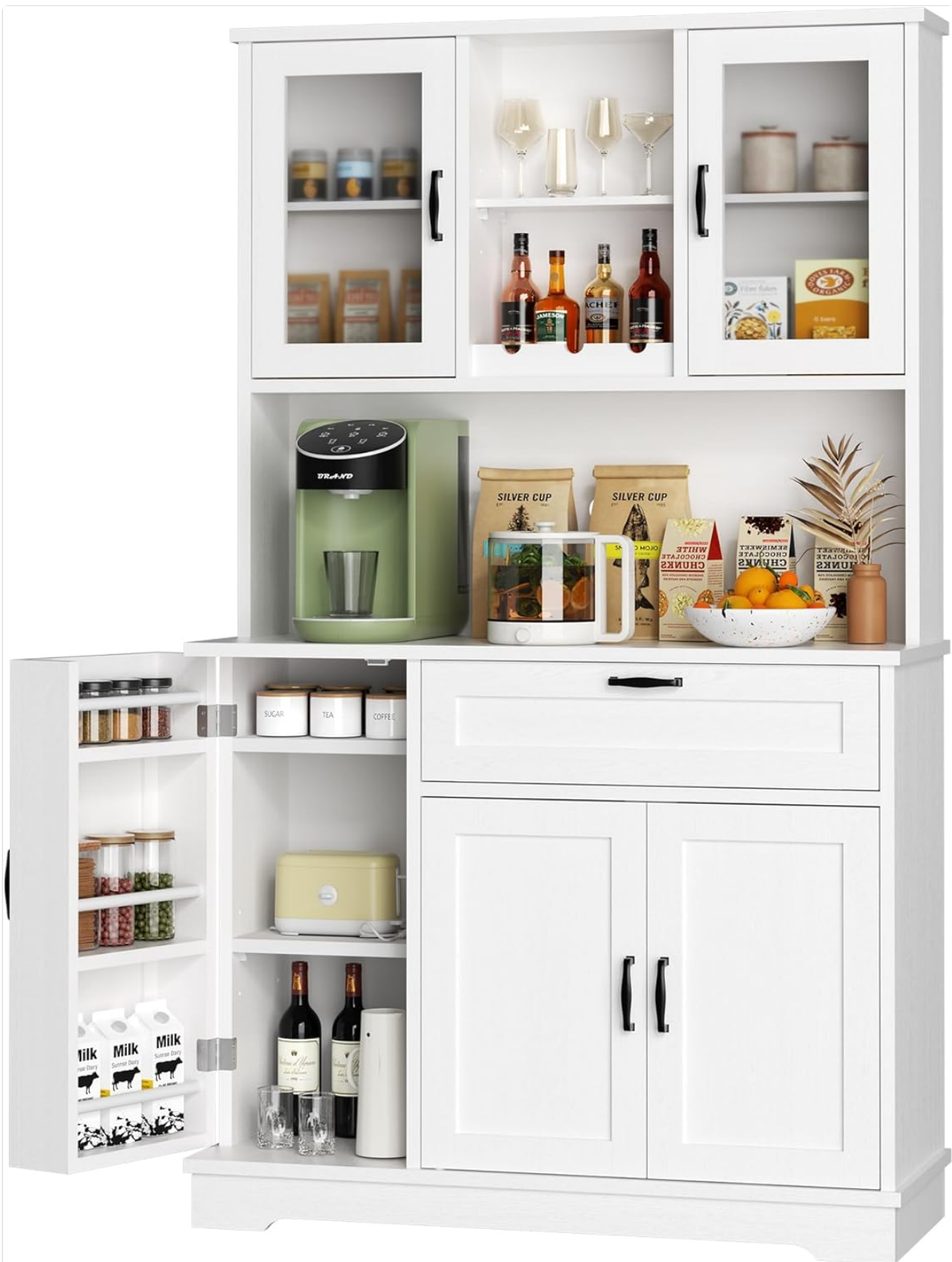
Image 1.1: Front view of the Vongrasig Tall Kitchen Pantry Storage Cabinet.