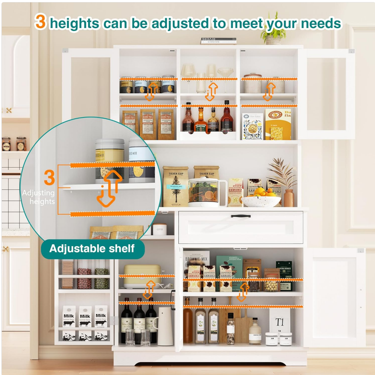
Image 5.1: Illustration of the adjustable shelf feature, demonstrating three possible height settings.