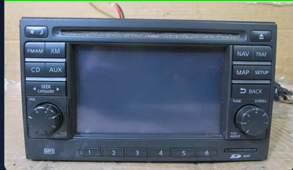
Image: Compatibility guide. Top-left shows an incompatible console, top-right shows a compatible console. Bottom-left shows a compatible wiring harness, bottom-right shows a compatible original radio unit.