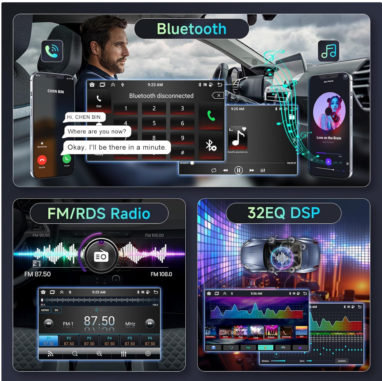
Image: Bluetooth, FM/RDS Radio, and DSP. This image highlights the Bluetooth hands-free calling feature, the FM/RDS radio interface for tuning into stations, and the 32-band Digital Sound Processor (DSP) for audio customization.