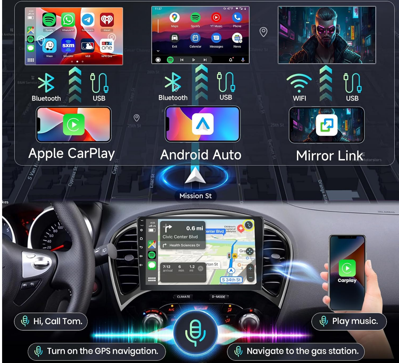
Image: Apple CarPlay, Android Auto, and Mirror Link. This image demonstrates the seamless integration of smartphones via wireless CarPlay and Android Auto, allowing access to navigation, music, and communication apps. It also shows the Mirror Link function.