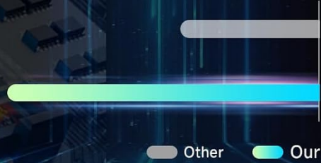
Image: WiFi Connection and Android 8-Core System. This image illustrates the stereo's ability to connect to WiFi for internet access and app usage, alongside a diagram highlighting the 8-core processor, 6GB RAM, and 128GB ROM for fast performance.