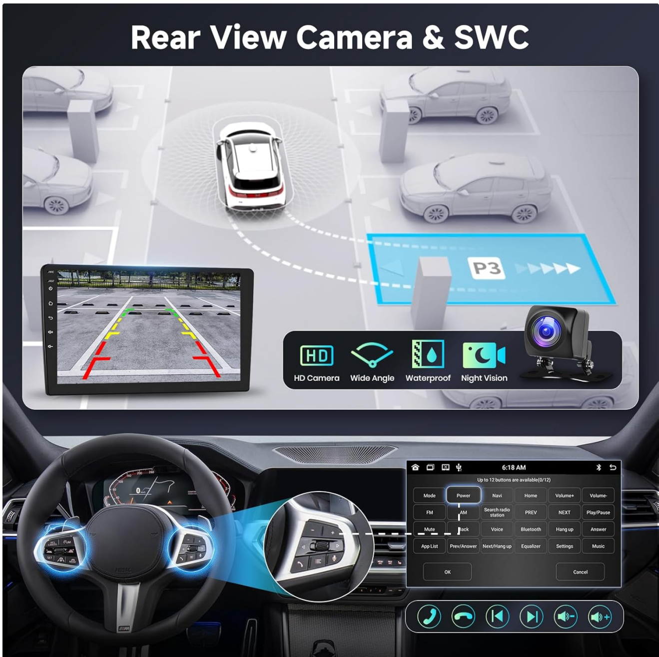
Image: Rear View Camera and Steering Wheel Control. This image illustrates the automatic display of the rear view camera feed when reversing, complete with parking guidelines. It also shows how the car's steering wheel buttons can control the stereo functions.

controls for safe operation of the stereo without taking your hands off the wheel.