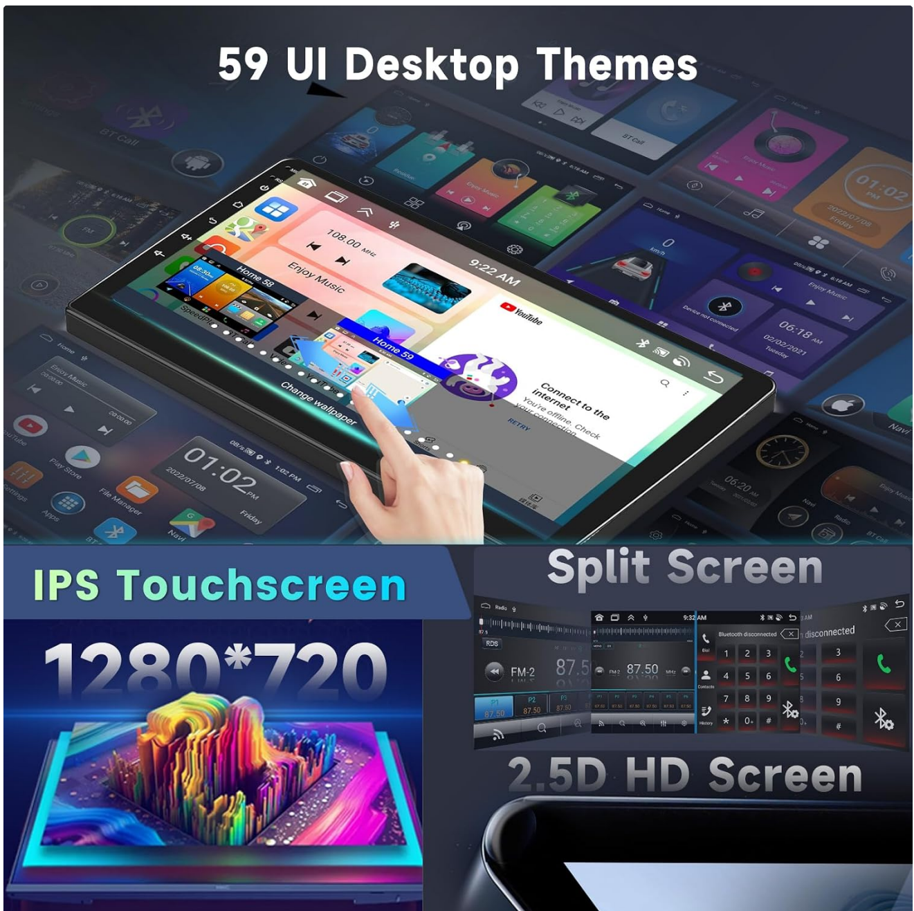
Image: Customizable Interface and Display Features. This image showcases the 59 available UI desktop themes, the split-screen function allowing multiple applications simultaneously, and the high-definition 1280x720 IPS touchscreen.