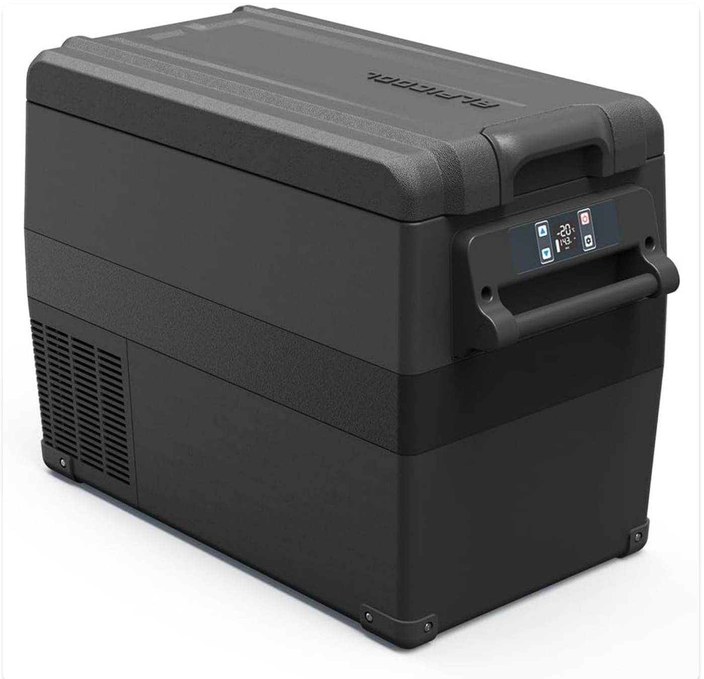
Image 1.1: The Alpicool NCF45 Portable Fridge Freezer, a compact and robust unit designed for mobile cooling needs.