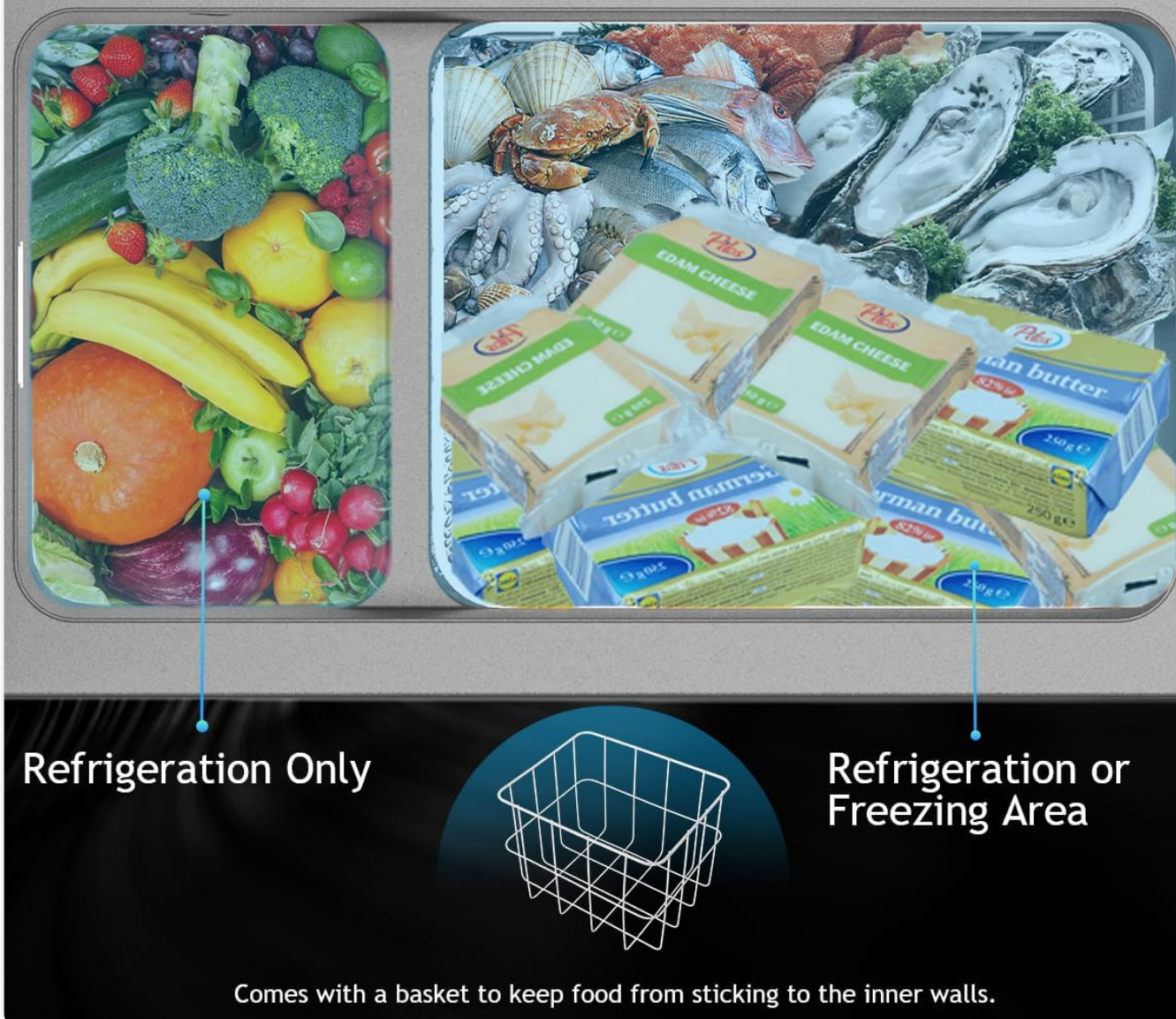
Image 3.3: Visual representation of the dual-zone large-capacity storage within the Alpicool NCF45, showing separate areas for refrigeration and freezing.

The unit comes with a basket to help keep food from sticking to the inner walls and organize contents efficiently.