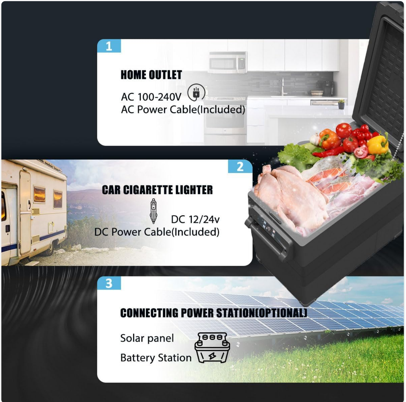
Image 2.1: Illustration of the various power connection options for the Alpicool NCF45, including home AC, car DC, and optional power stations.