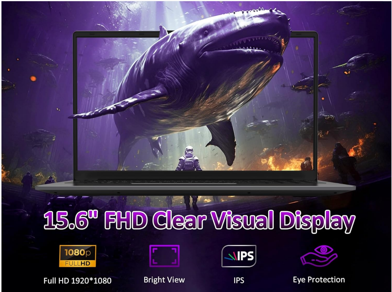
Image: The laptop's 15.6-inch FHD IPS display showcasing vibrant visuals.

The 15.6" FHD IPS display offers clear visuals. You can adjust display settings (resolution, brightness, night light) via 'Settings > System > Display'.