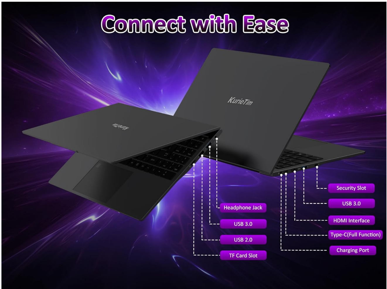
Image: Overview of the laptop's connectivity ports.