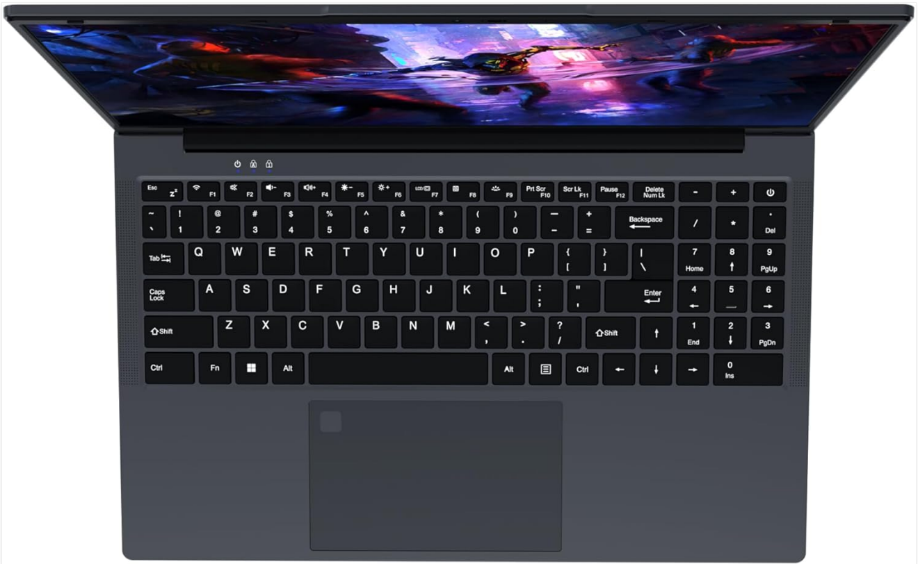
Image: The laptop's keyboard layout, including function keys and touchpad.